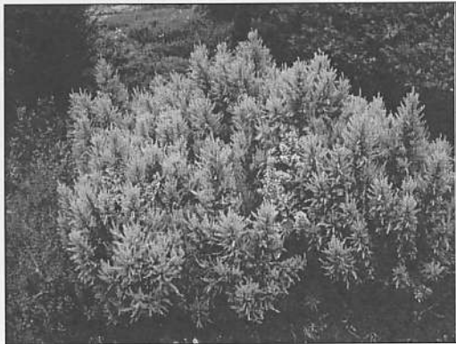
24 year-old Erica arborea "Estrella Gold", two years after hard pruning.

- Erica australis also came back [after hard-pruning], but it was not so old. If it is cut back I should think there is a good chance that new shoots will grow upright from the drunken stem. Daphne Everett