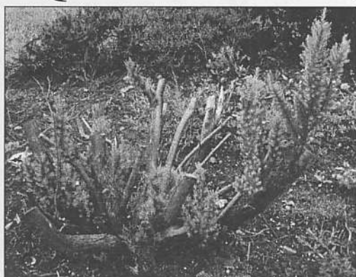
24 year-old Erica arborea “Alpina”, one year after hard pruning.