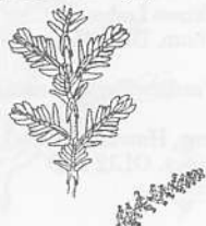
Calluna vulgaris 'Clare Carpet'

SQN LDR A TAYLOR, Altadena, Southview Road, Crowborough, E. Sussex, TN6 1HF