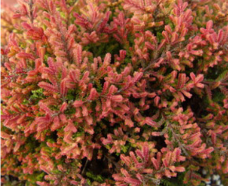
Winter foliage of an unknown Calluna