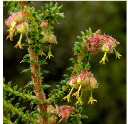
Figure 11 (left). Erica madagascariensis (see Figure 5).