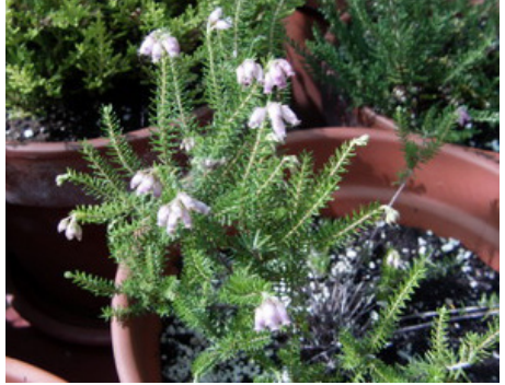
Erica terminalis , a Sardinian cutting.