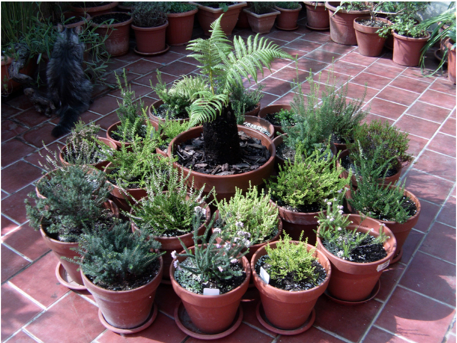
Part of my potted heather garden with a young tree fern ( Dicksonia antarctica ) in center (and Alaska, the cat, top left); summer 2010.

Once I had settled in a bit in my new place, I thought I'd try my hand at growing heather again. However, since my gardening space is a terrace, I am not able to plant anything in the ground, and therefore must grow everything in pots. I knew there would be some challenges: namely the heat and the lack of humidity. I certainly knew that unlike many parts of Britain and the Pacific Northwest in the USA, I wasn't living in a heather heaven, but rather the opposite, at least as regards Calluna and some other European species. Even the native species here are obviously not growing in pots on a hot terrace. Erica arborea and E. terminalis seem to prefer slightly acidic locations near water. The microclimate there is not the same as a sun-drenched terrace in the city. Although I was aware of these limitations, I decided to try anyway. I used ericaceous compost and plastic pots to help cut down on the amount of evaporation, since I figured (as many people would) that the main problem to be encountered here would be keeping them moist enough in the long, hot summers. At first, things seemed to be going well, until the full force of summer hit. I started to notice a rapid decline in many of my heathers. The tips of the branches would turn brown, and the brown would start to spread, leading, in many cases, to the demise of the plant. My losses were significant. Some were able to recover