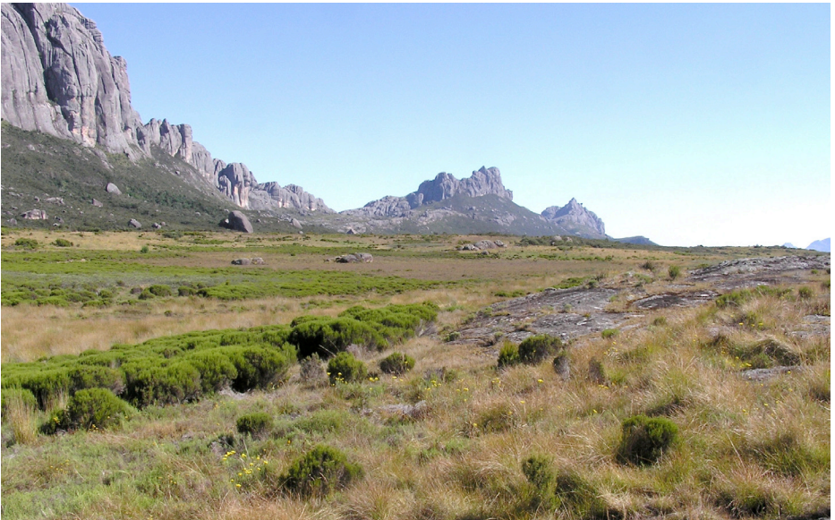
Figure 5. Andringitra, mid-altitude plateau (2,000m) with two species on the shallow soiled flats: low, dark green Erica rakotozafyana and the reddish brown mass of E. madagascariensis (see Figure 10) in a boggy area in the middle distance. Note the dense olive-green covering of heaths on slopes on the left.