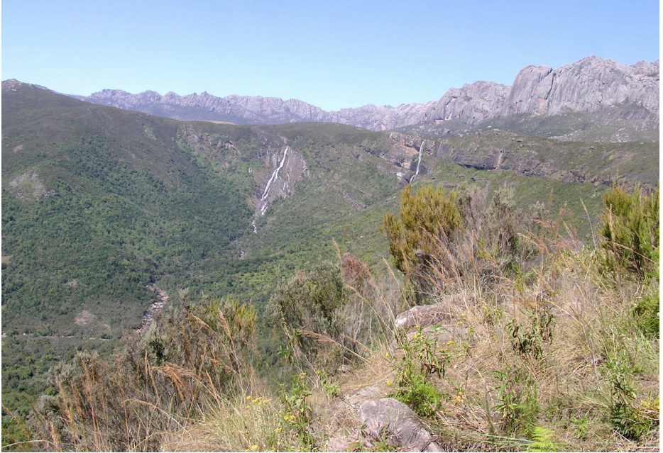
Figure 1. Andringitra National Park with two Erica species in the foreground and two large waterfalls (Riambavy, the queen, and Riandahy, the king) in the background.