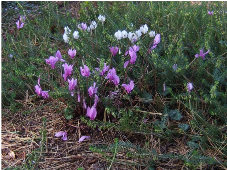
Long-established autumn-flowering cyclamen with spring-flowering heathers: Champs Hill, West Sussex.