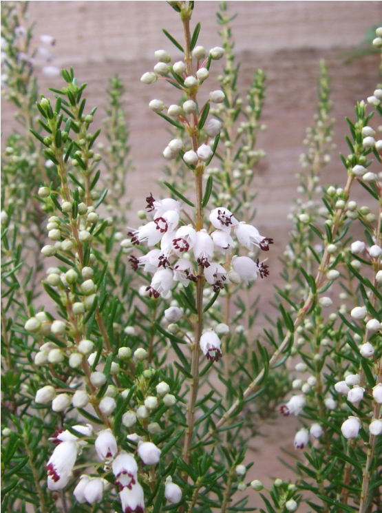
Erica manipuliflora 'Bert Jones': (above) growing in Toothill, Swindon ; (left) close-up of flowers, Outwell.