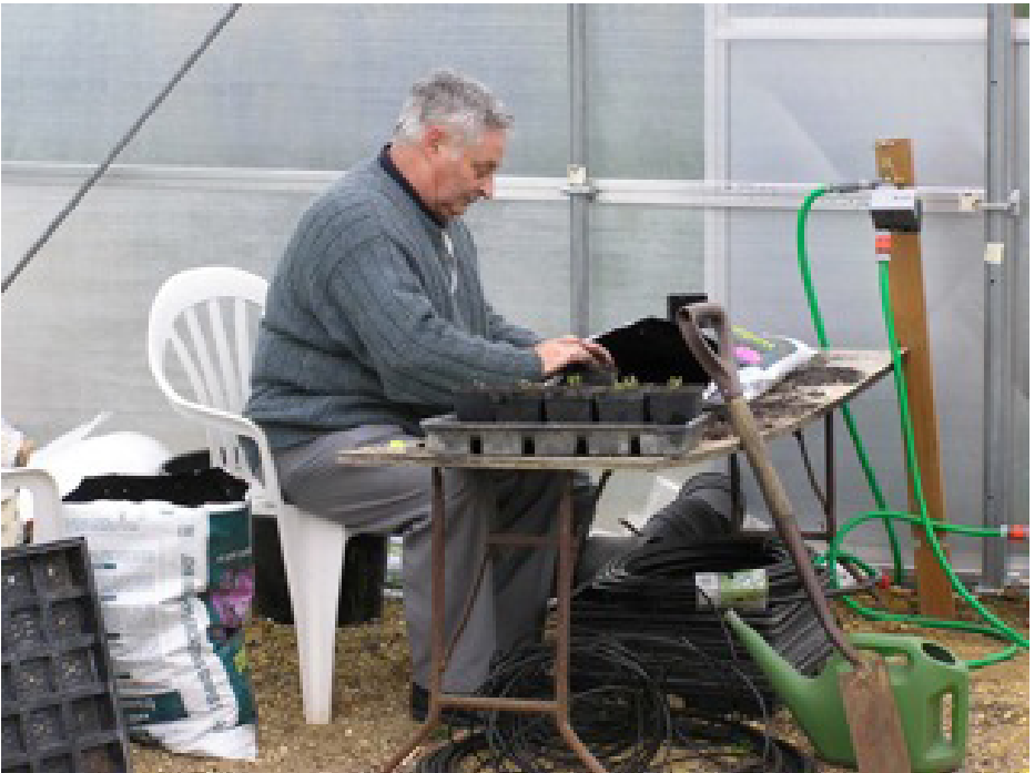
Potting cuttings of Cape heaths at Creting St Mary in June 2004.