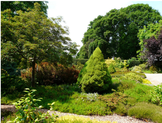
The centre-piece of this part of The Bannut is Picea glauca 'Albertiana Conica'.