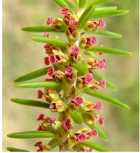
Figure 8 (both). Erica goudotian , very like E. scoparia from south-west Europe.

sometimes set alight by lightning strikes or nowadays by indiscriminate human burning practices. It would appear that only a few of the species are resprouters so burning could have a serious effect on the survival of the smaller, more delicate and rarer species.