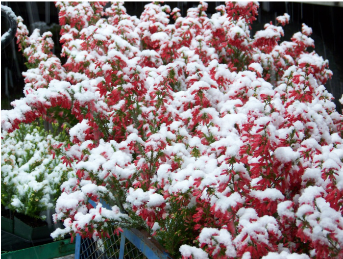
Erica 'Winter Fire' covered with snow, 17 February 2007.

A recent storm brought 8½ inches of rain in 36 hours. I figured that would be the end of this round of flowers from the battering they would get. Two weeks later, they are still just fine.