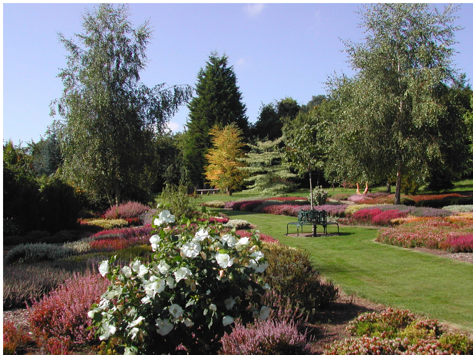
Hibiscus 'Diana' in The Bannut; all the hardy Hibiscus can be hard-pruned to keep them within bounds.

Companion plants provide extra colour, texture and form when and where they are needed most and this article is designed to help you to choose the most suitable for your own situation.