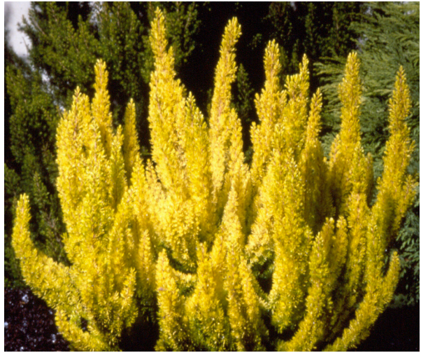
E. arborea 'Albert's Gold'