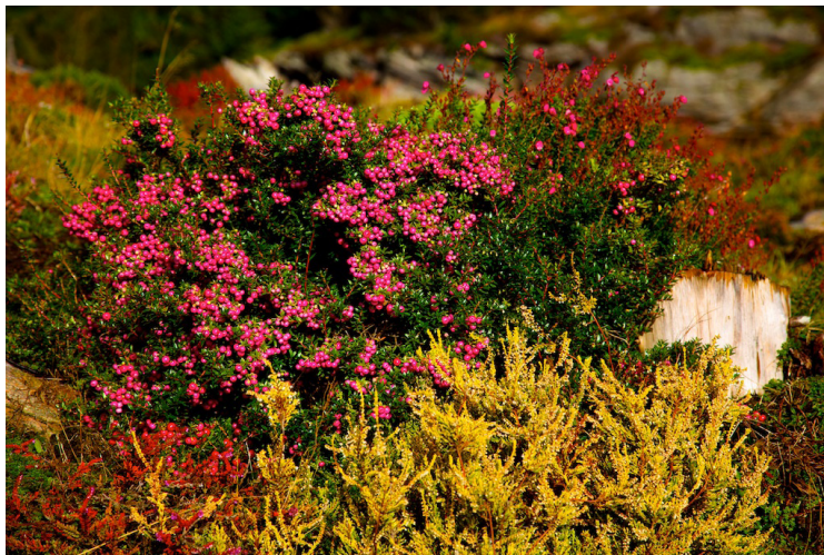
Berries on Gaultheria mucronata (syn. Pernettya mucronata ), a member of Ericaceae, vary from white to dark red; Egil Sæle's garden, Hellesøy, Norway.

preferring instead areas of cool, dappled shade. If it is possible to provide them with some shade from the hot midday and afternoon sunshine, they can look superb. One of the exceptions to this rule is Rhododendron yakushimanum and its many hybrids. R. yakushimanum grows naturally on the sunny mountain slopes of Yakushima Island, Japan. It is very hardy, will tolerate full sun and doesn't grow to more than 2 × 2m. There are now many colours to choose from.