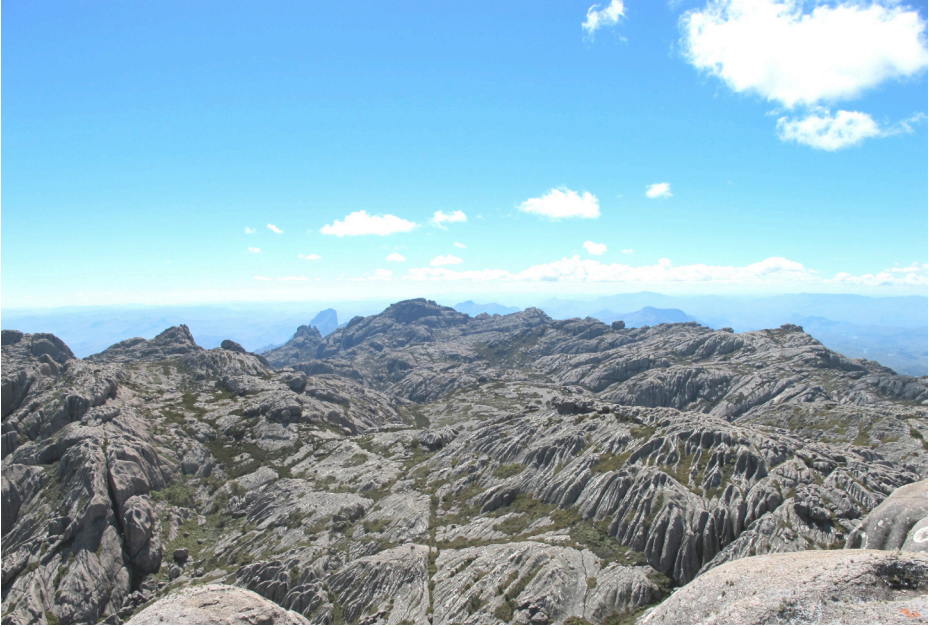
Figure 4. View of Ampadianombilahy Mountains from the summit of Pic Boby with numerous Erica species in all the vegetated places.