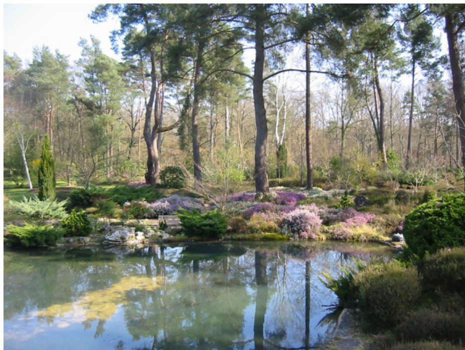
Les Grandes Bruyères in early April: Erica carnea and E. × darleyensis make a show just before the magnolias are at their peak.

Very soon, in the early 1970s, we visited British parks and arboreta. We discovered the heather gardens, and the heather nurseries. We drove by one of