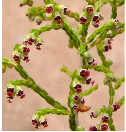
Figure 6 (both). Erica baroniiana .