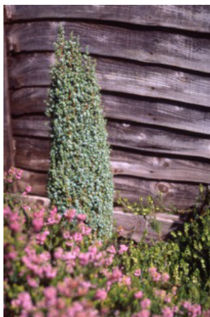
Conifers provide contrasting colours and shapes; (left) Cornish heath with a blue spruce ; (right) Juniperus communis 'Compressa' is a dainty, slender juniper.