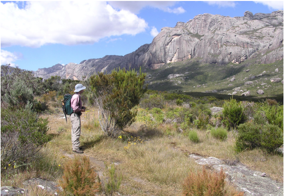
Figure 2. Mike Pirie investigating a tall Erica with two other smaller species nearby.