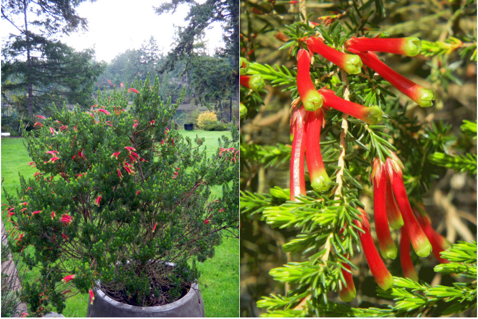
Erica speciosa . left: on 21 October 2010; right: flowers on 27 August 2010.

We use the same potting soil mix as the rest of the nursery plants. My husband does mix in some sand when he puts them in patio pots. I don't think that is necessary, but I cannot stop him! I do top dress with fertilizer in summer. I also give them a dose of Miracle Grow® every so often as I use that regularly on my hanging baskets. They are such vigorous plants that potting them up as needed makes for much healthier specimens.