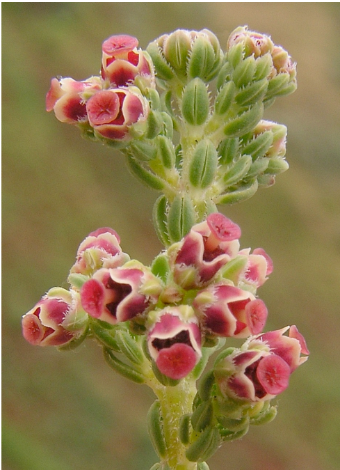
Figure 7. Erica boutonii .

The mountains are composed of impressive granite outcrops (Figures 1, 2 and 4). The central area has the second highest peak in Madagascar, Pic Boby (Imarivolanitra in Malagache) (altitude 2,658m). We easily got to the summit and had an amazing view of the range to the north (Figure 4). Apart from the forests in ravines and on sheltered moist slopes the open slopes are dominated by Erica species to the extent that they can sometimes form an impenetrable subforest with trees growing to 6m tall (Figure 1). Mostly they are 1–2m tall forming an olive-green ‘carpet’ over the slopes and in every gully (Figures 2, 3 and 4). Where there are shallow soils or boggy areas the heaths are small, low shrublets (Figure 5). There is no shortage of water in the park with many gushing streams (Figure 1), but despite this the vegetation is