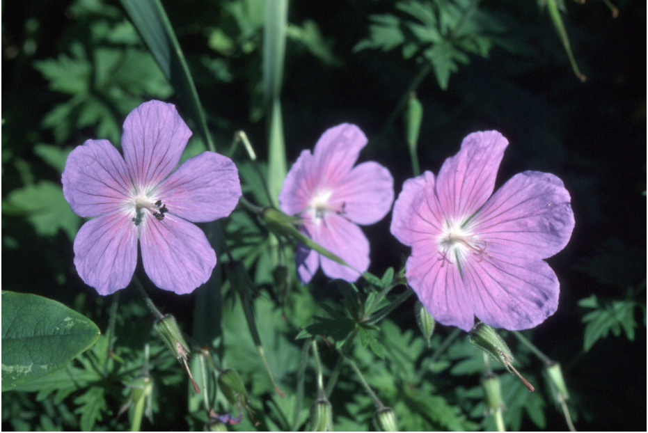
Geranium himalayense 'Irish Blue' is just one of the cranesbills that can be used in association with lime-loving heathers.