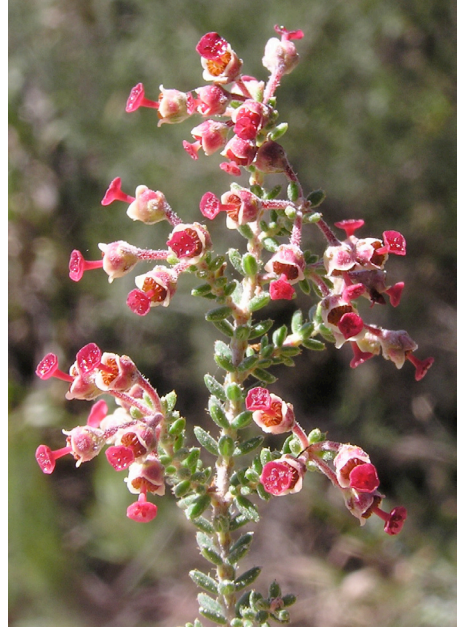
Figure 10 (right). Unidentified species of Erica .