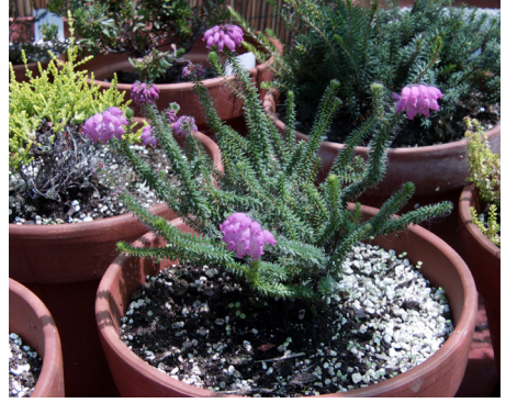
Erica mackayana 'Galicia', originally from northern Spain.