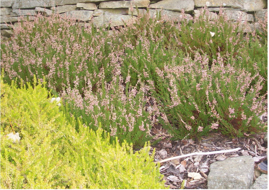
Calluna 'Spring Torch': October 2009, western (left) side recently pruned.