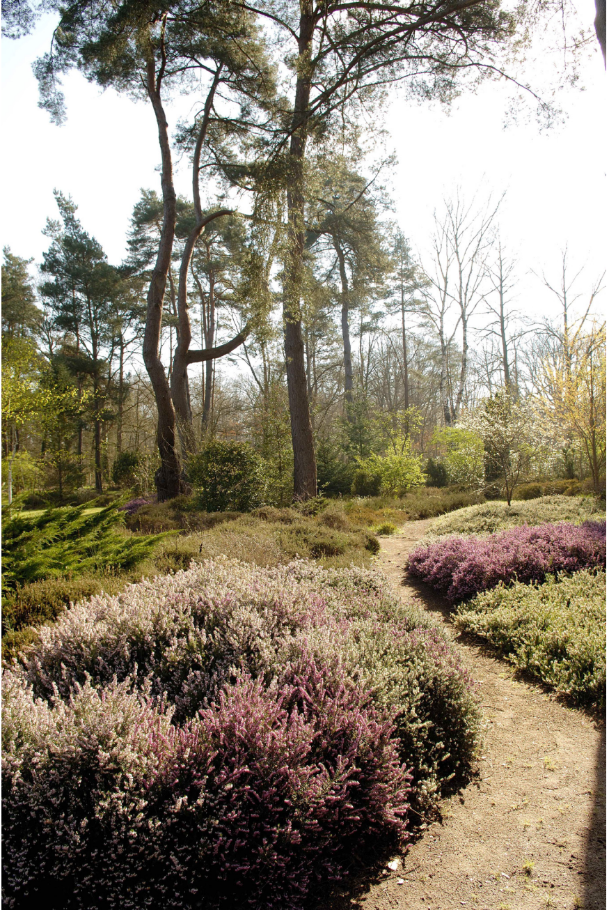
Arboretum des Grandes Bruyères, Ingrannes, France (see pp 16–19). Winter-flowering heathers match wonderfully with the Chinese magnolia in early spring when the trees and plants are still bare (B. de la Rochefoucauld).