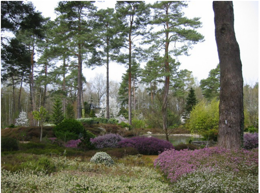
Mid-April, the heathers with Magnolia kobus and M. salicifolia (in the background).