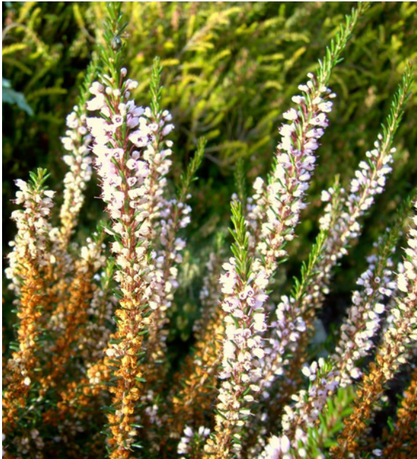
Erica manipuliflora 'Swindon Surprise': Autumn 2010, the original plant in the author's garden.

Most Erica manipuliflora cultivars and other, unnamed clones which I grow, have been found to be good garden plants. 'Olivia Hall' (from southern Turkey) is floriferous (Joyner 2007). So is the Corfiot clone, 'Don Richards'. If well pruned, 'Corfu' also has abundant flowers of a deep lilac pink but for a relatively short period. With global warming likely to lead to hotter, drier summers in southern