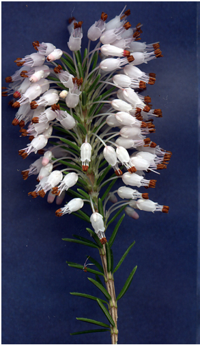
E. multiflora 'Formentor'