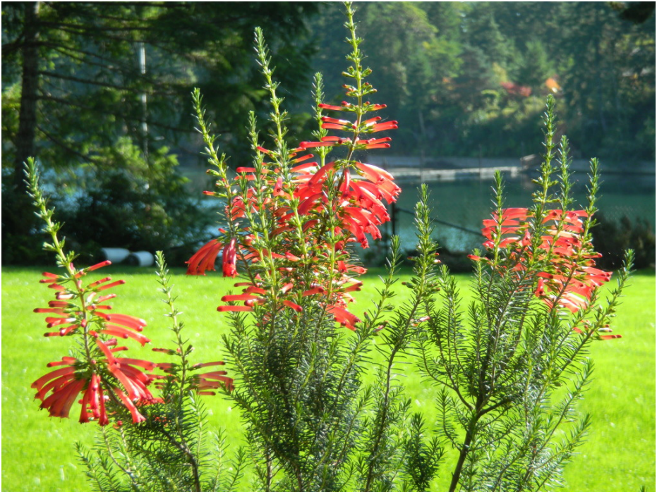
Erica cruenta 21 October 2010, with Jarrell Cove visible in the background.

Our temperatures are milder than on the mainland where my display garden is for Heaths & Heathers. There can be a 5° to 8° Fahrenheit difference over that eight mile stretch. The coldest I have seen it in 20 years on Harstine was 14°F; that was last December. Across the bridge at our display garden, it was 8°F. The damage was extensive at the display garden and none was observed on Harstine Island.