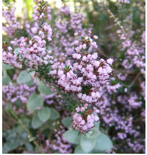
Erica manipuliflora 'Aldeburgh'