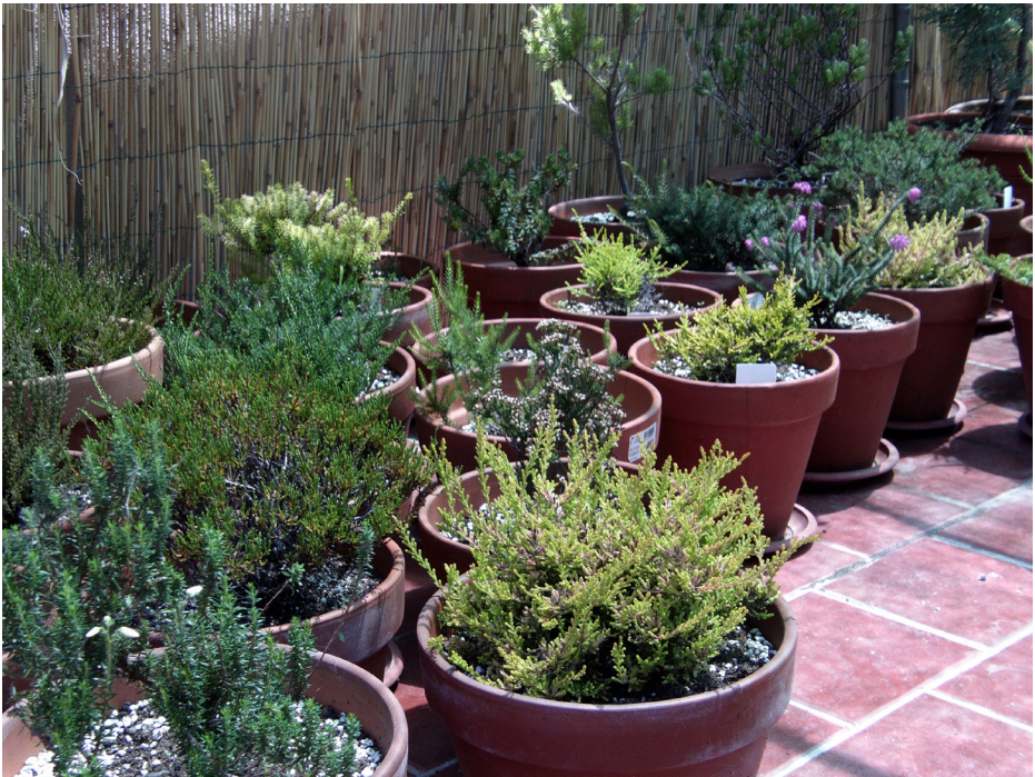
The patio pots, June 2010

Calluna – yellow-foliage cultivars need more shade. Don't be surprised if they don't flower in a hot, dry climate. I will experiment next summer with fertilizer, and additional water, etc., to see if I can get better results. Based on my experience, they are best grown for their foliage in this climate. As suggested in an old Heaths and Heathers nursery catalog, I would avoid the creeping cultivars in pots, as they may be more prone to fungus. The cultivars that I have which have performed well are 'Wickwar Flame', 'Carngold' and 'Firefly'.