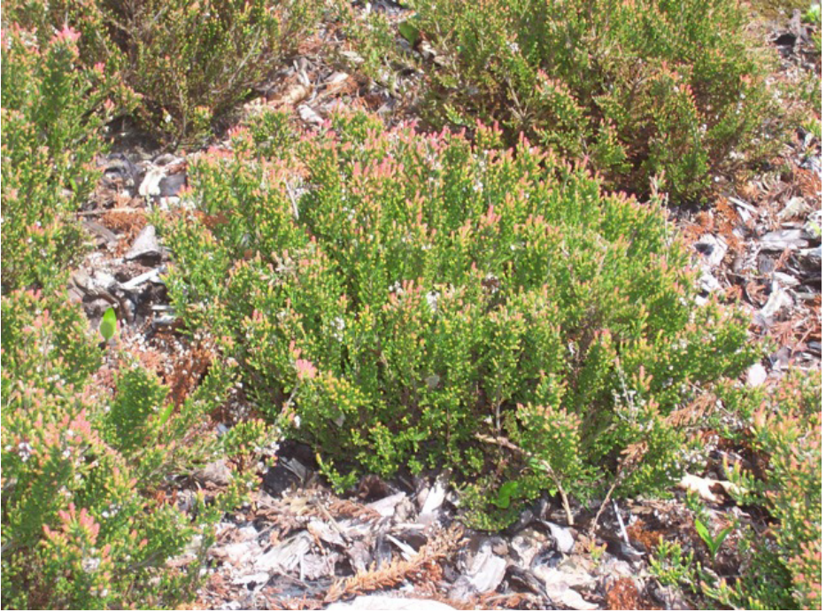
Calluna 'Spring Torch': May 2010, eastern side recently pruned.