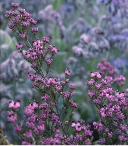
Erica umbellata 'David Small'