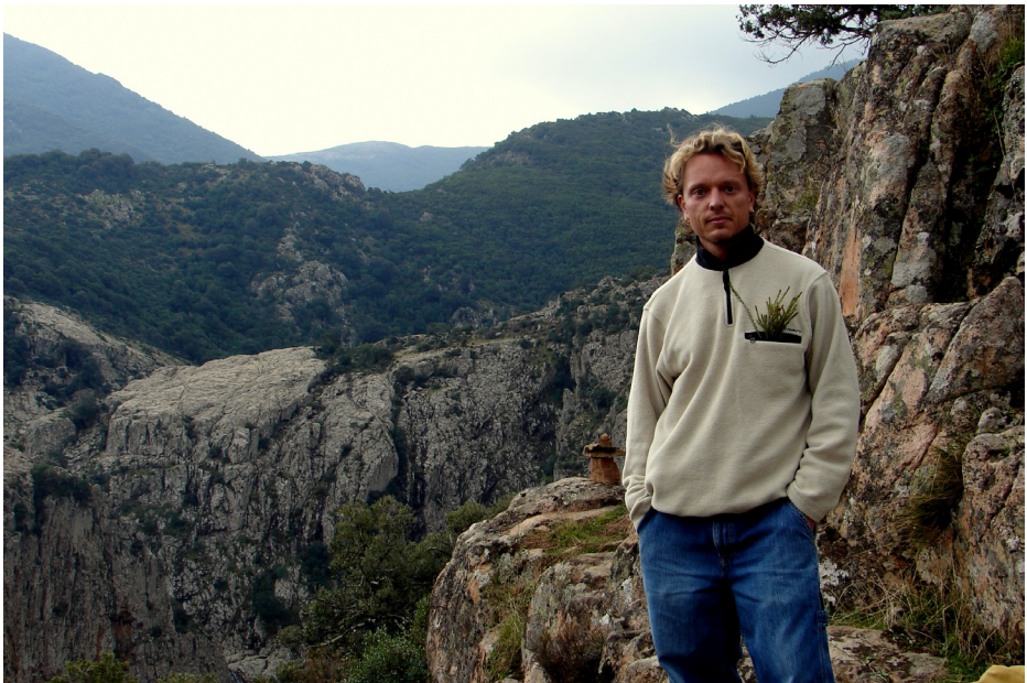
Hiking in the Sulcis Mountains, Sardinia; the cuttings in my front pocket are Erica terminalis .