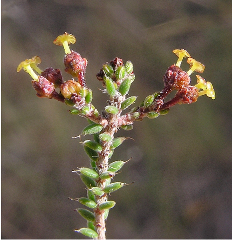
Figure 9 (above). Erica bojeri , sometimes with yellowish flowers and red stigma.