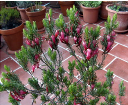
Erica plukenetii , Cape heath