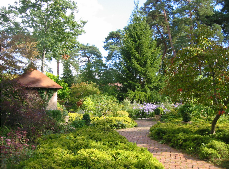
Summer at Les Grandes Bruyères; the yellow foliage belongs to Erica × darleyensis 'Jack H. Brummage'