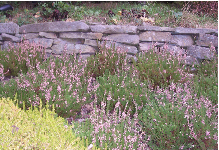
Calluna 'Spring Torch': the normal bed, 2009, spring, before the chop.