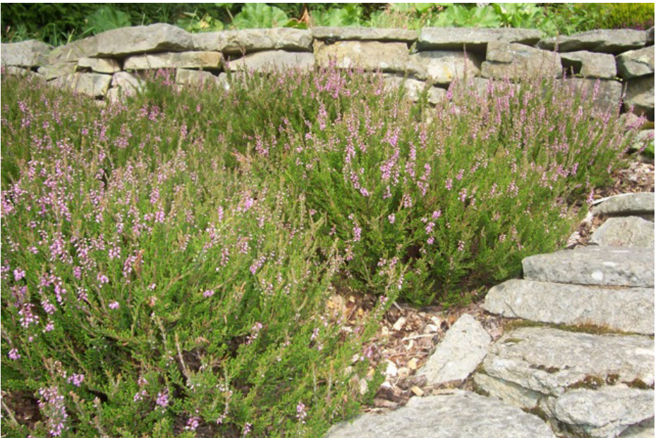
Calluna 'Spring Torch': Autumn 2010, showing more flowers on the left (west) than on the right.