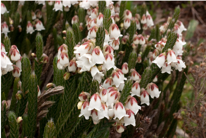
Cassiope – one of the "Askival" cultivars.

Other shrubs: During the period when neither heaths nor heathers are in flower—in May and June—their ericaceous cousins, Cassiope , Andromeda and Phyllodoce planted close to the footpaths will adorn the garden with their urn-shaped flowers.