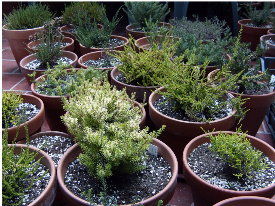
The heathers, June 2010; the foreground plant is Erica erigena 'Thing Nee'.

once the cooler autumn temperatures and rains arrived, but most did not. I tried replacing the plants and trying again, but always with the same results. Needless to say, I spent quite a bit of money with no positive results. Finally after losing a lot of plants again last summer, I'd had enough, and decided it was time to figure out what the problem really was.