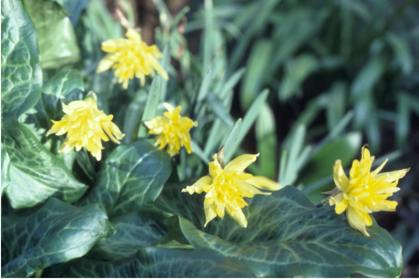
The old, dwarf, double daffodil called 'Rip Van Winkle'