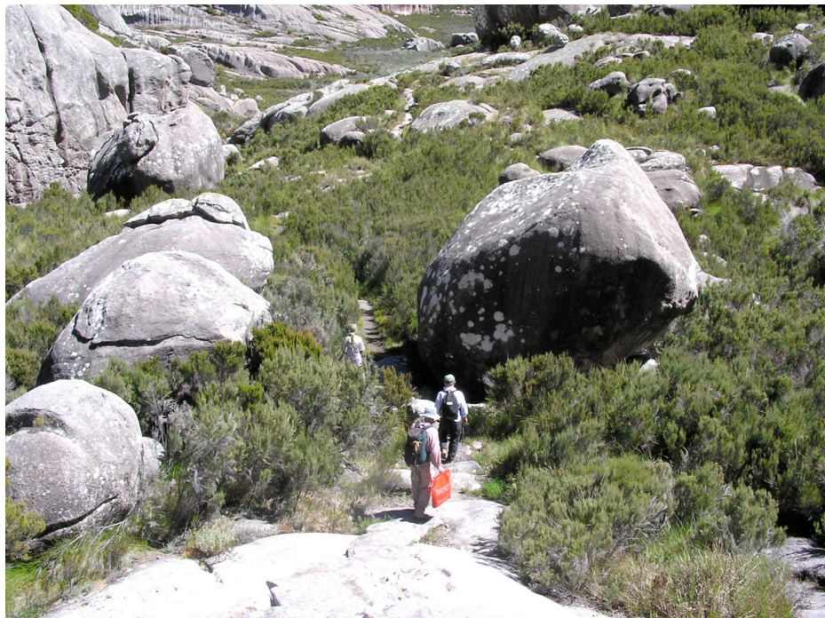
Figure 3. On the way up to Pic Boby through large granite boulders and dense stands of heaths.

of all the collections listed by Larry. The large, southern mountains of the Ampadiandombilahy Range fall mainly in the Andringitra National Park and this was our first objective (Figure 1). The 450km drive to Andringitra along a narrow, windy / winding, national road gave us our first glimpse of heathers growing on grassy hillsides with scattered eucalypts, pines and wattles, all weedy aliens of course. At one point we had to stop because of a very recent motorcar accident. This allowed me a quick visit to the nearby roadside slope which revealed five species of Erica in a hundred square metres! This is certainly the highest species diversity outside of the Cape.