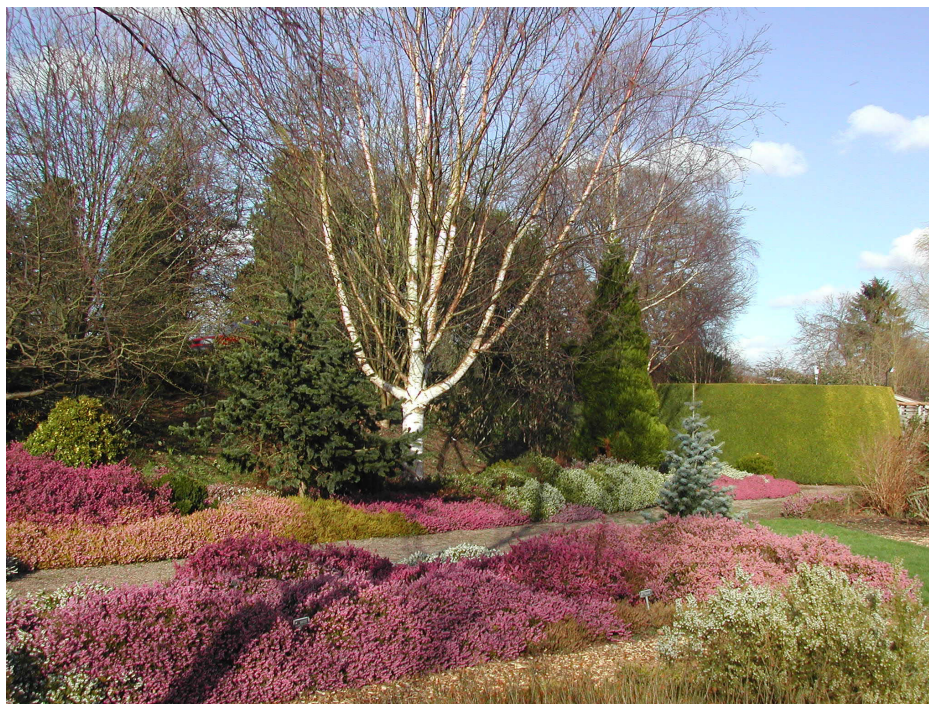
Paper birch in The Bannut.

Most birches have good autumn colour and the small leaves won't smother the plants growing beneath them when they fall. However, they do have one disadvantage, which is that the roots, some of which tend to run for some distance at ground-surface level, are very greedy and tend to rob the surrounding area of water and nutrients.