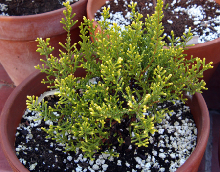
Calluna vulgaris 'Carnegold'