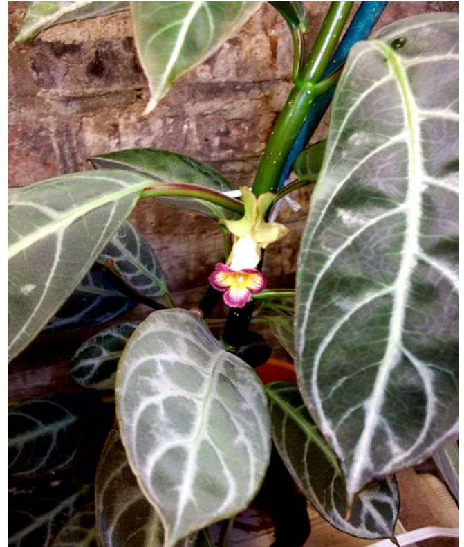
Drymonia chiribogana flowering in my basement under fluorescent lights.

I received a cutting of Drymonia chiribogana at a propagation workshop the National Capital Chapter offered to encourage members to grow plants for the sale at the Silver Springs, MD Gesneriad Society Convention they hosted in July 2009. I divided my cutting into several pieces and rooted them for the sale, but because of the handsome foliage decided to keep one.