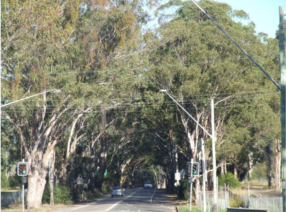
Above) Soldiers' Parade, forest red gums, along Campbelltown Road, Ingleburn, SW Sydney (Stuart Read)