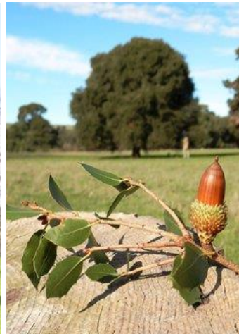
Above) Murndal's Gallipoli oak 'grandfather tree'- source of acorns for The Gallipoli oak project Above) Leaves and acorn of Gallipoli oak, Murndal