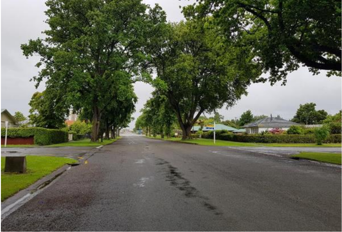
Above) Waimate Arbor Day avenue of oaks