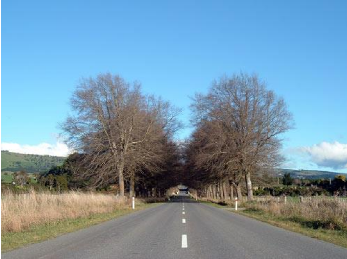
Gladstone, Wairarapa oaks