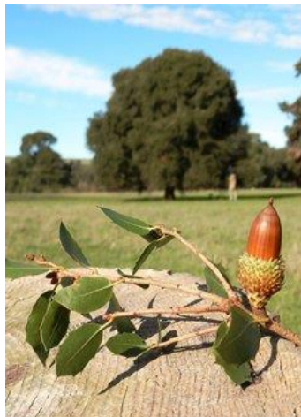
Above) Murndal's Gallipoli oak 'grandfather tree'- source of acorns for The Gallipoli oak project Above) Leaves and acorn of Gallipoli oak, Murndal