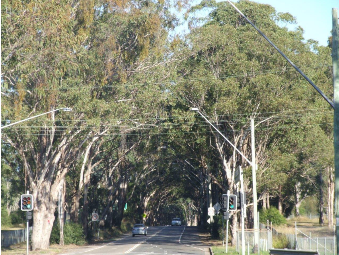
Above) Soldiers' Parade, forest red gums, along Campbelltown Road, Ingleburn, SW Sydney (Stuart Read)