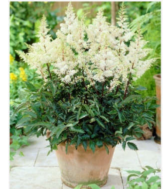
Rock N Roll