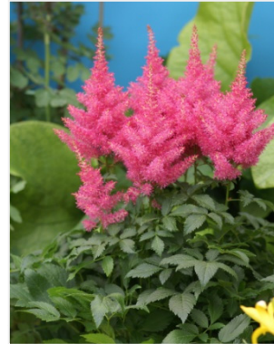
Drum & Bass