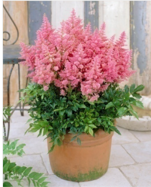
Country & Western