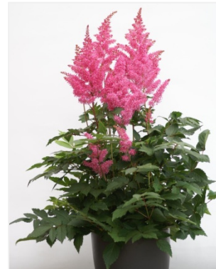
Rhythm & Blues