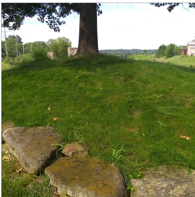
Figure 3. A mixture of strong creeping red fescue, Chewings fescue, and hard fescue being maintained as a "minimal-to-no mow" turf site under moderate shade in St. Louis, MO.

Once established, nitrogen fertilization should be limited to 1 to 2 applications per year, supplying a total of 0.5 to 2 pounds of nitrogen per 1,000 square feet throughout the growing season. Nitrogen fertilization rates should not exceed 2 pounds of N per 1,000 square feet throughout the growing season. The best time to fertilize fine fescues is in the fall (September-October). Fine fescues will respond to supplemental irrigation (1" of water per week during summer), but fine fescues will not thrive under persistently wet soil and generally prefer drier soil conditions. It is important to reduce or avoid traffic on fine fescue when turf is drought-stressed, particularly during summer heat, or damage will occur (Fig. 5).