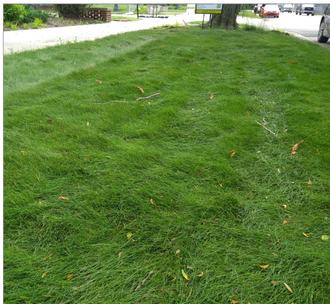
Figure 4. A mixture of 25% strong creeping red fescue, 25% slender creeping red fescue, 25% Chewings fescue, and 25% hard fescue on a shaded demonstration site on the campus of Purdue University in West Lafayette, IN, being mowed weekly at 3 inches.

When developing an irrigation program, it is important to know the type of soil at your site. For example, due to the construction process, recent construction sites and newer lawns are likely to have little topsoil, higher clay content and compacted soil at the surface. If the soil has a very high clay content or is compacted, it will poorly drain after rainfall or irrigation, which will likely cause a decline in fine fescue turfgrass quality and turf cover, especially during hot summer conditions. Soils with a high clay content should be amended prior to establishing a new lawn.