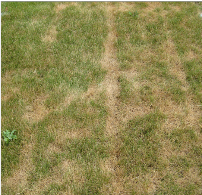
Figure 5. Foot traffic and mower traffic (notice straight lines) damage on strong creeping red fescue from mower traffic during hot summer drought conditions in late July.

Table 1 below shows the optimum time periods for various maintenance practices required to manage a fine fescue lawn or a fine fescue + Kentucky bluegrass lawn mixture based on typical central Indiana weather conditions. The optimum lawn maintenance period may occur earlier or later based on variations in annual weather conditions and/or locations within Indiana. For example, the optimum time periods during spring are commonly 1-2 weeks earlier for southern Indiana and about 1-2 weeks later for northern Indiana; the optimum time periods in the fall are commonly 1-2 weeks earlier for northern Indiana and about 1-2 weeks later for southern Indiana.