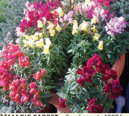
MAGIC CARPET - Seed count: 4000/g. Eden Seeds: Packet 3000 seeds $3.50, 10g $8.00, 50g $32.00

✗ GIANT MIX - Mixture of colours mostly reds and yellows. Seed count: 4000/g. Eden Seeds: Packet 3000 seeds $3.50, 10g $8.00