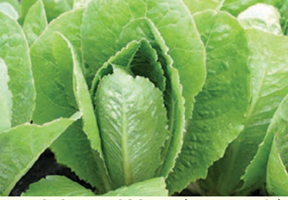
PARRIS ISLAND COS - Dark green upright open leaved, slightly savoyed, creamy white heart, vigorous and very uniform. Some disease resistance. 50-80 days. Eden Seeds: Packet 200 seeds $3.50, 5g $6.00,

LITTLE LEPRECHAUN - Romaine type, green base to leaf with purple tips, hardy amd productive. 60 days. Select Organic: Packet 130 seeds $4.00, 2g $6.00, 10g $26.00