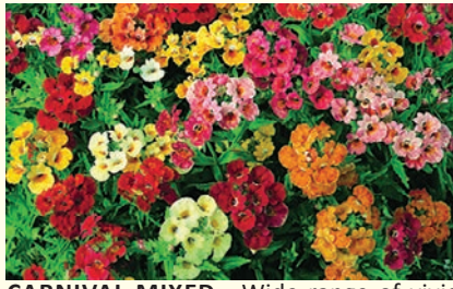
CARNIVAL MIXED - Wide range of vivid coloured large flowers, on compact bush to 20cm. Seed count: 5000/g. Eden Seeds: Packet 200 seeds $3.50, 2g $8.00, 10g $35.00

can take indoors, full sun or part shade, sow autumn and spring, cooler months in tropics.