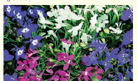
STRING OF PEARLS MIX - Mix of colours in pink, mauve, purple, white and blue. Seed count: 30000/g. Eden Seeds: Packet 3000 seeds $3.50, 2g $7.00, 10g $30.00