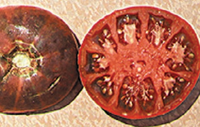
BLACK KRIM - Large flattened fruit to 90mm, red with purple blush, from southern Ukraine, hardy and good tasting, enjoy grilled with breakfast. Eden Seeds: Packet 100 seeds $3.50, 2g $6.00

Select Organic: Packet 40 seeds $4.00, 2g $6.00