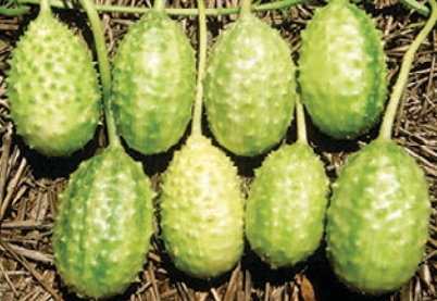
WEST INDIAN GHERKIN (Cucumis anguria) Prolific crops of oval green fruit to 75x40mm, use as fleshy pickles or relish, large vine, sow after frost. 60-65 days. (We cannot send to WA.) Eden Seeds: Packet 40 seeds $3.50

mosiac. 52-75 days Select Organic: Packet 25 seeds $4.00, 10g $12.00, 50g $34.00