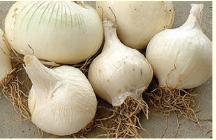
WHITE LISBON - Good for use as a bunching onion with bright green tops and long clearwhite mild sweet shanks or when mature as small bulb and for pickling. Eden Seeds: Packet 240 seeds $3.50, 10g $8.00, 20g $14.00, 100g $60.00 Select Organic: Packet 240 seeds $4.00