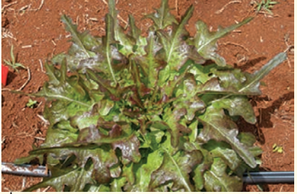
★ <u>OAK LEAF - PURPLE</u> - Purple tinge, loose leaf, stands heat and cold, sow anytime. (We cannot send to WA.) Select Organic: Packet 200 seeds $4.00