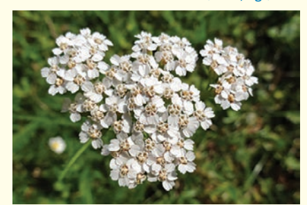
YARROW - WHITE (Achillea millefolium) White flowering variety, the preferred for medicinal use. Seed count: 7600/g. Eden Seeds: Packet 600 seeds $3.50

YARROW (Achillea millefolium) - Perennial from creeping rootstock. Repels insects. Organic potassium, copper, iron, sulphur. Soft feathery ground cover. Compost activator. Tea as blood builder. Healing and soothing effects on the mucous membranes. Sow after frost. Seed count: 7600/g. Eden Seeds: Packet 2500 seeds $3.50, 5g $7.00