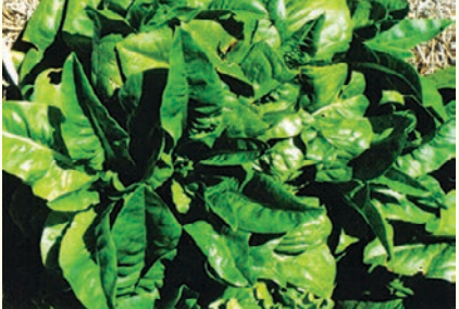
RABBIT EAR - Compact upright to 18cm, open hearted, small dark green pointed leaves. Stands heat, slow to bolt, excellent quality, tasty leaves. Sow autumn, winter, spring.

Select Organic: Packet 200 seeds $4.00, 2g $6.00