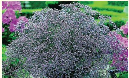
FAIRY MIX - (SEA LAVENDER) (Limonium latifolium) - Lavender blue sprays of flowers. Seed count: 1400/g.

Perennial, hardy once established, border plant used as cut and dried flower, full sun, well drained fertile soil, direct sow autumn to early spring.