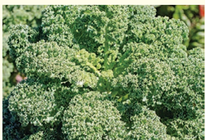
DWARF GREEN - Curled, light green leaves on short stems. 50-65 days. Eden Seeds: Packet 350 seeds $3.50, 20g $9.00, 50g $22.00

Eden Seeds: Packet 120 seeds $3.50, 10g $8.00, 50g $32.00