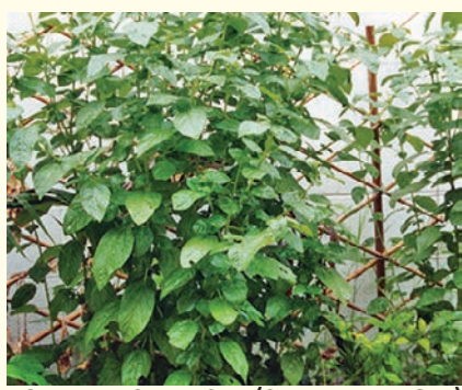
EGYPTIAN SPINACH - (SALAD MALLOW) (Corchorus olitorius) - Also known as salad mallow and malu khia. Green leaved bush to 1m used young as lettuce substitute in warmer areas or cooked like spinach. Popular in Mid-East and Asian countries. Sow spring summer. (We cannot send to WA.) Eden Seeds: Packet 120 seeds $3.50