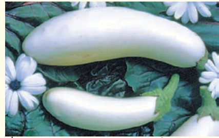
CASPER - Popular white fruit 5cm x 15cm, mild flesh, quick producing. 90 days. Eden Seeds: Packet 40 seeds $3.50, 2g $7.00