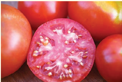
TROPIC - Round, firm red fruit to 10cm, rich flavour, disease hardy, suited to warm humid areas. 80-95 days. Eden Seeds: Packet 60 seeds $3.50, 2g $7.00

Eden Seeds: Packet 80 seeds $3.50, 2g $6.00, 20g $32.00