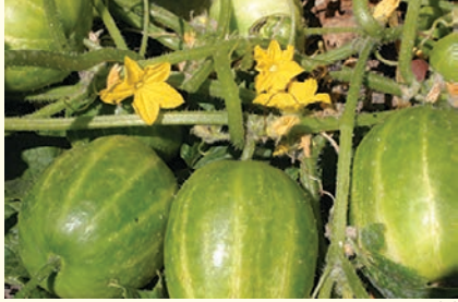
RICHMOND RIVER GREEN APPLE - Old Australian round apple variety. Eden Seeds: Packet 25 seeds $3.50, 10g $12.00, 50g $48.00

STRAIGHT EIGHT - Deep green, smooth straight cylindrical fruit with rounded ends, vigorous vine, prolific producer, resistant to