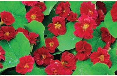
X CHERRY ROSE - Bright cherry rose flowers, born on top of semi-dwarf non trailing bush variety.

★ALASKA MIX - Flowers range in colour orange through to red also yellow, lightly variegated foliage, non trailing compact bush. Seed count: 8/g. Eden Seeds: Packet 30 seeds $3.50, 20g $8.00, 50g $21.00