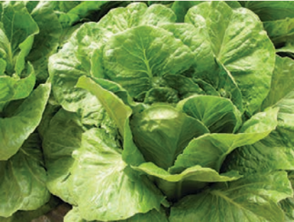
DOV - Dark green romaine type, extra sweet, heat tolerant, tip burn and wide range of other disease resistance. Select Organic: Packet 200 seeds $4.00

Eden Seeds: Packet 200 seeds $3.50 Select Organic: Packet 200 seeds $4.00, 5g $7.00, 20g $16.00, 100g $42.00