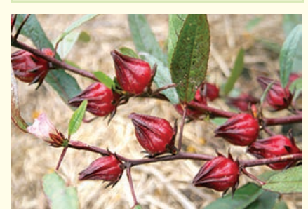
★ X ROSELLA (Hibiscus sabdariffa) -Seed count: 50-70/g. Eden Seeds: Packet 25 seeds $3.50, 20g $8.00, 50g $18.00

(Hibiscus sabdariffa) Popularly used for jam making and preserves. Likes long growing season usually 6 months frost free. Native to tropical West Africa, annual bush to 2m. Sow after frost. Seed count: 50-70/g.