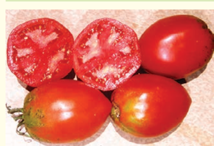
★ AMISH PASTE - Red heart shaped fruit 4-5cm wide and 5-12cm long, tasty solid flesh used for stews, bottling, drying and sauces, can be vigorous climber 2.5m. long. 82 days. Amish origin from circa 1880. Eden Seeds: Packet 40 seeds $3.50, 2g $8.00, 5g $16.00