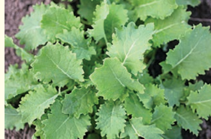
DWARF SIBERIAN - Blue green plume-like leaves with frilled edges, compact plant 300mm to 400mm, very hardy and prolific, will not yellow in severe cold. Eden Seeds: Packet 350 seeds $3.50, 20g $9.00.

Eden Seeds: Packet 350 seeds $3.50, 20g $9.00, 50g $20.00