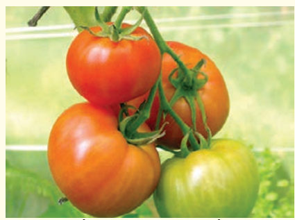
SUNRAY - (GOLDEN ORANGE) - Medium sized, smooth round light yellow-orange fruit to 70mm, clusters of 4 to 5 fruit, dense bush to 1m, productive and hardy. 72-85 days.

STUPICE - Extremely early, ideal for cool weather areas, to 1m, medium round red fruit to 50mm with rich flavour, third place in "Your Garden" taste test. 60-70 days. Eden Seeds: Packet 100 seeds $3.50