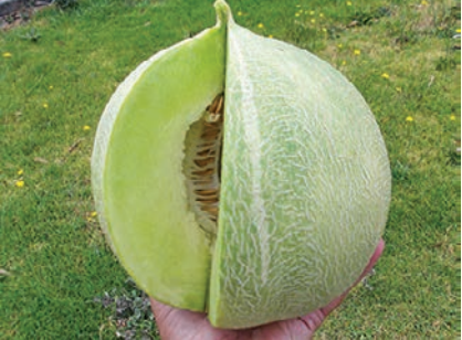
POMONA - Large green fleshed melon 2-3kg, delicious tasty melon developed by 'Garden Larder' for Australian home gardeners. Ripe when skin colour lightens. Eden Seeds: Packet 12 seeds $3.50

PLANTERS JUMBO - Sweet orange flesh, large oval shaped, vigorous vines for home or local market, handles drought and heavy rain, disease resistant. 85-91 days. Eden Seeds: Packet 30 seeds $3.50