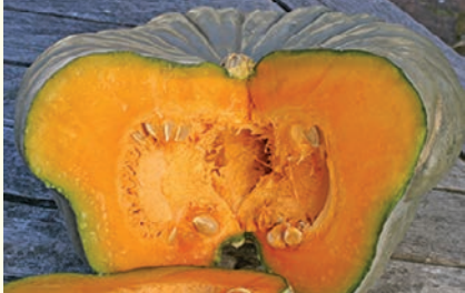
★ QUEENSLAND BLUE (Cucurbita maxima) Large pumpkin, dark slate grey heavily ribbed skin. Sweet, deep orange flesh. Top keeping pumpkin. 100-140 days. Eden Seeds: Packet 25 seeds $3.50, 20g $11.00, 100g $45.00, 400g $140.00