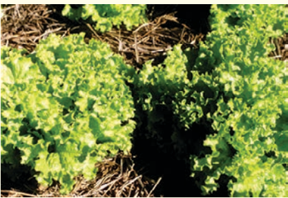
LOLLO BIONDO - Pale green cousin of Lollo Rosso, ruffled leaves, cut leaf by leaf. Eden Seeds: Packet 200 seeds $3.50, 5g $8.00, 20g $22.00

Select Organic: Packet 130 seeds $4.00, 5g $12.00, 20g $48.00