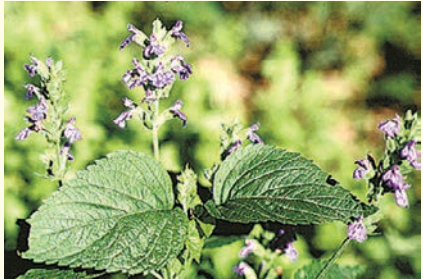
WHITE SEED - Also increasingly used in home cooking. Useful gel from soaked seeds is a food thickener to replace fat, increase fibre whilst reducing calories. Useful in salad dressings, yoghurt, dips and spreads. Does not effect the natural taste and flavours. Eden Seeds: Packet 12000 seeds $3.50, 100g $9.50, 400g $34.00

Annual to 1.5m. Tremendous energy food, benefits health and vitality. Leaves as salad or tea. Seeds rich in minerals, vitamins A, Bs, D; 30% protein. Seeds soaked in water is excellent thirst quencher. Natural enzyme acts as catalyst for protein. Regarded as a survival food. Useful forage plant. Use as sprouts in salad. Sow spring, summer. 120 days. Seed count: 1100/g.