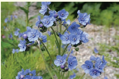
CHINESE FIRMAMENT BLUE (cynoglossum amabile) - Dainty blue flower, hardy plant, sow anytime. (We cannot send to WA.) Seed count: 185/g. Eden Seeds: Packet 100 seeds $3.50, 10g $7.00, 50g $28.00

(Cynoglossum amabile) Hardy annual plant to 70cm, dainty blue flowers, excellent cut flower, full sun or part shade, sow anytime, best in autumn. (We cannot send to W.A)