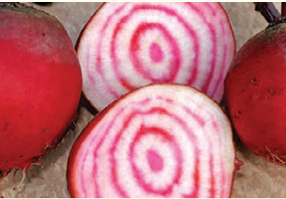
CHIOGGIA - (CANDY STRIPE BEET) - Red skin, red and white concentric rings, also mild flavoured salad green, Italian heirloom. 52-65 davs.

Eden Seeds: Packet 160 seeds $3.50 Select Organic: Packet 160 seeds $4.00