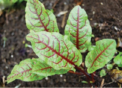
<u>RED-VEINED</u> - (BLOODY DOCK) (Rumex sanguineus) - Light green leaves with dark maroon veins and stem. Salad green best harvested young like spinach for salad mix

GREEN DE BELLEVILLE (Rumex acetosa) Pale green leaves to 80mm, fast growing, lemon flavour, productive French heritage variety from 1800's. Sow autumn and spring, tolerates shade, keep moist. (We cannot send to WA.) Eden Seeds: Packet 300 seeds $3.50