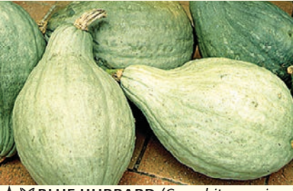
★ ★ BLUE HUBBARD (Cucurbita maxima) Blue-grey warted shell to 30cm. and up to 10kg, thick dry yellow-orange flesh, sweet and productive, good keeper. 100 days. Select Organic: Packet 12 seeds $4.00, 20g $18.00, 100g $60.00

Originating from central America. Once harvested these will store awhile. Sow spring and summer.