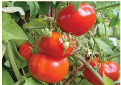
★SCORESBY DWARF - (KY1) - Round red fruit, excellent flavour, 4-6cm, great for preserves and sauce, disease resistant and could be used for rootstock.

<u>RUMSEY'S CROSS</u> - Flat red fruit to 10cm. Eden Seeds: Packet 40 seeds $3.50, 5g $11.00, 20g $34.00