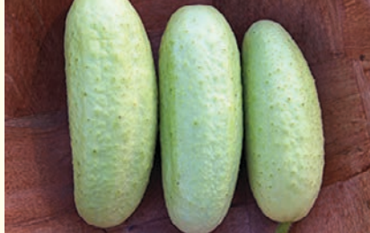
LONG WHITE - Good in salads or pickled. Fast grower. Excellent "apple" flavour. Tolerant of powdery mildew. 63-70 days. Eden Seeds: Packet 25 seeds $3.50, 10g $13.00, 20g $26.00, 100g $120.00, 800g $640.00