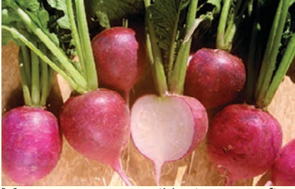
PLUM PURPLE - Mild crisp sweet firm white flesh, bright purple skin. 28-30 days. Eden Seeds: Packet 180 seeds $3.50, 20g $9.00, 50g $20.00

Select Organic: Packet 160 seeds $4.00, 10g $6.00, 50g $18.00