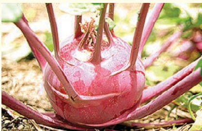
PURPLE VIENNA - Bulb and stems purple, flesh is white and sweet. 55-69 days. Eden Seeds: Packet 800 seeds $3.50, 20g $6.00, 100g $18.00

★ GIGANTE - (SUPER SCHMEL2) - Light green skin, white flesh, Swiss variety, does not go fibrous when large and mature, no bolting or woodiness, up to 9kg. 54-70days. Eden Seeds: Packet 250 seeds $3.50