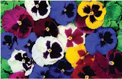
SWISS GIANTS MIXED - Seed count: 850/g. Eden Seeds: Packet 150 seeds $3.50, 2g $9.00, 10g $40.00

Hardy annual to 20cm, familiar multicoloured flowers, excellent in flower beds or containers, edible flowers, often as pressed flower, sunny or partly shaded position, heat and cold tolerant, sow summer and autumn.