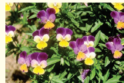
<u>HEARTSEASE</u> - (WILD PANSY) -Seed count: 1400/g. Eden Seeds: Packet 300 seeds $3.50, 2g $6.00, 10g $22.00

Old English flower, native of Spain, in older times used for its potency in love charms, such as in the "A Midsummer Nights Dream", edible flowers are purple violet and yellow with long flowering time, annual with medicinal uses, also know as "Johnny Jump Up", full sun or part shade, rich well drained soil, extend flowering by deadheading, sow after frost or in punnets earlier.