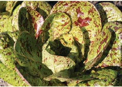
FRECKLES - Cos type, light green, with distinctive red splashes. Eden Seeds: Packet 200 seeds $3.50