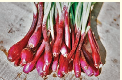
BUNCHING DEEP PURPLE - Red bunching variety which is highly coloured at all ages. Sow spring or summer in cooler areas. 60 days.