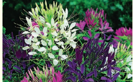
FOUR QUEENS MIX - Rose, lilac, mauve and white flowers. Seed count: 500/g. Eden Seeds: Packet 300 seeds $3.50, 5g $7.00, 50g $35.00

Seed count: 500/g. Eden Seeds: Packet 300 seeds $3.50, 10g $9.00, 50g $40.00