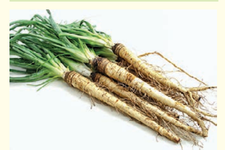
MAMMOTH SANDWICH ISLAND (Tragopogan porrifolius) - Oyster-like flavour, 6cm wide root tapered to 22cm long. Seed count: 80/g.

(Tragopogan porrifolius) Delicious white fleshed root crop, cultivate as for carrots and parsnips, though can be transplanted, use root like parsnip fried or boiled, new winter shoots give a nice flavour to salads, can over winter, young plants withstand light frost, mature plants withstand heavy frost. Roots store well at low temperatures and high humidity. Sow autumn and spring in cold climates. 110-180 days. Seed count: 60-80/g.