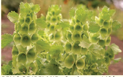
BELLS OF IRELAND - Seed count: 140/g. Eden Seeds: Packet 200 seeds $3.50, 10g $7.00

Hardy plant to 90cm, spikes to 60cm which is covered with ivory green bell-like bracts, extremely usefully as fresh or dried flower in arrangements, full sun or part shade, well drained soil, sow direct and shallow in autumn or spring, place seed in fridge for 5 days before sowing.