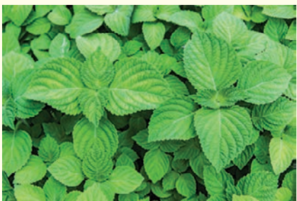
GREEN (Perilla frutescens) -Eden Seeds: Packet 90 seeds $3.50, 2g $7.00

Herb used in salads and cooking. Mild anise or licorice flavour. Called "shiso" in Japan and used in sushi, soups and noodle dishes, Chinese give it medicinal qualities. When cooked it is said to taste between mint and basil. In Korea it is called Perilla. Plants to 60cm. For best results, Perilla seeds should be cold stratified prior to sowing. To achieve this, mix the seeds with an equal quantity of moist sand and refrigerate (don't freeze) for a week.