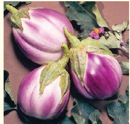
★ <u>ROSA BIANCA</u> - Vigorous Italian heirloom variety, abundant harvest of rosy lavender and white heavy teardrop shaped fruit. Mild flavour. 75-90 days. Select Organic: Packet 50 seeds $4.00, 2g $8.00

<u>RED RUFFLE</u> - Pick 50mm round green or red fruit, can be bitter when too old. Asian variety called Hmong Red, used in stir fry, also used in flower arrangements. Eden Seeds: Packet 20 seeds $3.50