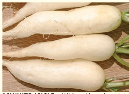
WHITE ICICLE - White skinned root to 15cm. Tender and mild flavour. Does not go pithy like other varieties when mature. Best summer variety. Sow all year. 40-60 days. Eden Seeds: Packet 350 seeds $3.50, 20g $9.00, 100g $25.00

Eden Seeds: Packet 160 seeds $3.50, 10g $9.00, 50g $36.00