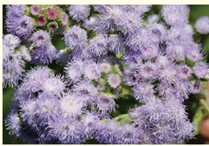
MARKET GROWERS BLUE - Dark blue, plant to 60cm. Seed count: 2400/g. Eden Seeds: Packet 1000 seeds $3.50, 2g $6.00, 10g $28.00

Scented annual border plant, nip to spread, useful cut flower, full sun, variety of rich well drained soils, sow spring and autumn, anytime in tropics.