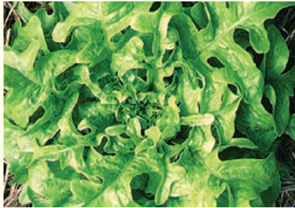
ROYAL OAK - Large rosettes of dark-green oak leaf shaped leaves, never bitter when hot, long standing. Sow anytime except summer. 50 days.