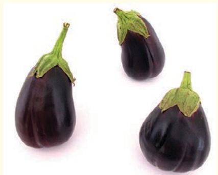
BLACK BEAUTY - Old standard, purplishblack smooth oval fruit to 160mm, fine flavour, bushy spreading plant to 80cm., does well in southern areas. 72-85 days. Eden Seeds: Packet 60 seeds $3.50, 5g $6.00, 20g $19.00, 100g $40.00 Select Organic: Packet 60 seeds $4.00, 5g $9.00, 20g $24.00, 100g $54.00

From India, developed in Spain in 16th century. Growing conditions as for tomato, though Eggplant needs a longer growing season, treat as perennial in warmer climates, annual in cooler areas. Can sow indoors up to 8 weeks before transplanting, harden for one week by taking off heat and put in full sun. Picking regularly encourages production. Sow early spring. Seed count: 200-250/g.