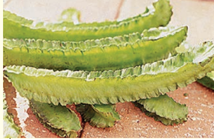
★ WINGED BEAN (Psophocarpus Tetragonolobus) - Tropical climber, all parts edible. Pods eaten when less than 100mm. Annual or perennial in tropics. Eden Seeds: Packet 20 seeds $3.50

★ NEW GUINEA BEAN (Lagenaria siceraria) - Actually a hard shelled gourd up to 2m long. Pick at 100mm to 200mm and eat like zucchini. Vigorous climber. Seed count: 3/g. Eden Seeds: Packet 10 seeds $3.50