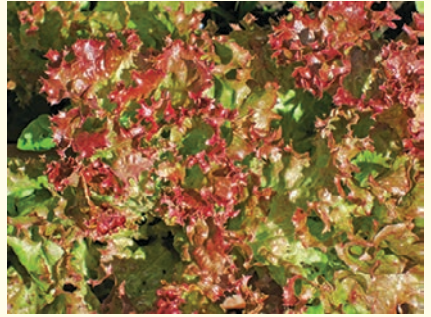
<u>RED CORAL</u> - Beautiful heirloom, attractive smooth non-hearting, red leaves with frilled edges. Sow autumn and spring. Select Organic: Packet 200 seeds $4.00, 2g $7.00, 10g $32.00

Select Organic: Packet 200 seeds $4.00, 2g $6.00