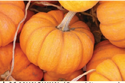
★ ★ MUNCHKIN (Cucurbita pepo) -Baby scalloped, bright-orange skin, sweet thick orange-yellow flesh, use baked or decoratively, holds firmness a long time. 100-110 days.

Eden Seeds: Packet 12 seeds $3.50 Select Organic: Packet 12 seeds $4.00, 10g $8.00