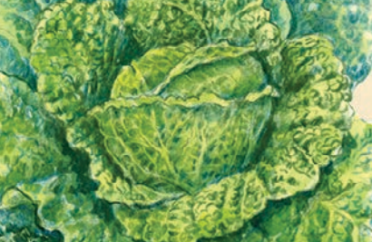
VERTUS - (SAVOY) - Large flattish head to 20cm with greyish-green finely crinkled leaves, good in salads or for cooking. vigorous. 80 days. Eden Seeds: Packet 120 seeds $3.50, 10g $7.00,

Eden Seeds: Packet 170 seeds $3.50, 20g $7.00, 50g $14.00