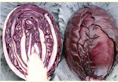
RED DUTCH - Large deep red to 3.5kg. Good for coleslaw, pickling, and steamed.

Mentioned in Australia in 1871. Sow spring and early summer, also late summer, autumn in warmer areas. 90 days. Eden Seeds: Packet 250 seeds $3.50, 20g $8.00, 100g $15.00