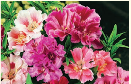
CAMELLIA FLOWERED MIX - Mix of violet, scarlet, rose and white, large double flowers, plant to 45cm. Seed count: 100/g. Eden Seeds: Packet 150 seeds $3.50, 5g $7.00

Annual for flower beds, boxes and pots, excellent in moist shady positions, average soil, neutral pH, sow autumn and spring, winter and spring in tropics, keep seeds moist.