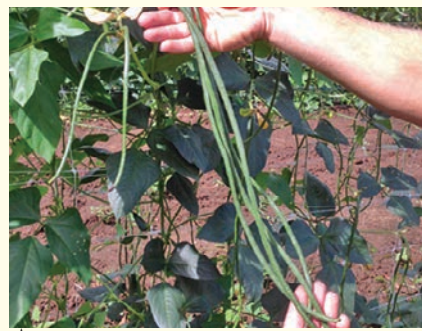
★ <u>SNAKE BEAN - RED DRAGON</u> (Vigna unguiculata var. sesquipedalis) - Long dark green pods, red seeded. Seed count: 6-8/g. Eden Seeds: Packet 50 seeds $3.50, 100g $16.00, 800g $110.00

SNAKE BEAN - BLACK SEEDED (Vigna unguiculata var. sesquipedalis) - Climbing with pods 30-50cm. Seed count: 8-10/g. Eden Seeds: Packet 50 seeds $3.50, 100g $18.00, 800g $128.00