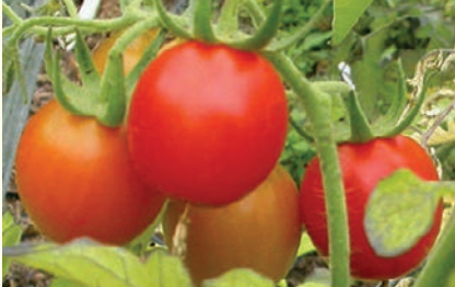
★ LECASE DI APULIA - Plum shaped red fruit to 50mm, Italian drying type, small plants.