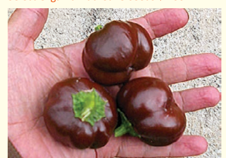
★ MINI CHOCOLATE - Sweet and colourful addition to small home gardens. Eden Seeds: Packet 18 seeds $3.50

★ MARCONIRED - Italian heirloom, ripens red, sweet, elongated up to 7cm x 30cm. Early producing. 80-100 days. Select Organic: Packet 25 seeds $4.00