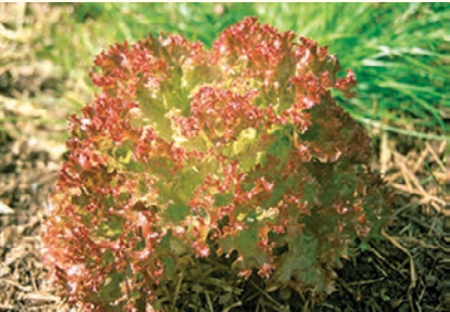
LOLLO ROSSO - Deeply curled looseleaf, beautiful magenta leaves, light green base. 30 days baby, 55 days full size. Eden Seeds: Packet 200 seeds $3.50, 5g $6.00,

50g $36.00 Select Organic: Packet 200 seeds $4.00,