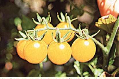
BROAD RIPPLE YELLOW CURRANT -Found growing in a pavement in Broad Ripple Indianapolis. Mass of sweet yellow fruit to 10mm, grape like bunches, doesn't split when left on vine and is fruit fly resistant. It Still survives harsh conditions and resows itself. 78 days.

Eden Seeds: Packet 80 seeds $3.50, 2g $8.00