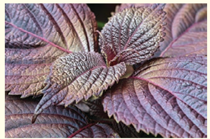
RED - (CRISPA) (Perilla frutescens) -Eden Seeds: Packet 90 seeds $3.50, 2g $7.00