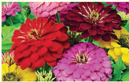
CALIFORNIA GIANT MIXED - Very large double flowers. Seed count: 140/g. Eden Seeds: Packet 250 seeds $3.50, 10g $6.00, 50g $28.00

Hardy summer flowering annual from America, gaily coloured long lasting flowers, nip first bud to spread plant, excellent cut flower, full sun, direct sow after frost when soil is warm, cooler months in tropics, or can start early indoors.