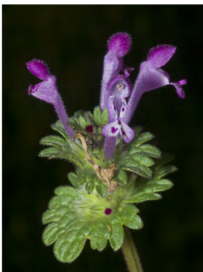
CLASPING HENBIT (Lamium amplexicaule) Naturalized Annual-Biennial - Mint Family -(Apr-Sep) - Disturbed sites, cult or abandoned fields - Stem 4-16" long. Leaf blades 0.4-1" long, upper stalkless. Flowers red-purple, gen 0.4-0.7" long.