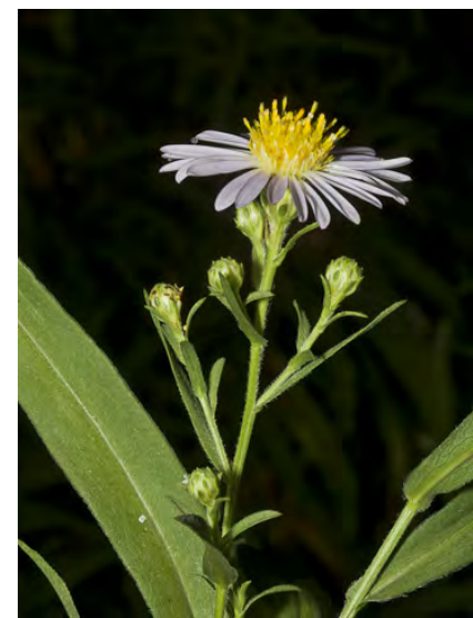
COMMON CALIFORNIA WILD ASTER (Symphyotrichum chilense) Native Perennial - Sunflower Family - (Jun-Oct) - Grassland, salt marshes, disturbed places - Plant 16-39", partly hairy. Leaf 1.6-6", 0.2-1.2" wide. Rays violet, 0.3-0.5" long.