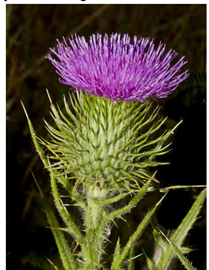
BULL THISTLE (Cirsium vulgare) Naturalized Biennial - Sunflower Family - (May-Oct) - Common. Disturbed areas - Plant 12-79" tall. Top of leaves bristly; leaf base forming decurrent wings on stem. Flowers purple, gen 1-2" wide. NOXIOUS weed.