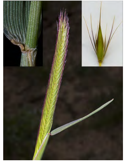
NORTHERN BARLEY (Hordeum brachyantherum subsp. brachyantherum) Native Perennial - Grass Family - (May—Aug) - Meadows, pastures, streambanks - Stem 1-3' tall, gen robust. Leaf sheaths gen smooth, blade < 7.5" long. Lemma awn < 0.25".