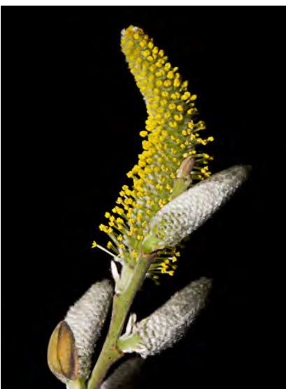
ARROYO WILLOW (Salix lasiolepis) Native Perennial - Willow Family - (Jan–Jun) - Common. Shores, marshes, meadows, etc - Shrub-tree, bark smooth. Leaf-like stipules. Leaf egg-shaped, waxy below. Fruit smooth, bract persistent, dark, stamens 2.