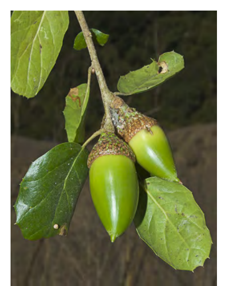
COAST LIVE OAK (Quercus agrifolia var. agrifolia) Native Perennial - Oak Family - (Mar-Apr) - Valleys, slopes, mixed-evergreen forest, woodland - Tree 30-80'. Leaves convex, hair-tuft below in vein axils. Acorns on 1st year twigs, shell glabrous inside.