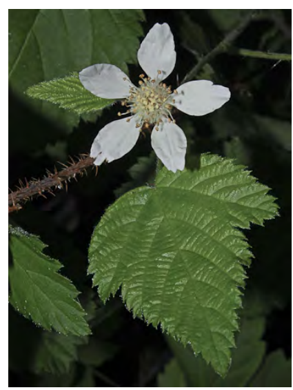
CALIFORNIA BLACKBERRY (Rubus ursinus) Native Perennial - Rose Family - (Mar–Jul) - Open, disturbed areas - Stem round, bristly/prickly. Leaves simple to 3 leaflets, underside green. Plants unisexual. Petals 0.24-0.6" long, white. Blackberry-type fruit.