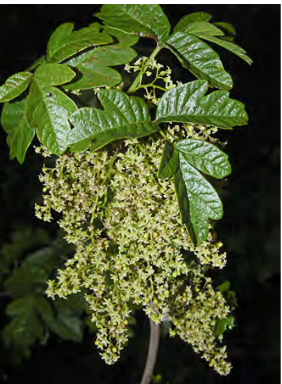
WESTERN POISON OAK (Toxicodendron diversilobum) Native Perennial - Sumac Family - (Apr-Jun) - Canyons, slopes, chaparral, coastal scrub, oak woodland - Shrub or vine. Leaflets 3, red in fall, mid leaflet stalked. Flowers green. Fruits white. TOXIC.