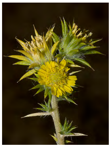
CONGDON'S TARPLANT (Centromadia parryi subsp. congdonii) Native Annual - Sunflower Family - (Jun-Oct) - Terraces, swales, floodplains, grassland, disturbed sites - Main plant not sticky or short-hairy. Spiny. CNPS: ENDANGERED.