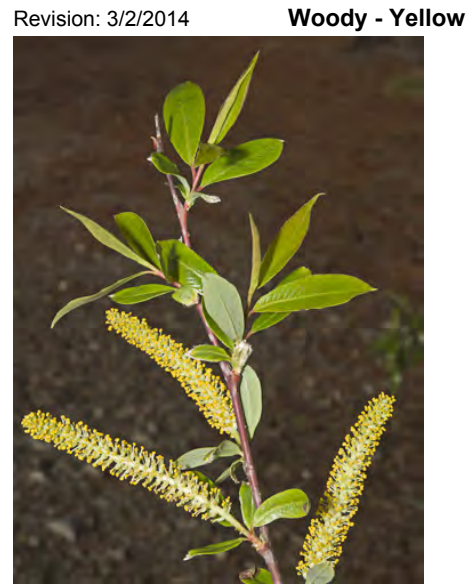
RED WILLOW (Salix laevigata) Native Perennial - Willow Family - (Dec–Jun) - Common. Riverbanks, seepage areas, lakeshores, canyons - Tree bark fissured. Leaf lanceolate, glaucous below, gen w/stalk glands. Stamens 5. Fruit glabrous.