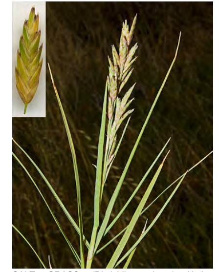
SALT GRASS (Distichlis spicata) Native Perennial - Grass Family - (Apr–Sep) - Salt marshes, coastal dunes, moist, alkaline areas - Stem 4-20" long. Leaves 0.8-4" long, flat, stiff. Flower cluster 0.8-3" long, narrow. Spikelets straw-colored to purple, 2-20/group, 0.24-0.8" long