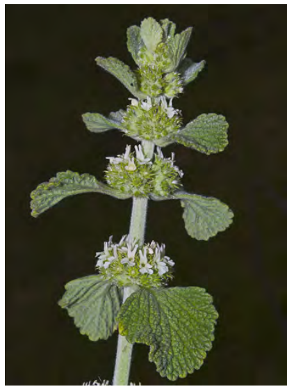
COMMON HOREHOUND (Marrubium vulgare) Naturalized Perennial - Mint Family - (Mar-Nov) - Disturbed sites, gen overgrazed pastures - Stem 4-24" long. Leaf blades 0.6-2.2" long. Flower bract w/10 hook-tipped teeth. Flowers white, ~0.2" long. INVASIVE.