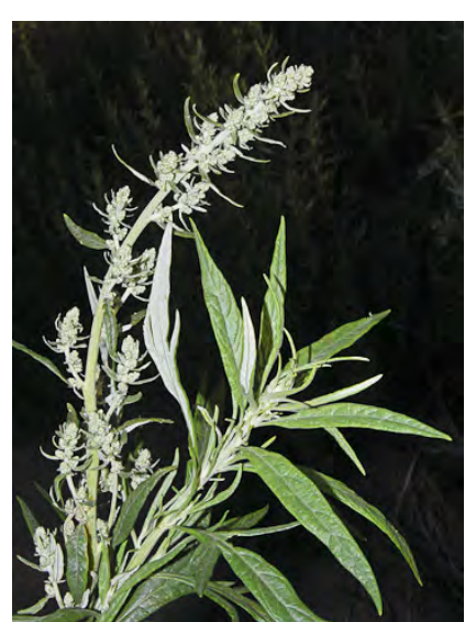
MUGWORT (Artemisia douglasiana) Native Perennial - Sunflower Family - (May–Nov) - Common. Open to shady areas, often in drainages - Plant 20-60" tall. Leaves gen 0.4-4" long, densely hairy below, some 3-5 lobed. Flower bracts hairy.