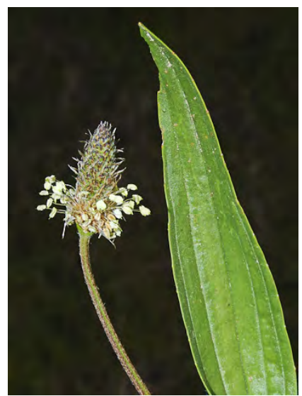
ENGLISH PLANTAIN (Plantago lanceolata) Naturalized Annual - Plantain Family - (Apr-Aug) - Common. Disturbed areas - Leaves basal, hairy, 2-10" long, <= 1" wide. Flowers + stem 8-31" tall, flower cluster 0.8-3" long. INVASIVE, lawn weed.