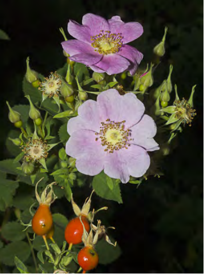
CALIFORNIA ROSE (Rosa californica) Native Perennial - Rose Family - (Feb-Nov) - Gen ± moist areas in sun, esp streambanks - Shrub 2.6-8.2' tall withick curved spines, forming thickets. Petals pink, 0.6-1" long; sepals unlobed.