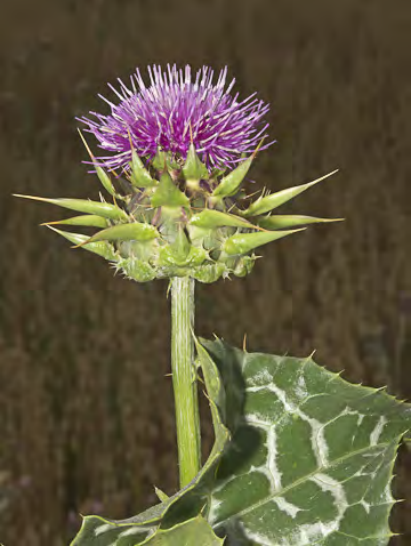
MILK THISTLE (Silybum marianum) Naturalized Annual-Biennial - Sunflower Family - (Feb–Jun) - Roadsides, pastures, disturbed areas - Stem 1-10', stout. Leaves spiny, shiny green wiwhite veins and spots. Flowers red-purple. INVASIVE weed.