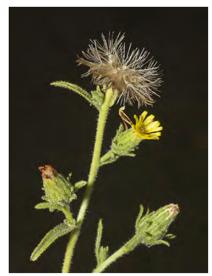
STINKWORT (Dittrichia graveolens) Naturalized Annual - Sunflower Family - (Sep-Nov) - Disturbed areas - Plant 8-24" tall, camphor-scented, glandular. Flowers yellow. Flower-head bracts Aster-like. Fall bloomer. INVASIVE weed.