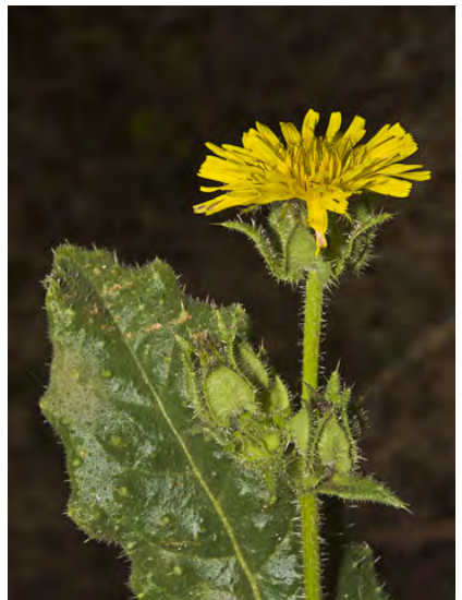
BRISTLY OX-TONGUE (Helminthotheca echioides) Naturalized Annual-Biennial - Sunflower Family - (All year) - Common. Disturbed areas - Stem 1-6.5' tall, bristly. Leaf 2-8" long, covered with prickly bumps. Flower heads 0.8-1.6" wide. INVASIVE weed.