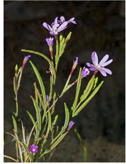
PANICLED / WEEDY WILLOWHERB (Epilobium brachycarpum) Native Annual - Evening Primrose Family - (Jun-Sep) - Common. Dry open or disturbed woodland, grassland, roadsides - Plant 8-79" tall, diffuse. Petals 2-15 mm long, white to rose-purple.