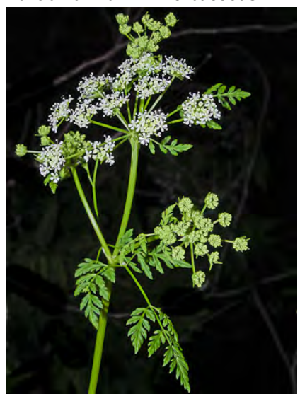
POISON HEMLOCK (Conium maculatum) Naturalized Biennial - Carrot Family - (Apr–Jul) -Common. Moist, esp disturbed places - Plants 2-10' tall. Stems purple-spotted. Leaves fern-like, gen 2x divided. Flowers white. TOXIC. INVASIVE weed.