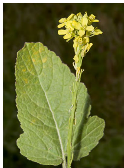
BLACK MUSTARD (Brassica nigra) Naturalized Annual - Mustard Family - (Apr–Sep) - Common. Disturbed areas, fields - Plant 1-6' tall. Petals bright yellow, 0.3-0.4" long. Fruit upright, pressed against stem. INVASIVE weed.