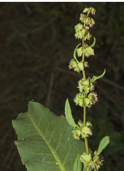
FIDDLE DOCK (Rumex pulcher) Naturalized Perennial - Buckwheat Family - (May–Sep) - Disturbed places, meadows, moist or dry habitats - Stem 8-24" long, branches widely spreading. Leaf blades 1.6-4" long, 1.2-2" wide. Valves w/2-5 teeth.