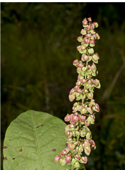
CURLY DOCK (Rumex crispus) Naturalized Perennial - Buckwheat Family - (All year) - Abundant. Disturbed places - Stem 16-39" tall. Flower cluster dense, valves 0.2-0.24", winged around tubercles, smooth edged. 1 tubercle enlarged. INVASIVE.