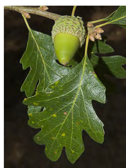
VALLEY OAK (Quercus lobata) Native Perennial - Oak Family - (Mar–Apr) - Slopes, valleys, savanna - Tree < 115' tall, deciduous. Leaves 2-5" long, not leathery, deeply lobed, lobes without bristles. Acorns 1.2-2" long, slender, cup 0.4-1.2" deep.