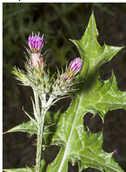
ITALIAN THISTLE (Carduus pycnocephalus subsp. pycnocephalus) Naturalized Annual - Sunflower Family - (Mar–Jul) - Roadsides, pastures, disturbed areas - Stems 8-79", narrow spiny-wings. Lower leaves 4-10 lobed, heads 2-5, flower bracts woolly. NOXIOUS.