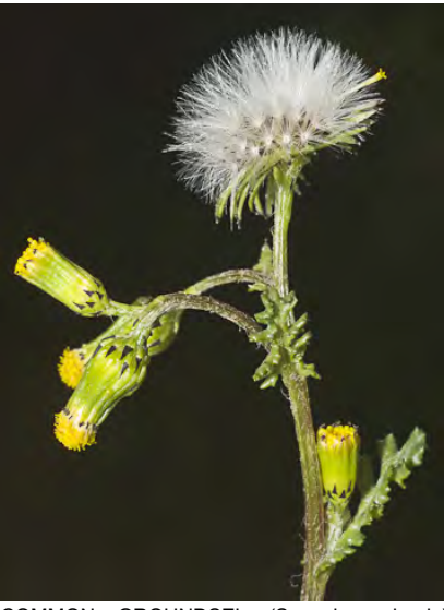
COMMON GROUNDSEL (Senecio vulgaris) Naturalized Annual - Sunflower Family -(Feb-Jul) - Common. Disturbed areas - Plant 4-24" tall, not hairy, w/1-10+ stems. Flower head bracts with black-tips. Milky sap.