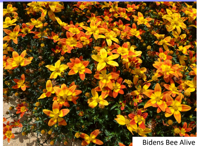
Bidens Bee Alive

Full Sun to Light Shade H 25cm W 60cm 175mm Pot