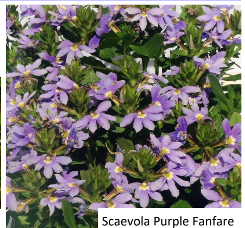
Scaevola Purple Fanfare