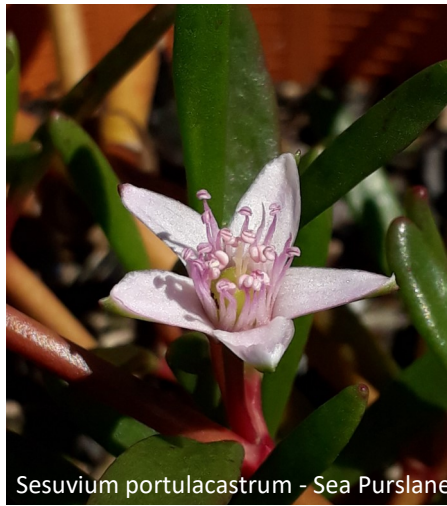
Sesuvium portulacastrum - Sea Purslane

Sea Purslane is a fast growing groundcover with succulent like foliage. The leaves of this Tucker Bush plant can be eaten raw or cooked. It is salt and drought tolerant that grows well in pots. 140mm Pots Click for more great Tucker Bush plants for attracting pollinators.