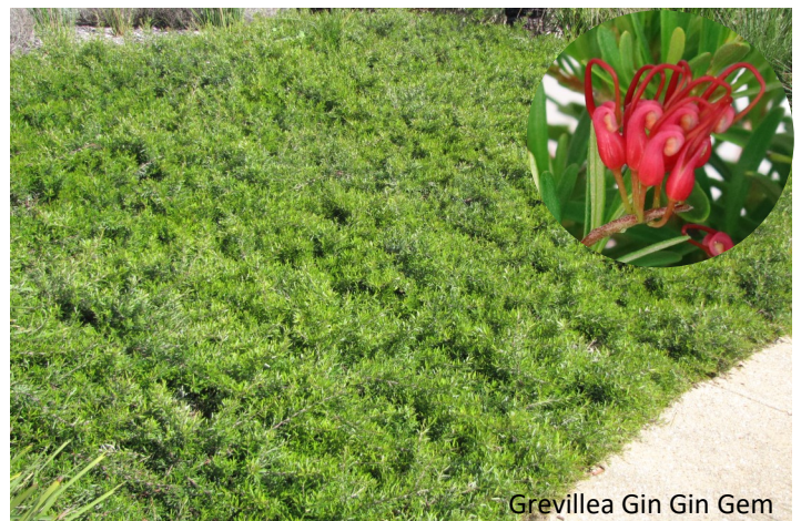
Grevillea Gin Gin Gem

Grevillea obtusifolia Gin Gin Gem is a dense, groundcover with a prolific display of red spider flowers in winter and spring. It is ideal for native gardens, landscapes and roundabouts. Once established it will only require the occasional water in the heart of Summer.