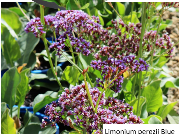
Limonium perezii Blue

Sea Purslane is a fast growing groundcover with succulent like foliage. The leaves of this Tucker Bush plant can be eaten raw or cooked. It is salt and drought tolerant that grows well in pots. 140mm Pots Click for more great Tucker Bush plants for attracting pollinators.