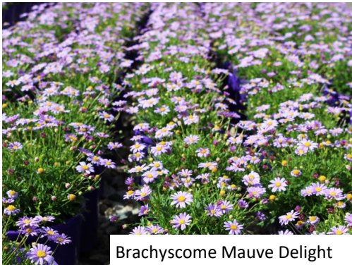
Brachyscome Mauve Delight

Brachyscomes are easy care, low growing plants that flowers for most of the year with mauve, daisy like flowers. Great for both landscapes and containers.