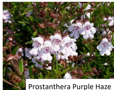
Prostanthera Purple Haze

Prostanthera's like the pictured P. Purple Haze are commonly pollinated by bees but also attract small birds. The aromatic 'Mint Bush' grows well in full sun to lightly shaded positions producing an abundance of flowers from throughout Spring. Once established they require only minimal water. 175mm Pot varieties available