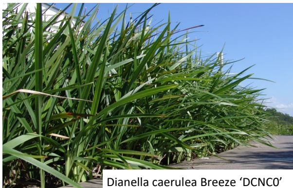
Dianella caerulea Breeze 'DCNC0'

Grasses also produce beautiful flowers that invite Australian native bees and specialist bees alike. Varieties like this Dianella Breeze are also very hardy once established.