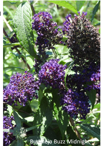
Buddleja Buzz Midnight