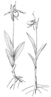
Illustration by Jeanne R. Janish, ©1969 University of Washington Press

Floral Characteristics: Flower 1 (rarely 2), terminal, subtended by an erect, leaflike bract. Sepals and petals greenish or yellowish, often marked with dark reddish brown or purplish spots, blotches, or streaks. Upper sepal broadest, 19-80 x 7-40 mm; the lateral pair of sepals completely fused or with only a notch at their tip. Petals somewhat narrower and longer than the sepals, 24-97 x 3-12 mm, often wavy-margined and spirally twisted. Lip strongly pouched, 15-54 mm long, pale to deep yellow (rarely white), sometimes with reddish or purplish spots around the orifice. Flowers May to June.