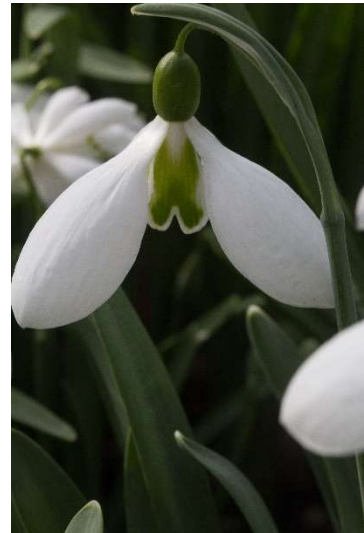
G. 'Fieldgate Superb'