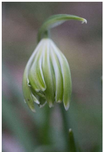
G. 'Boyd's Double'