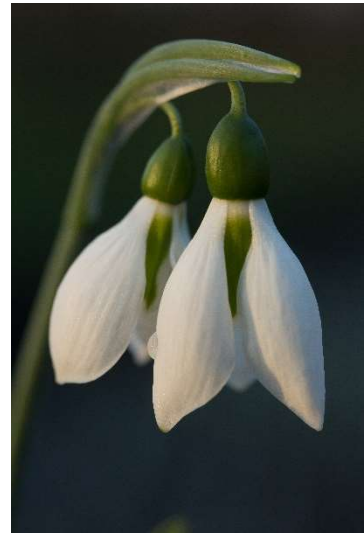
G. 'Harewood Twin'