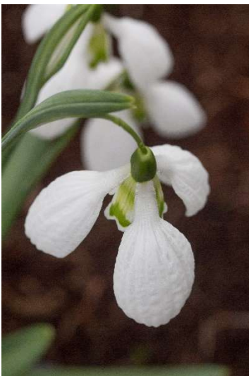
G. 'Chantry Taffeta'