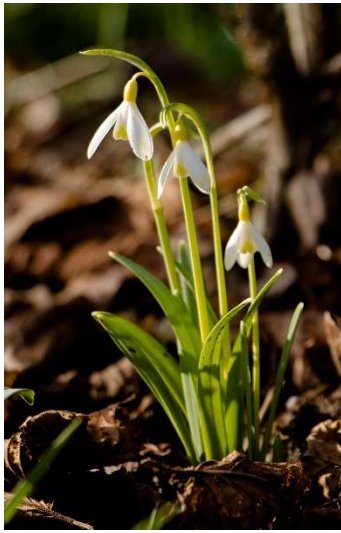
G. 'Ecusson d' Or'