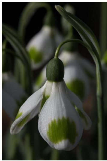
G. 'Pieces of Eight'