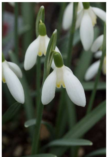
G. 'Das Gelb Vom Ei'