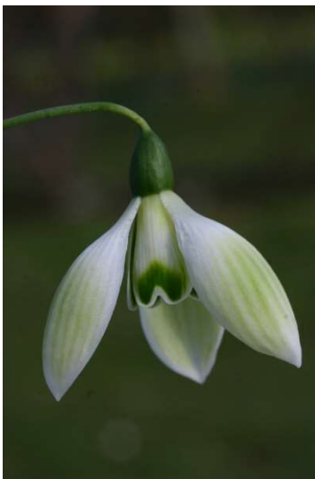
G. 'Cowhouse Green'