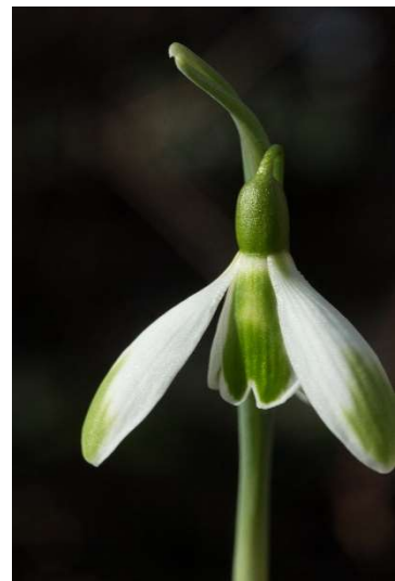
G. 'Joe Spotted'