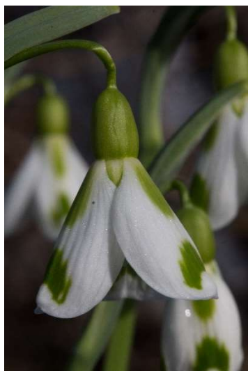
G. 'Veronica Cross'