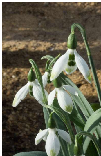
G. 'Streets Ahead'