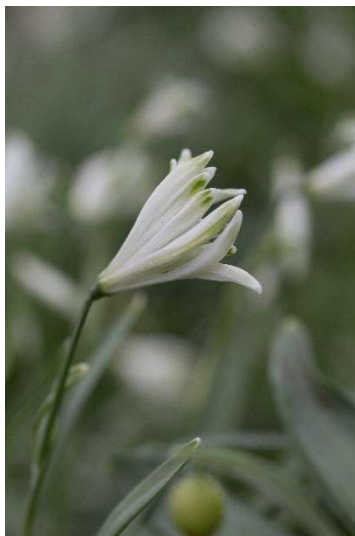
G. 'Irish Green'