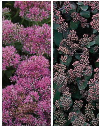
Sedum 'Powderpuff' Sedum 'Spellbound'