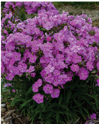
Phlox 'Baby Doll Pink'

Bicolor flowers have violet blue hoods and lighter insides. Individual flowers are larger than typical S. nemorosa and cover a low, wide habit.