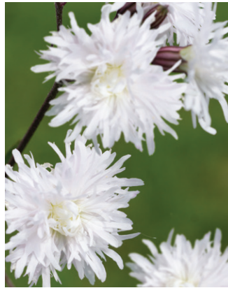
Lychnis Petit Henri

The habit of this butterfly bush has panicles that cascade downward like a waterfall. Features 12 to 18-in. (30 to 46-cm), huge, puffy panicles of pale lilac flowers.