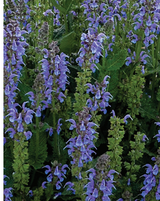
Salvia 'Tidal Pool'

Series is well-suited to the middle of the flower border. Fills out a container nicely, but won't overrun the garden. 'Berry Taffy' features raspberry-pink flowers with bronze-colored bracts. Newest foliage is notably dark.