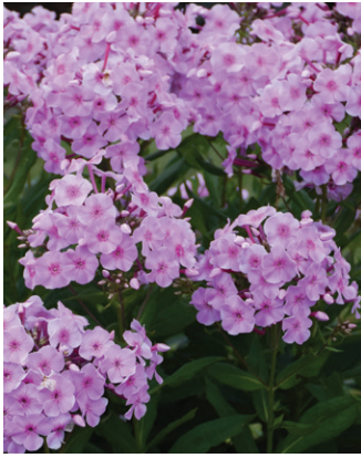
Phlox Garden Girls 'Uptown Girl'