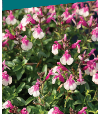
Salvia Mirage Rose Bicolor