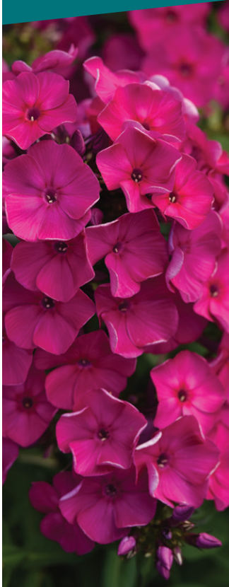
Phlox Super Ka-Pow Fuchsia