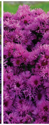
Aster 'Pink Crush'