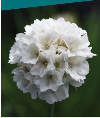
Armeria Dreameria 'Dream Clouds'