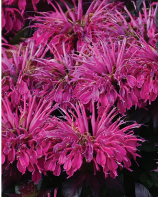
Monarda Sugar Buzz 'Berry Taffy'

Double-flowered dwarf variety forms compact, bushy clumps with masses of bright white blooms.