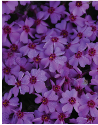
Phlox 'Eye Caramba'

Rose-pink, tall garden Phlox with powdery mildew resistance, heat tolerance and impressive reblooming.