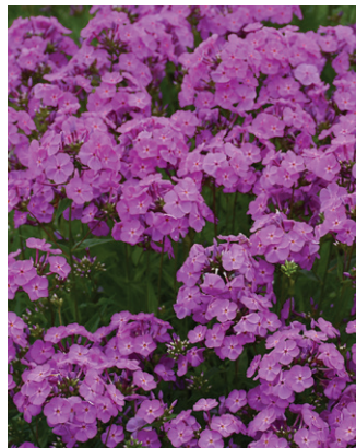
Phlox 'Magenta Pearl'

Bright pink flowers with a white halo form a mass of blooms on top of the dark green foliage.