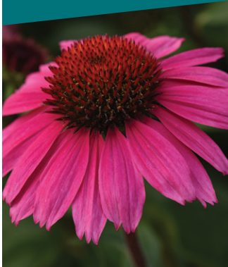
Echinacea Sombrero Rosada