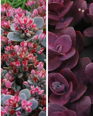
Sedum SunSparkler 'Blue Elf' Sedum SunSparkler 'Cherry Tart'

' Spellbound ' Height: 18 to 20 in. (46 to 51 cm) Soft pink buds open to cream flowers that bubble over a domed habit of gray-green leaves.