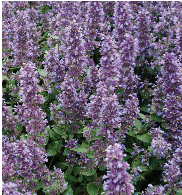
Nepeta Whispurr Blue