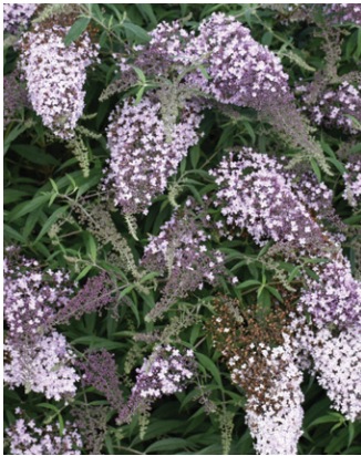
Buddleia 'Lilac Cascade'

Both 'Grape Crush' and 'Pink Crush' produce large, very round mounds of densely packed flowers, bringing a refined look to Fall-blooming Asters.