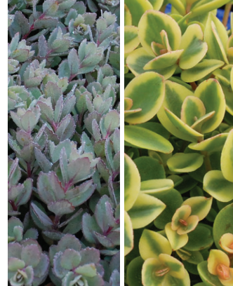
Sedum SunSparkler 'Dazzleberry' Sedum SunSparkler 'Lime Twister'