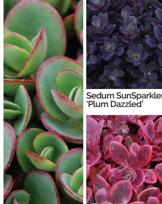
Sedum SunSparkler 'Lime Zinger' Sedum SunSparkler 'Wildfire'