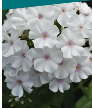
Phlox Ka-Pow White