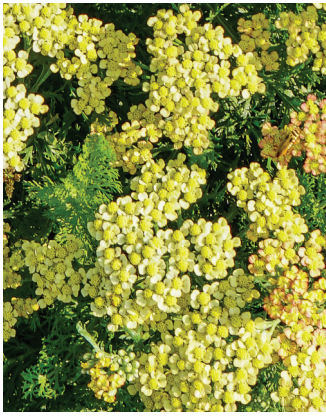
Achillea Milly Rock Yellow