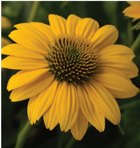
Echinacea Sombrero Poco Yellow

Poco is compact for better forcing and greenhouse growing performance.