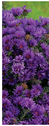
Aster 'Grape Crush'

MILLY ROCK is a U.S. trademark of Florensis, B.V.