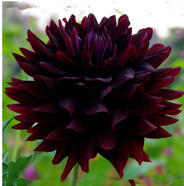
Hollyhill Black Beauty

The ray florets (petals) are twisted, curled, or wavy and of uniform size in an irregular arrangement. They may be partially involute (curved toward the face) or revolute (curved back).