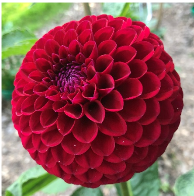
Jackie's Red Devil

Blooms are ball-shaped with uniform ray florets (petals), involute (rolled forward). The petals will reflex toward the stem, completely filling the floral head, and are rounded or blunt without notches/points. Ball size is over 3.5 inches in diameter. Miniature Ball is 2 to 3.5 inches in diameter. Pompon is up to 2 inches in diameter.