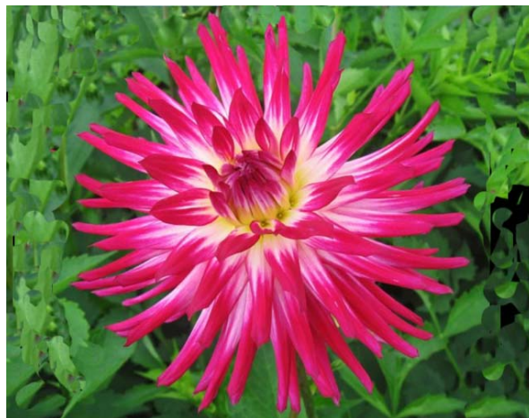
Carol's Spanish Dancer

Ray florets (petals) are narrow at the base, straight, uniform in length, and reflex toward the stem radiating uniformly from the center. They are revolute (curved to the underside) for most of their length and fully revolute for at least half of their length.