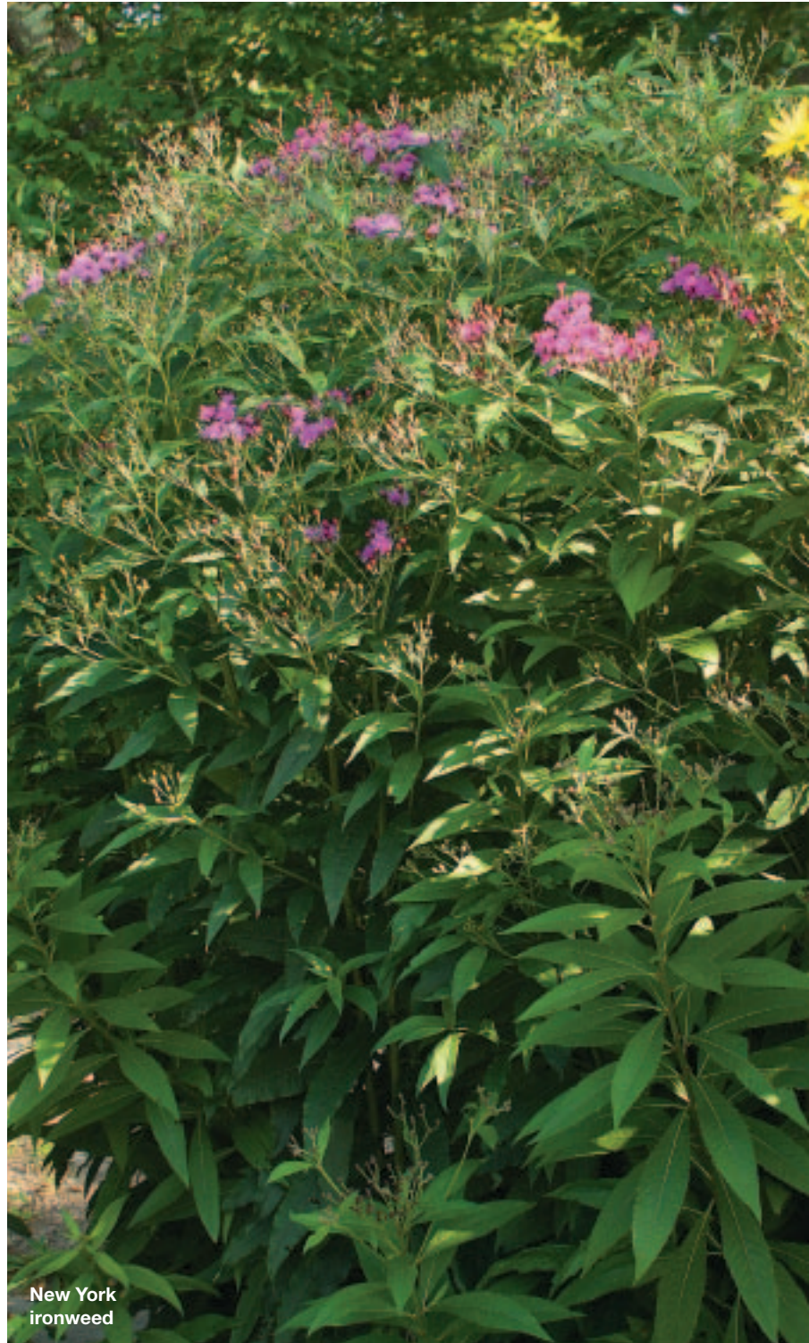
New York ironweed

From a distance, western ironweed ( V. baldwinii ) looks a little like Joe-Pye weed ( Eutrochium spp. and cvs, Zones 4 to 9), but its attractive, lance-shaped leaves—rough on the surface and softly hairy on the underside—are not whorled like its cousin's. The same white hairs clothe the arrow-straight stems, which branch in midsummer to hold purple flowers in loose, flattened clusters. The scales of the floral bracts recurve at the tips, giving the rosette a barbed appearance, but it's not at all prickly. Given the smaller flower heads—less than an inch wide—the floral display is not as vivid as Arkansas ironweed, but it's as bountiful as any ironweed. The upright habit is handsome and narrow—well, at 50 inches wide, what passes for narrow for an ironweed. Contrary to warnings, western ironweed did not spread or create a colony during seven years in the trial.