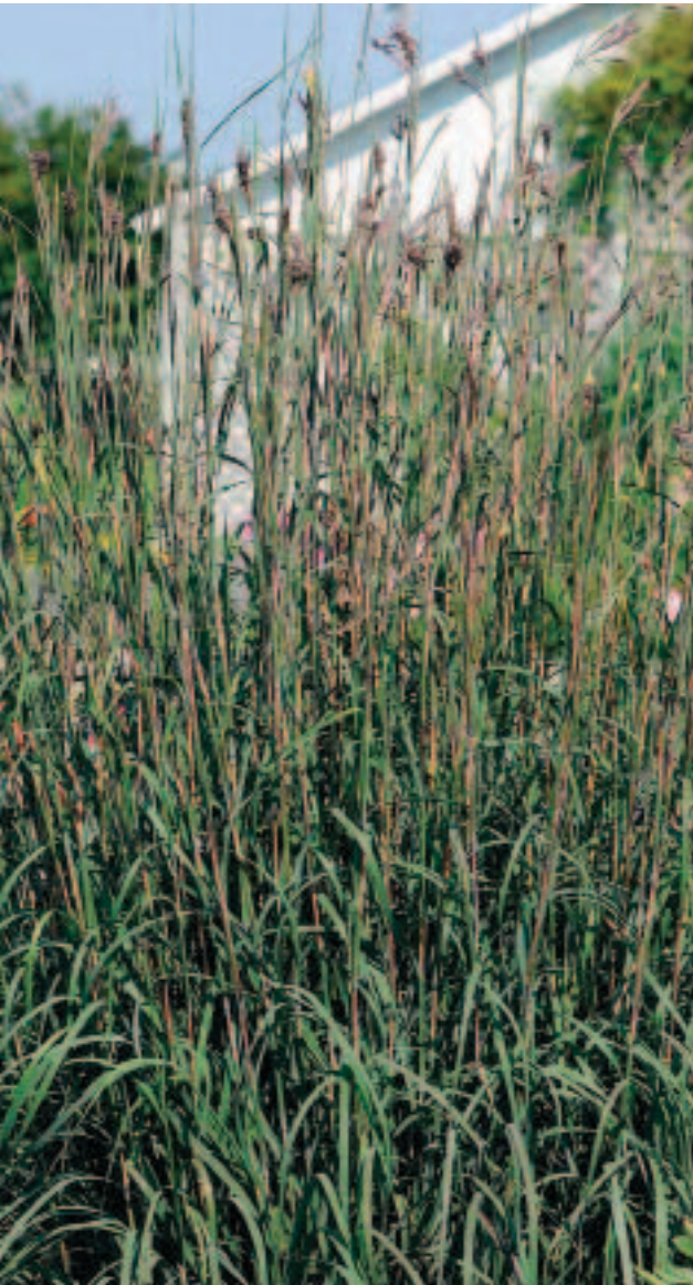
'Indian Warrior' big bluestem