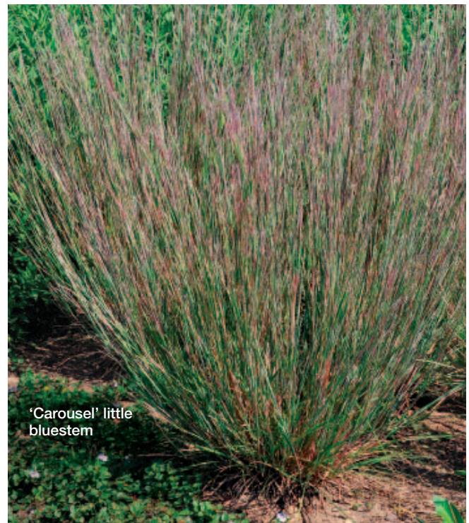
'Carousel' little bluestem