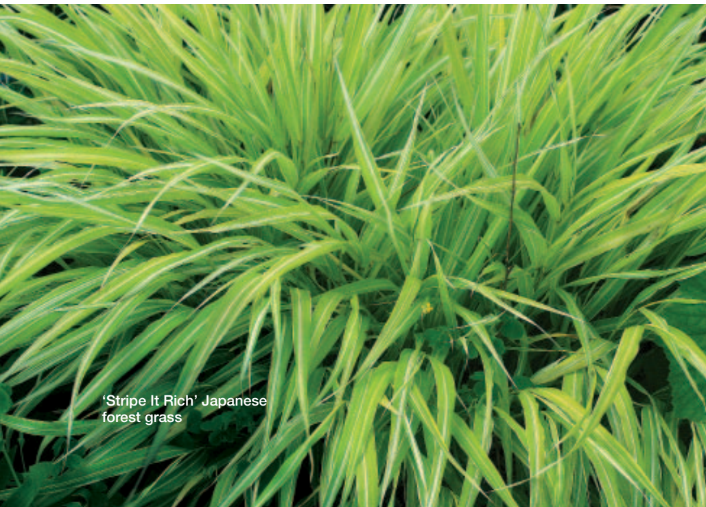
'Stripe It Rich' Japanese forest grass

If you think they're all the same, this trial proves that some are champions and some are not