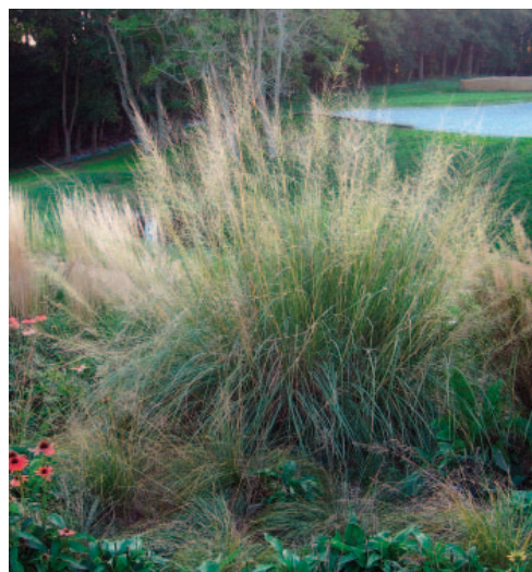
'Windbreaker' big sacaton