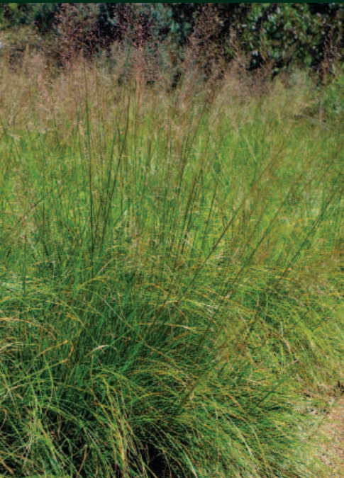
WARM-SEASON GRASS Prairie dropseed

Grasses are pretty easy to grow: Their drought tolerance, adaptability to a variety of soils, low maintenance needs, and limited problems with pests and diseases are testaments to their tough character. Full sun is best for most grasses—although, as with every rule, there are exceptions.