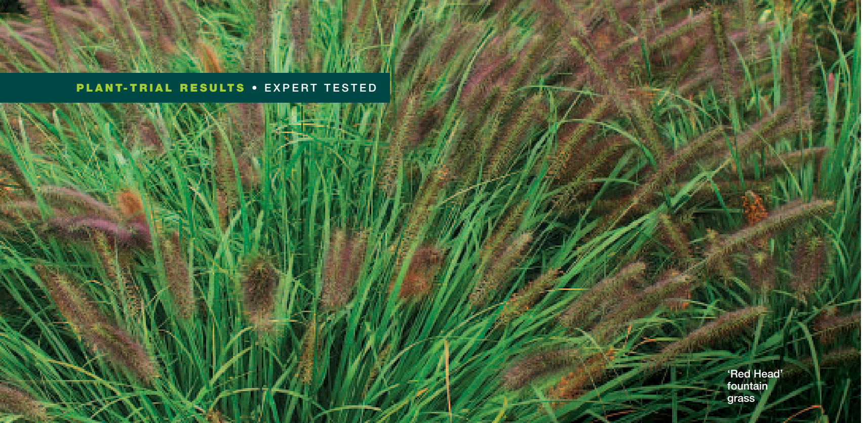
'Red Head' fountain grass