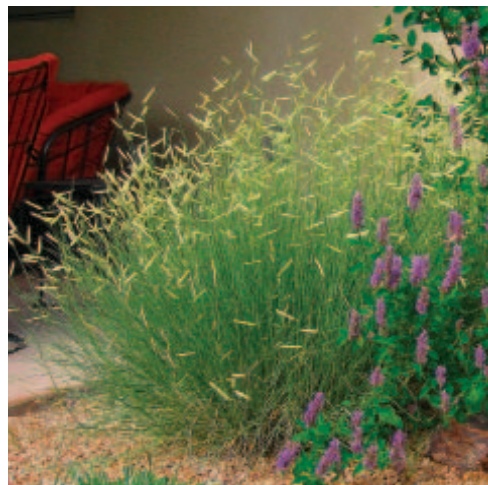
'Blonde Ambition' blue grama