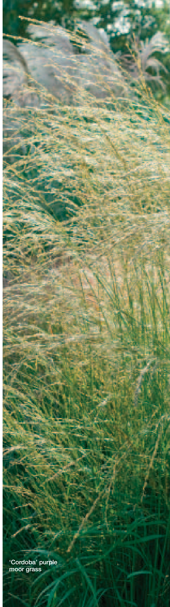
'Cordoba' purple moor grass

'Red Head' fountain grass ( Pennisetum alopecuroides 'Red Head') is another exceptional grass with midwestern roots, but it is not a native. Its lovely arching habit, more fountainlike than other cultivars in the trial, is topped with an eye-popping bouquet of red-purple flowers from midsummer into fall. Its bristly inflorescences—at an implausible size of 9 inches long and 3 inches wide, and looking a bit like giant woolly bear caterpillars—hold their color well into midfall before finally fading and shattering. Golden yellow fall color adorns the long