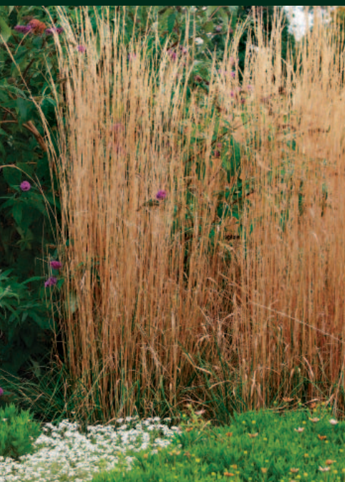
COOL-SEASON GRASS Feather reed grass