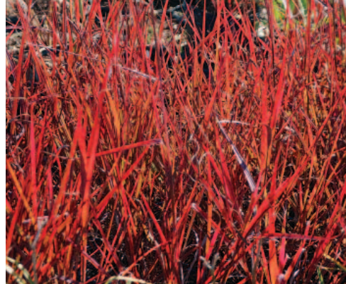
'Red October' big bluestem

'Windbreaker' big sacaton ( Sporobolus wrightii 'Windbreaker', Zones 5–9) is a recent introduction from New Mexico. With humble beginnings as a utilitarian plan (it was developed as a wind barrier for commercial vegetable fields in the West), 'Windbreaker' has a bright future in gardens. It's a big plant, though, with stems rising 8 to 10 feet tall and 6 feet wide over time. In the first year of the trial, it was 68 inches tall and 58 inches wide, so it's well on its way to its full size. Touted as a native substitute for gigantic pampas grass ( Cortaderia selloana * and cvs., Zones 7–11), 'Windbreaker' provides all that drama—and more. Gray-green leaves form a generous mound with large pyramidal green flower clusters soaring high overhead in summer. Big sacaton is not short on positive cultural attributes, either: It's drought tolerant and adaptable to high-alkaline, saline, and poorly drained soils. Big sacaton is an important conservation and forage plant in the Southwest and a little-known relative of prairie dropseed ( Sporobolus heterolepis , Zones 4–9).