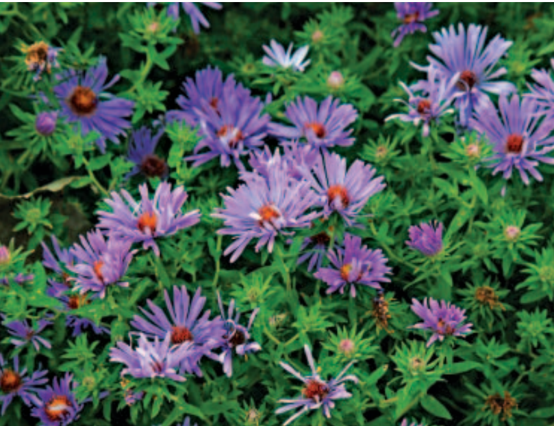
'Doktor Otto Petschek' Italian aster