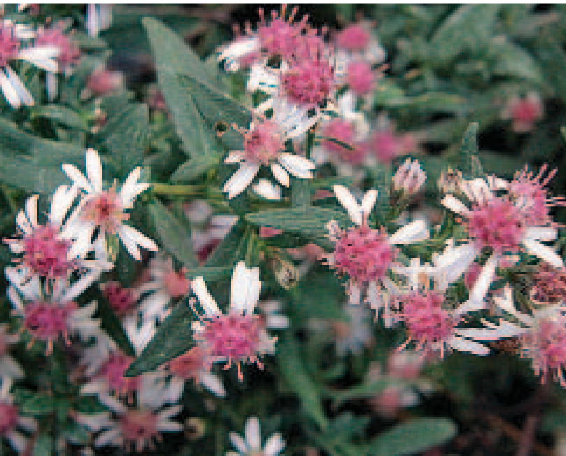
'Lady in Black' calico aster