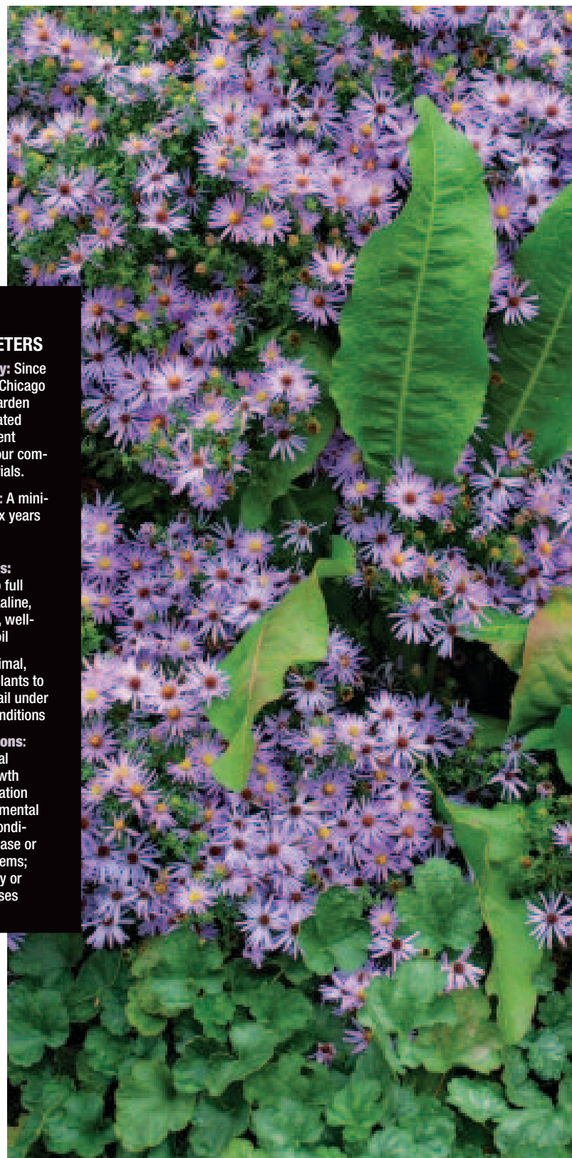
'Raydon's Favorite' aromatic aster