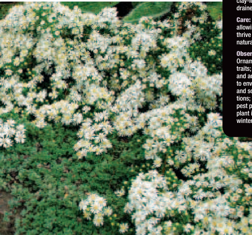
'Snow Flurry' white heath aster