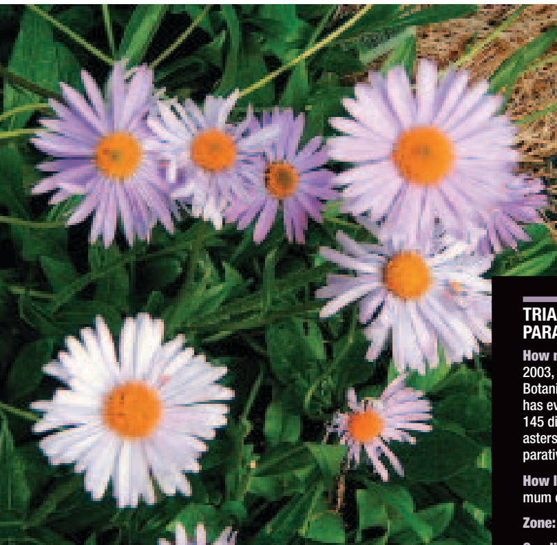
'Wartburgstern' East Indies aster