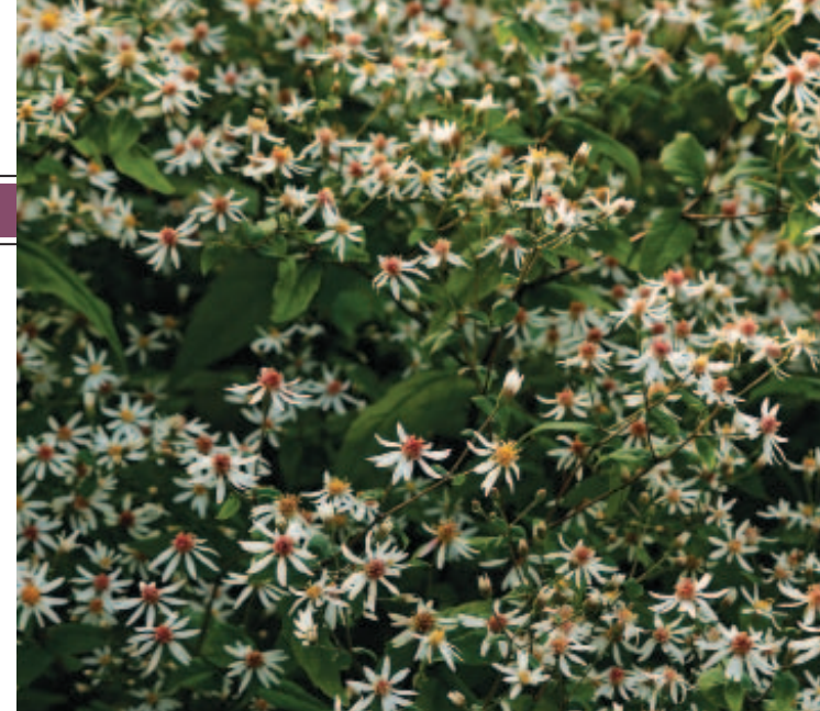
'Eastern Star' white wood aster

Observations: Ornamental traits; growth and adaptation to environmental and soil conditions; disease or pest problems; plant injury or winter losses