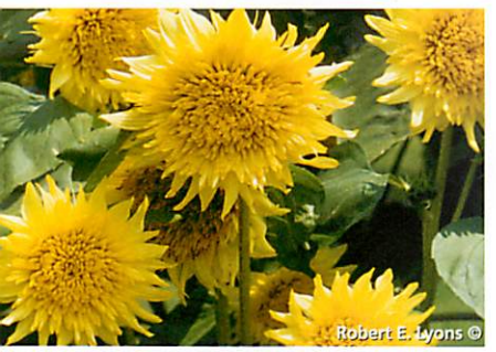
'Lemon Aura' Sunflower