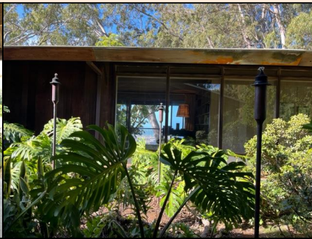
Liljestrand House Tour Excursion