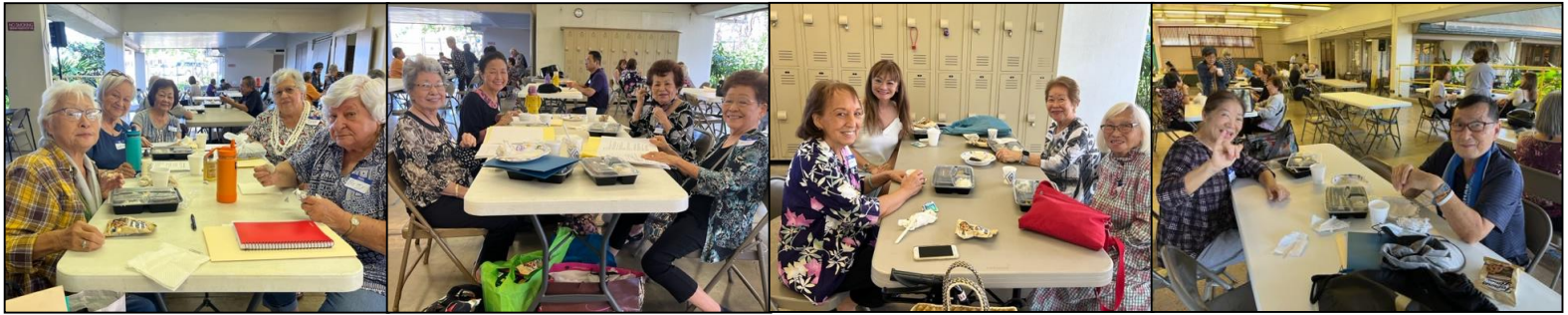
Class Instructors, Facilitators, Club officers gather for Leadership Training 2023