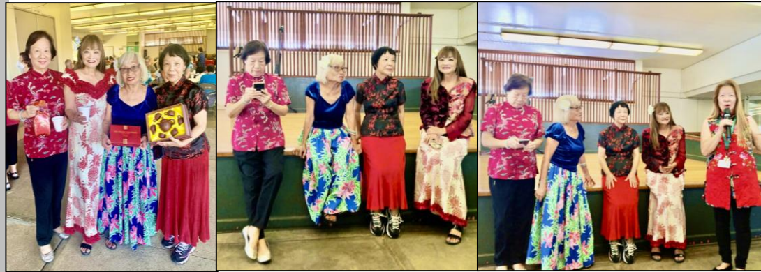
CCC Members who sang and served Tea at the Center's Lunar New Year Dim Sum Celebration.