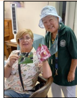
at the Old Calendars made into Envelopes workshop