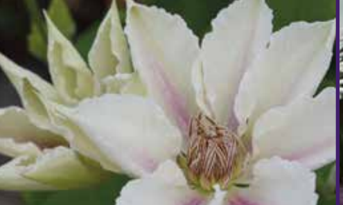
CORINNE<sup>TM</sup> Boulevard® Evipo063® This beautiful clematis has white flowers with ruffly edges and a pink/violet stripe on each petal. This compact, heavy bloomer is great for patio containers as well as the garden. It can be grown in full sun to partial shade making it a great addition. It grows to a height of 6' and blooms June through August ↓