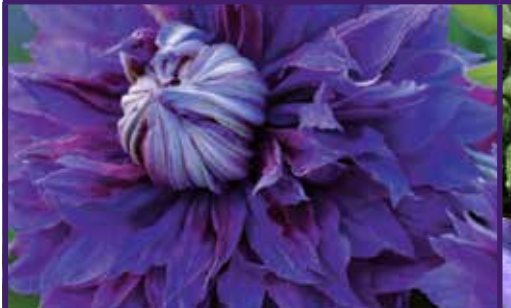
DIAMANTINA<sup>TM</sup> Regal* Evipo039* An exceptional, free-flowering clematis with 4-6" pom-pom like blue/purple double flowers. Diamantina has many flowers on each stem and each flower lasts up to 4 weeks. Repeat flowering throughout summer. This double clematis far outperforms any other double clematis currently available! •