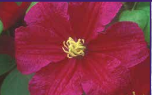
BARBARA HARRINGTON An exceptional late, free flowering plant. Raised from clematis Comtesse de Bouchaud and retaining its parent's ability to flower well over a long period. The cerise colored flowers, approximately 4" in size, have pointed petals with a dark border and contrasting yellow anthers. Blooms late June through September. •