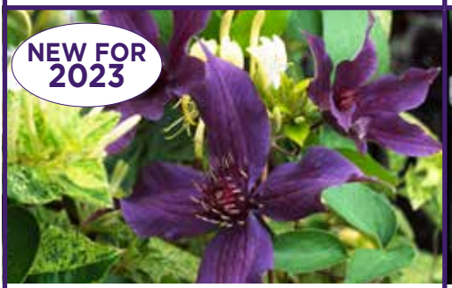
GUIDING PROMISE™ Evipo053 (N) This is a short-growing clematis ideal for growing in a mixed border with other plants or in a container. It grows to about 3-4ft in height. It is multi-flowering producing mauve-purple flowers with twisted petals and purple anthers. Blooms May – July and again in Autumn. •