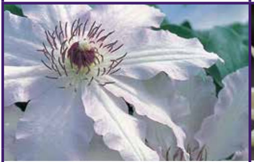
CLAIR DE LUNE™ Gardini® Evirin® An Evison/Poulsen cultivar is a compact free-flowering plant. The flowers retain their color best in a shady area. The flowers are 6-7" and have a base color of white which is suffused with pale lilac becoming darker at the edge of the eight wavy petals and stunning dark anthers. Blooms late June, July and late August. ♀