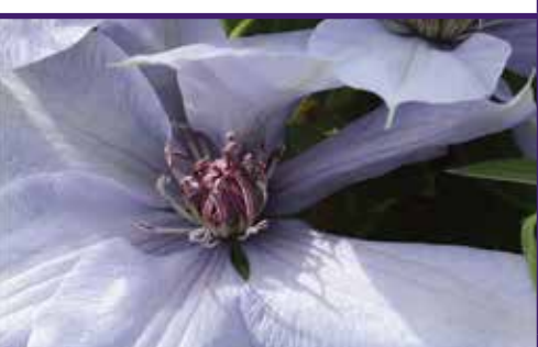
BERNADINE™ Boulevard® Evipo061® This stunner produces masses of large light blue flowers with contrasting red anthers. It's amazing how many flowers it puts out in one blooming! Can be grown in full sun or partial shade. Grows to a height of 6' and blooms June through September. Output Description: