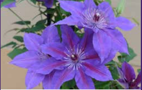
EDDA Boulevard* Evipo074* Good plant for growing in pots or containers due to its compact free flowering habit. Each flower has 6-10 petals. The central petals are shorter and paler in color, the outer petals being purple with a darker reddish purple central bar. All have pointed tips. The plant is repeat flowering from late Spring until early Autumn. Grows to a height of 3-4'. ♥