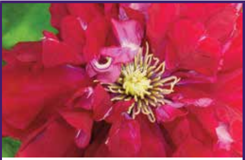
CHARMAINE™ Regal® Evipo022® This clematis produces rich red double, semi double and single flowers from later spring to midsummer and again in autumn. Growing to a height of 6-7 feet, this is a great addition to the double varieties. □