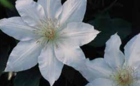
HYDE HALL<sup>TM</sup> Gardini® Evipo009® This compact clematis is ideal for containers. Its 5-7" flowers are off-white with sometimes green or pink tinges. It blooms on the previous season's stems from May to June. Anthers are light chocolate brown. •