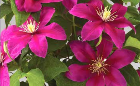
ACROPOLIS<sup>TM</sup> Boulevard Evipo078* A compact very free flowering clematis. It produces an abundance of bright pink flowers that are 3-4 inches. Blooms early summer through late autumn. Acropolis is very showy and grows to 4'.