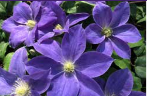
DIANA'S DELIGHT™ Boulevard® Evipo026® Diana's Delight has beautiful, rich blue colored flowers with light and dark tones and a creamy yellow center. This lovely clematis has a very free flowering habit. It grows to a height of 6' and blooms June through early September. Stunning! •