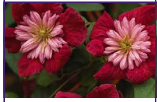
AVANT-GARDETM Festoon® Evipo033® As the name suggests, a very unusual 3" red flower with pink petaloid stamens giving the impression of a double flower and protruding trumpet. Very free flowering. Blooms July through September. Part of the "Evison/Poulsen Festoon Collection." •