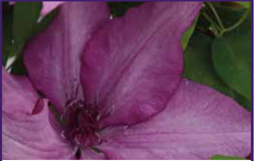
GISELLETM Garland® Evipo051® This beauty has unusual star-shaped purple-pink flowers and contrasting red-purple anthers. It looks tremendous grown with purple foliaged shrubs. Can be grown in partial shade or full sun. Grows to 4-5° and blooms May through September.