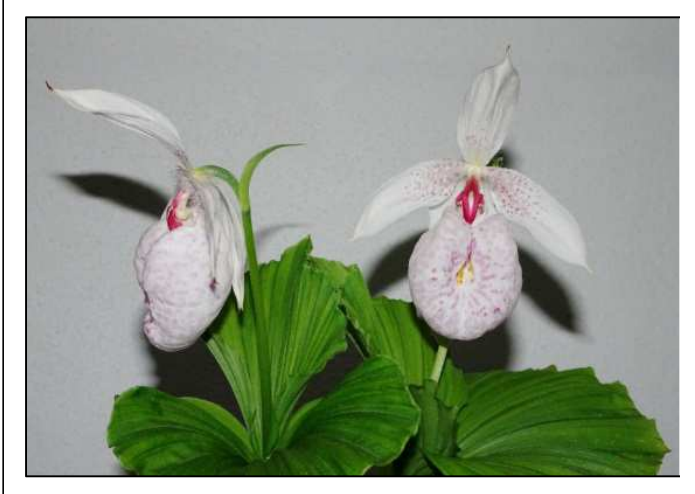
Orchid of the Night and Judges' Choice—Species October Cypripedium formosanum grown by Mike Pieloor.