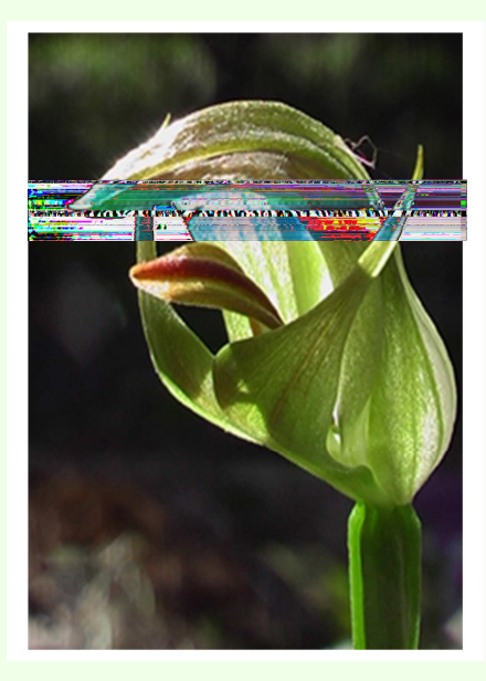
Plants grown, and photos, by Peter Coyne