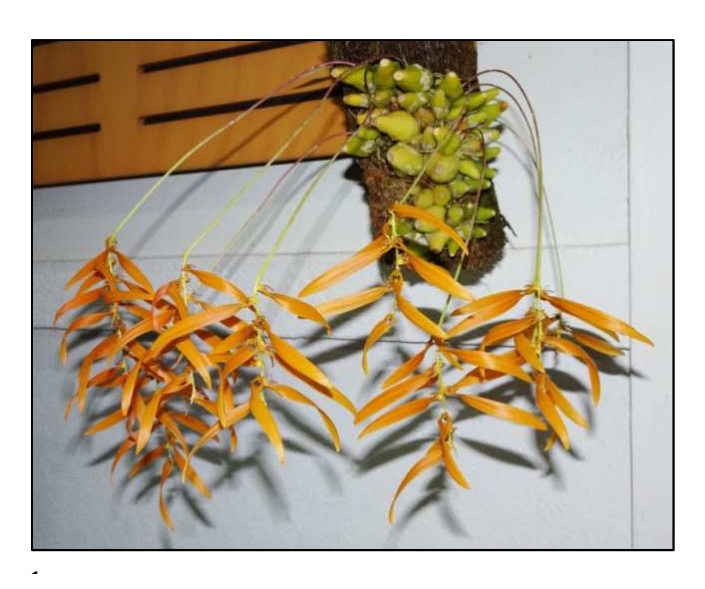
Judges' Choice - Species September Bulbophyllum wallichii grown by Karen Groeneveld.

Orchid Species Plus 405 Main St, Kingston Vic 3364 ph: 03 5345 6387 web: www.orchidspeciesplus.com.au