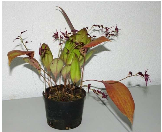
Judges' Choice - Specimen July Pleurothallis sp. 11 grown by Karen Groeneveld