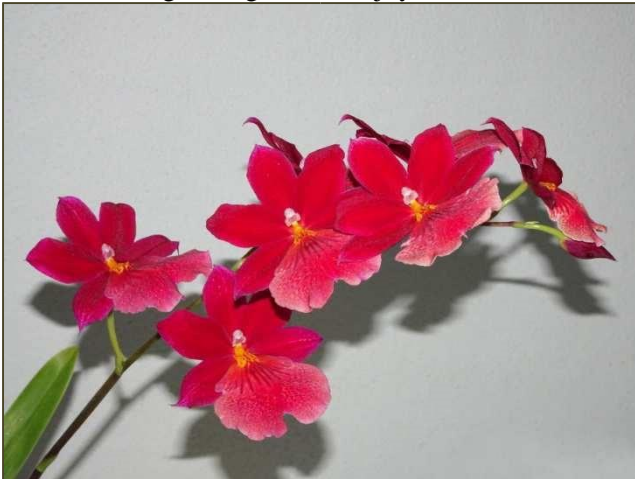
Judges' Choice - Hybrid July Oncidiopsis Nelly Isler grown by Karen Groeneveld

It is a wonderful time of year, with buds bursting and orchids starting their growth. Enjoy!