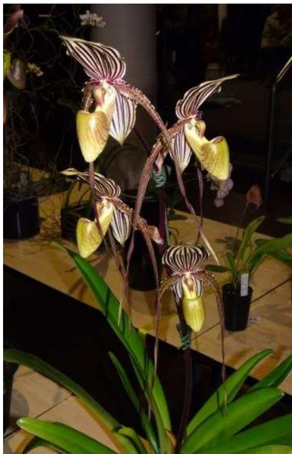
Judges' Choice - Hybrid August Paphiopedilum St Swithin grown by David Judge

The initial set-up of flooring (crushed rock), igloos, benching was done on a tight budget. To make a living, Wayne and Lisa needed to bring in $25,000 a year – impossible with an initial investment of $50,000 in stock plants, so Wayne had to mow lawns and do odd jobs to keep the money coming in until the nursery reached economies of scale.