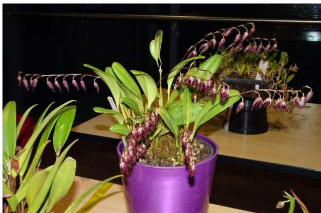
Judges' Choice - Specimen August Pleurothallis restrepioides grown by Karen Groeneveld

(Presentation adjourned for coffee, sales table and popular vote.)