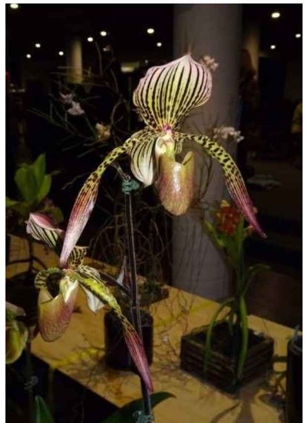
Orchid of the night August Paphiopedilum Houghtoniae 'Anisha' grown by David Judge.

© 2018 The Orchid Society of Canberra. The Orchid Society of Canberra disclaims liability for any loss, financial or otherwise caused as a result of the contents of this Bulletin.