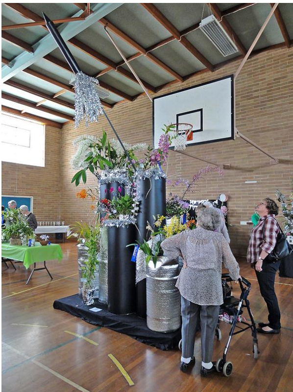
The Canberra Orchid Society's Display