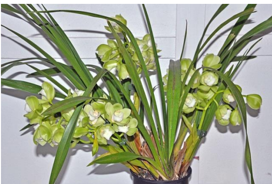
October Orchid of the Night: Cymbidium Baltic Glacier 'Mint Ice', grown by Ros Walcott

Christmas Party – games, prizes, food, and fun. Please bring your flowering plants for the plant display as usual. Also, please bring a plate of food to share. The Society will supply soft drink/juice/tea/coffee and plates/cutlery/serviettes.