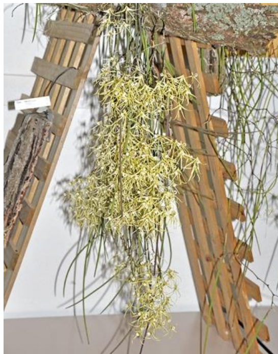
September Judges' Choice Specimen & Orchid of the Night: Dockrillia teretifolia , grown by Craig Allen