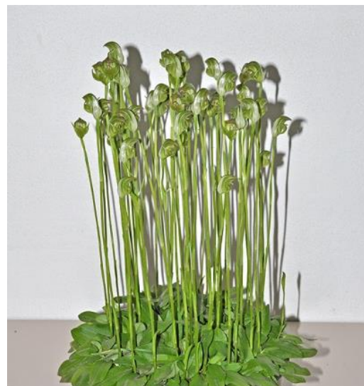
September Judges' Choice Species: Pterostylis curta , grown by Nita Wheeler

Gary's tips for photographing miniature orchids were to use diffuse light (such as in a greenhouse), a ring flash, and a plain background. Use a high F-stop and long exposure to maximise depth of field.