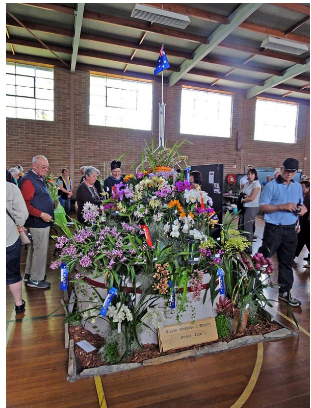
The Champion Display by Albury-Wodonga and District Orchid Club