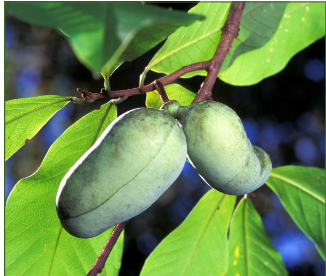
The pawpaw tree, Asimina triloba, yields 3- to 5-inch-long fruit, the largest fruit native to the United States.