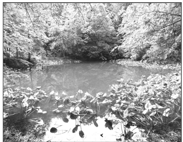
The pond at Hughes Tree Farm will be used for family fishing events. It is accessible from a short trail and is connected to other trails by a wooden bridge.