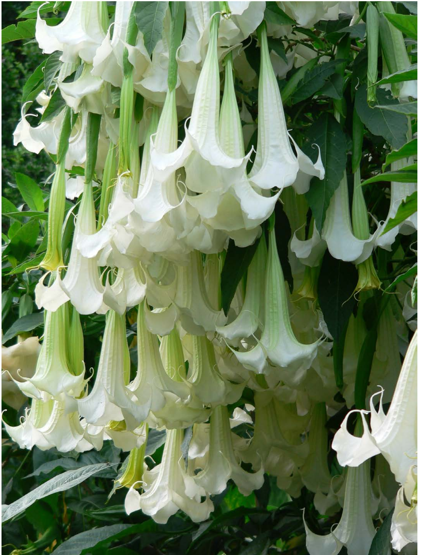
Brugmansia 'Avalanche'