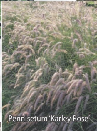
Pennisetum 'Karley Rose'