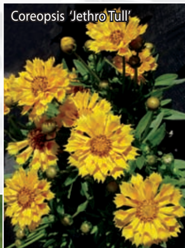
Coreopsis 'Jethro Tull'