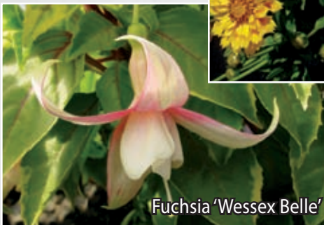
Fuchsia 'Wessex Belle'