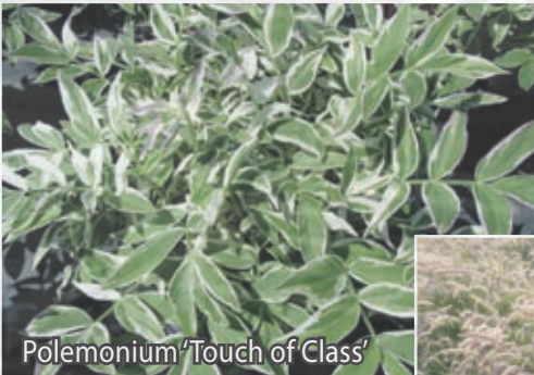
Polemonium 'Touch of Class'