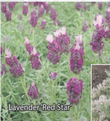
Lavender 'Red Star'