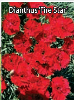
Dianthus 'Fire Star'