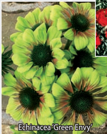
Echinacea 'Green Envy'

* Pre-booking incentive applies only to orders booked in advance, not from our current availability lists.