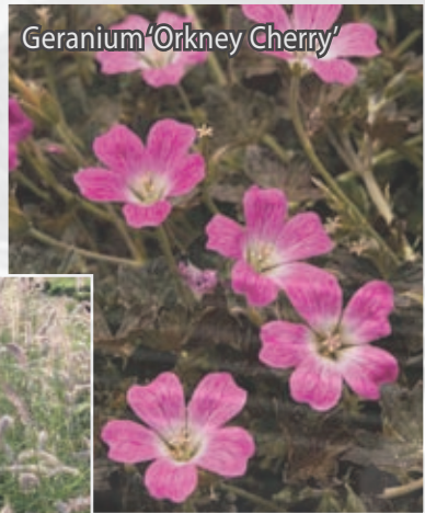
Geranium 'Orkney Cherry'