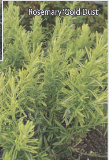
Rosemary 'Gold Dust'