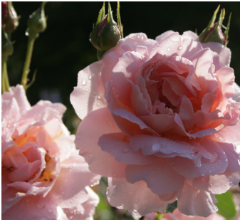
BELLE STORY English rose David Austin Zones, 5-10