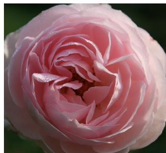
HERITAGE English rose David Austin Zones 5-9