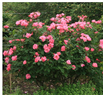
PINK KNOCK OUT shrub rose Zones 5-11