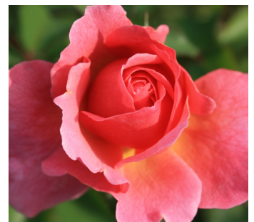
LILIAN AUSTIN English rose David Austin Zones 6-10