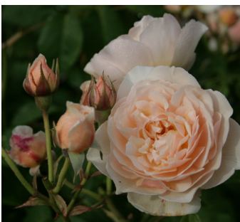
SWEET JULIET English rose David Austin Zones 5-10