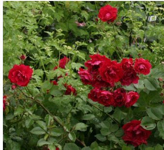
Rosa 'Champlain' shrub rose Canadian Explorer Series Zones 3-8