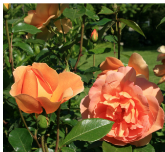
PAT AUSTIN English rose David Austin Zones 5-10