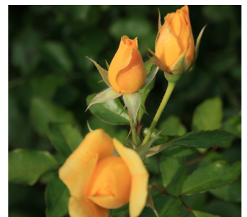
MORNING HAS BROKEN shrub rose Heirloom Roses Zones 5-9