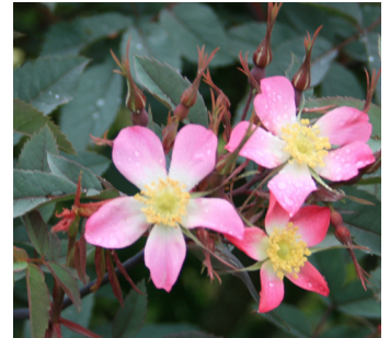
Rosa glauca shrub rose Zones 2-8 blooms once showy pointed fruit (hips)