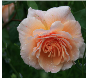
AMBRIDGE ROSE English rose David Austin Zones 5-10