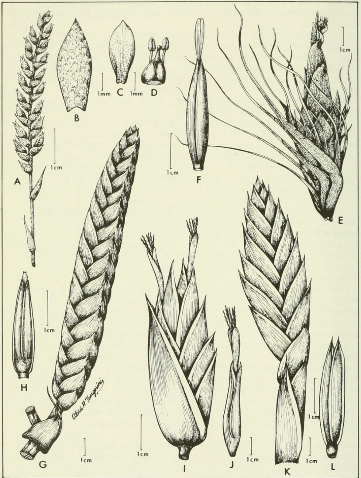
Fig. A-D: Tillandsia schunkei . E, F: T. velickiana .