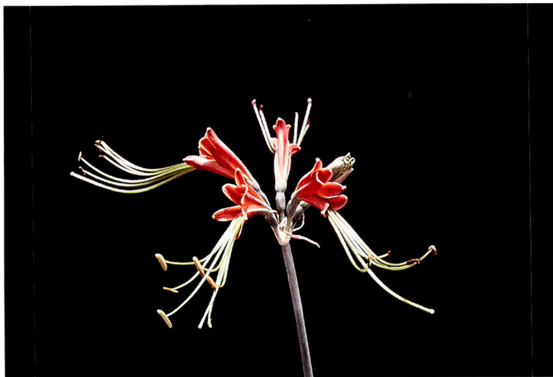
FIG. 2. Eucrosia calendulina .