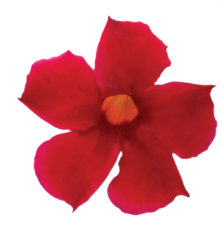
Pretty Crimson Sunmanderemi

GenusMandevillaFamilyApocynaceaePlant typeTropical vineHardinessZone 10a