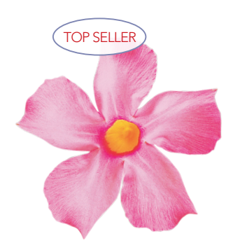
Pretty Pink Sunparaprero