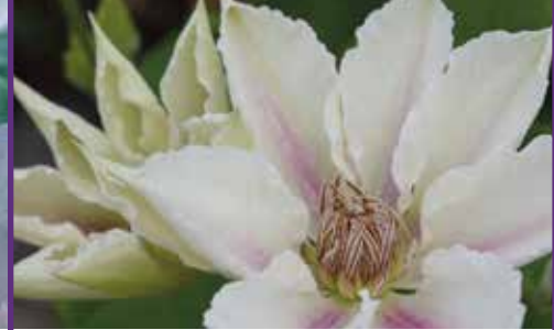
CORINNE<sup>TM</sup> Boulevard* Evipo063* This beautiful clematis has white flowers with ruffly edges and a pink/violet stripe on each petal. This compact, heavy bloomer is great for patio containers as well as the garden. It can be grown in full sun to partial shade making it a great addition. It grows to a height of 6' and blooms June through August Q

CLAIR DE LUNE<sup>™</sup> Gardini<sup>®</sup> Evirin<sup>®</sup> An Evison/Poulsen cultivar is a compact free-flowering plant. The flowers retain their color best in a shady area. The flowers are 6-7" and have a base color of white which is suffused with pale lilac becoming darker at the edge of the eight wavy petals and stunning dark anthers. Blooms late June, July and late August. ♀