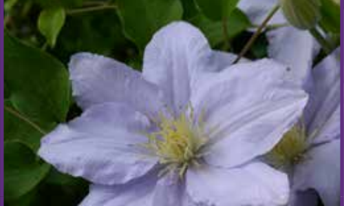
CHELSEA<sup>TM</sup> Boulevard* Evipo100* Beautiful flowers are slivery blue with a yellow center and yellow anthers. Compact, free flowering over a long period, with flowers that are approximately 4" in size. This amazing compact plant is ideal for small gardens and containers as it grows to a height of 3'. Can be grown in partial shade. Blooms May through August.

BIJOU<sup>TM</sup> Tudor<sup>®</sup> Evipo030<sup>®</sup> An Evison/Poulsen cultivar raised in Guernsey by Raymond Evison in 2005. Small pointed ruffled petals in pale violet/ mauve with slight pinkish bar. Pink tipped anthers open to a lovely rosette shape. Very free flowering and flowers keep shape well. Blooms May through July. Nice low mounding clematis (2 feet). ♀