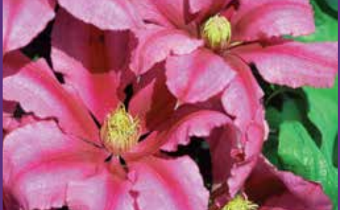
LIBERATION<sup>TM</sup> Evifive® Liberation is a large 5-6" deep pink flower with a broad cerise central bar with contrasting yellow anthers. Blooms May through June and August through September. Free flowering and strong growing. 🖗

GISELLE<sup>TM</sup> Garland<sup>®</sup> Evipo051<sup>®</sup> This beauty has unusual star-shaped purple-pink flowers and contrasting redpurple anthers. It looks tremendous grown with purple foliaged shrubs. Can be grown in partial shade or full sun. Grows to 4-5' and blooms May through September.