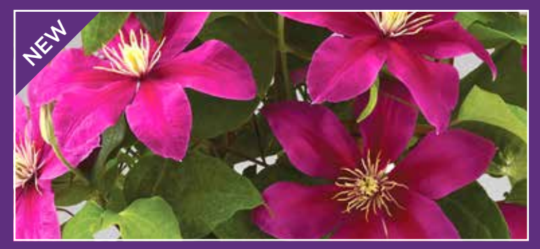
ACROPOLIS<sup>TM</sup> Boulevard Evipo078

A compact very free flowering clematis. It produces an abundance of bright pink flowers that are 3-4 inches. Blooms early summer through late autumn. Acropolis is very showy and grows to 4'.