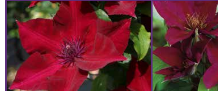
NUBIA Boulevard® Evipo079® This very free flowering clematis has stunning dark red flowers and dark red anthers. This photo is true to color! Flowers are 5" in size and grows to 5'. It blooms June through August and again in September. Blooming comes from along the whole stem so blooms appear from top to bottom of plant. It is pruning type 3 so takes a hard prune in early spring.

The early flowers open ruby red at the center of the flower, fading to brilliant fuchsia and then orchid color at the edge of each petal. The flowers fade to lavender with a pink bar. Its dancing white anthers are burgundy tipped. It is an early bloomer and is a great repeat bloomer throughout the summer months.