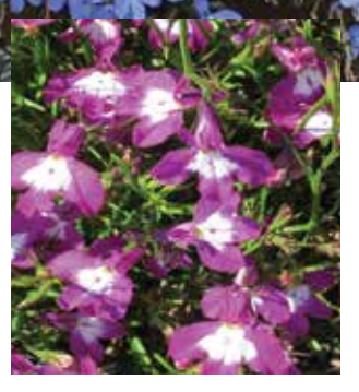
Trailing Purple with Eye Sunlobe Torecama

Lobelia Campanulaceae Annual Continuous, spring through summer 1/2 - 2/3 inch Continuous, spring through summer 1/2 - 2/3 inch Continuous, spring through summer 1/2 - 2/3 inch Continuous, spring through summer 55-72°F 5.8-6.2 4 inch and 6 inch 5 6 inch and 8 inch 4-inch pot (1 liner) – 4-6 weeks, 1-2 pinches 6-inch pot (2-3 liners) – 5-7 weeks, 1-2 pinches