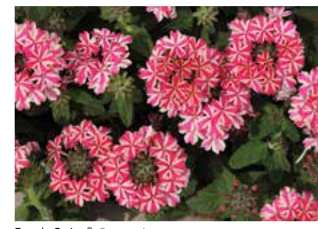
Candy Stripe<sup>®</sup> Sunmarirosta