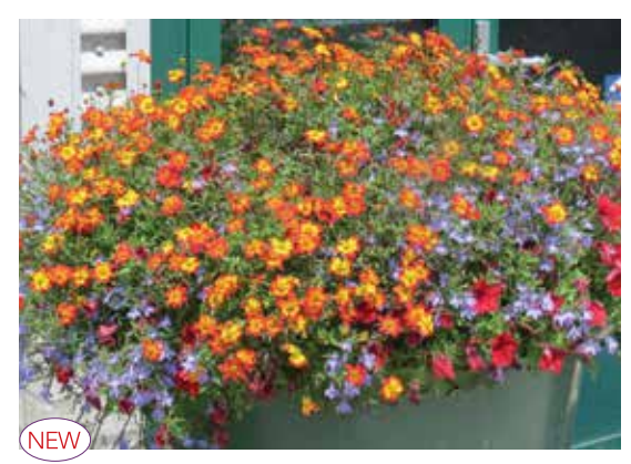
Bee Colorful Beedance Painted Red Suntory Lobelia Trailing Sky Blue Surfinia Deep Red