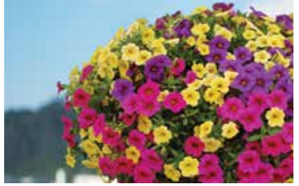
Carnivale Million Bells Trailing Blue 09 Million Bells Trailing Magenta Million Bells Trailing Yellow