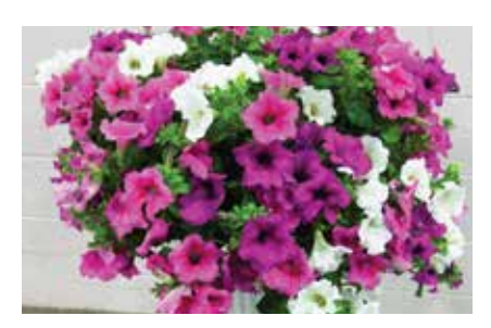
Pink Cheer Surfinia Briliant Pink Surfinia White Improved Surfinia Rose Veined