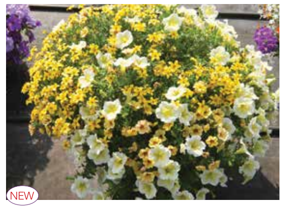
Bee Bananas Beedance Yellow Million Bells Tropical Delight Surfinia Trailing Yellow