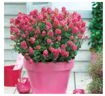
Upright Rose Pink Sunjodiropi

Crop times 4-inch pot (1 liner) – 5-7 weeks 6-inch pot (1-2 liners) – 7-9 weeks 10-inch baskets (4-5 liners) – 9-11 weeks