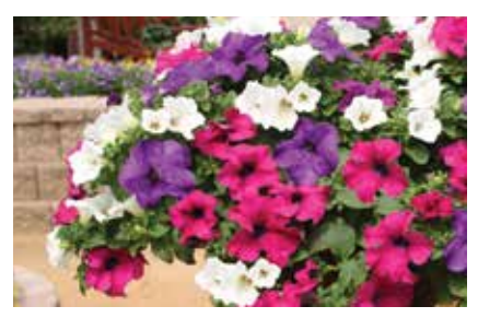
Surf's Up! Surfinia Giant Purple Surfinia White Improved Surfinia Giant Blue