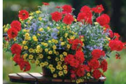
Spring Marvel Million Bells Mounding Neon Yellow Suntory Lobelia Trailing Sky Blue Temari Trailing Red