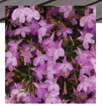
Trailing Pink Sunlobe Torepin