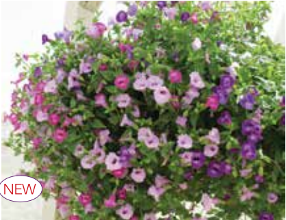
Purple Reign Summer Wave Large Violet Summer Wave Large Silver Summer Wave Amethyst