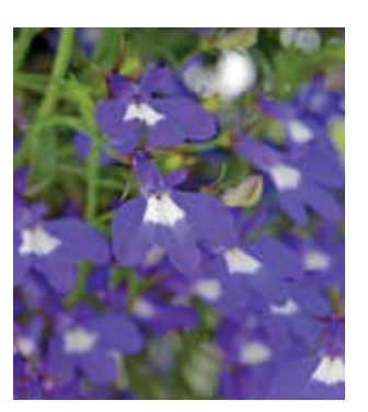
Trailing Blue with Eye Sunlobe Torebu

Trailing Sky Blue Sunlobe Toresubu 2016 Best of Species, Penn State University