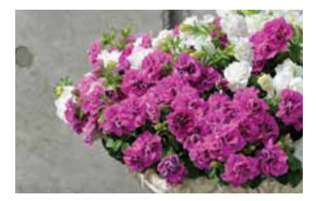
Double Romance Surfinia Summer Double Pink Surfinia Summer Double Rose Surfinia Summer Double White