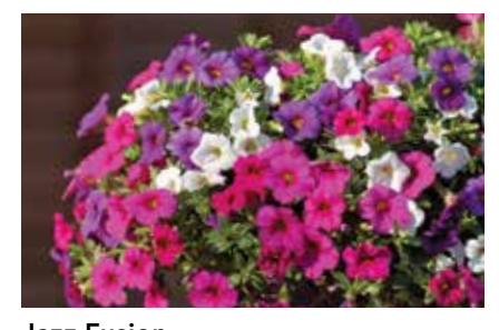
Jazz Fusion Million Bells Trailing Magenta Million Bells Trailing Blue 09 Million Bells Trailing White