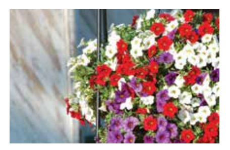
Memorial Day Mix Million Bells Traling Blue 09 Million Bells Trailing Red Million Bells Trailing White