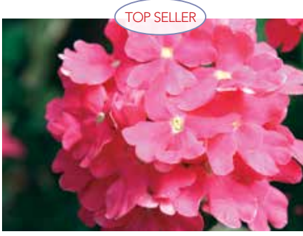
Bright Pink Sunmaricorapi2