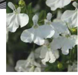
Trailing White Sunlobe Toreho