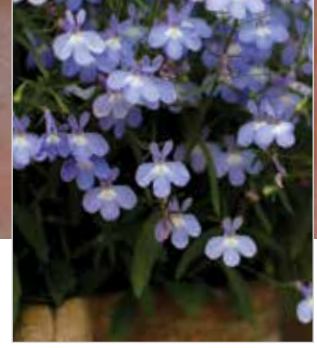
Compact Sky Blue Sunlobecosubu 2014 Best of the Rest Michigan State University

Sunlobe Bulucon 2016 Best of Class, Colorado State University 2015 Best of Species Penn State University 2014 Best Lobelia Colorado State University 2014 Early Season Favorite Michigan State University