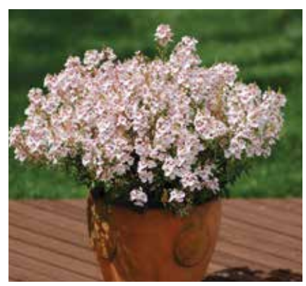
Upright Blush White Sunjodi 042 2014 Early Season Favorite, Michigan State University