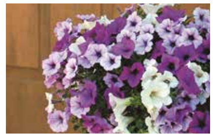
Plum Perfection Surfinia Blue Veined Surfinia White Improved Surfinia Wild Plum