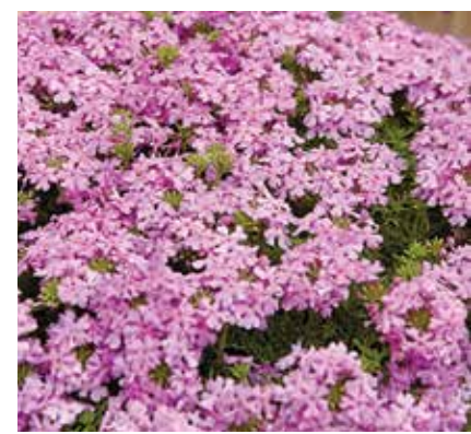
Pink Improved Suntapiripi