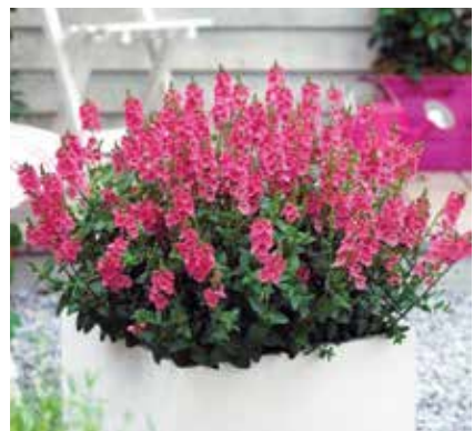
Upright Bright Pink Sunjodiblupi