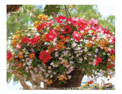
Bee Fabulous Beedance Painted Red Suntory Lobelia Trailing White Surfinia Deep Red