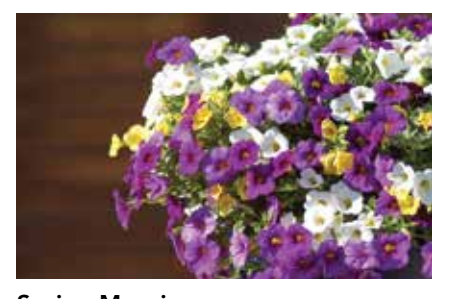
Spring Morning Million Bells Trailing Blue 09 Million Bells Trailing White Million Bells Trailing Yellow