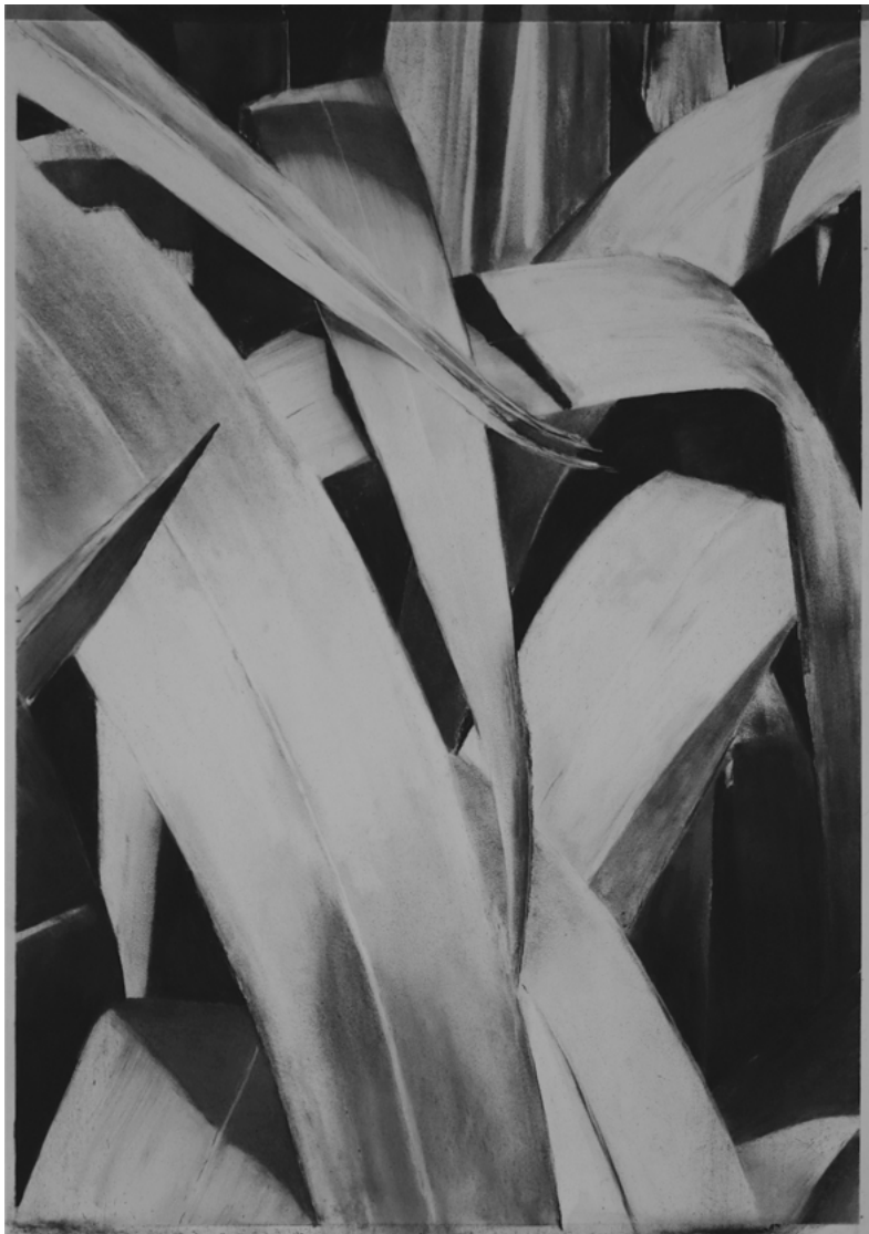
Harakeke 'Matawai Taniwha'. Phormium tenax , Xanthorrhoeaceae. Charcoal on paper. © Neal Palmer.

avenues of exploration for me which is what I had hoped the residency would do. I will continue to visit, to gather reference and inspiration from the Gardens, and would highly recommend the residency to any artists working in the field of botanical art.