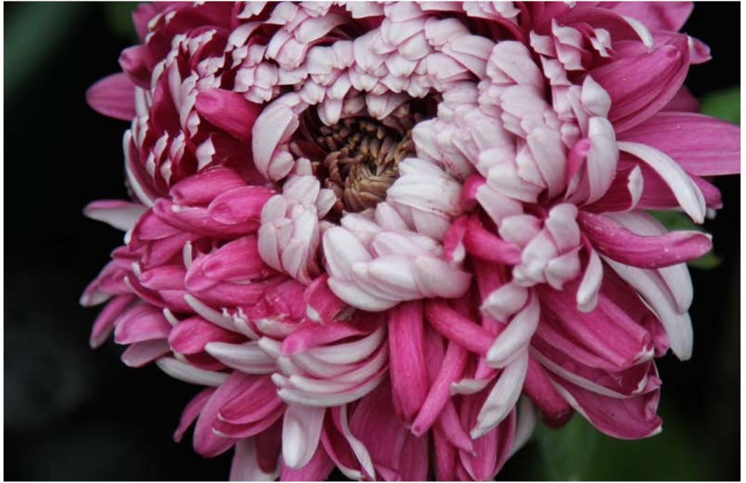
Chrysanthemum 'Elizabeth Shoemith' in the Temperate House at Auckland Domain