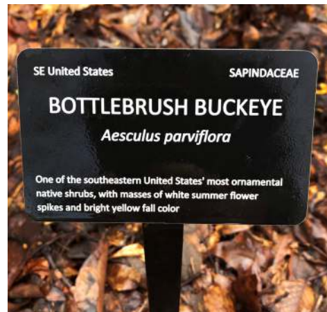
ABOVE Plant identification tag.

Managing Living Collections means rapidly adapting to all external pressures – extreme weather, insect infestations, broken irrigation, water pollution, contaminated soil, school bus drivers, drunk drivers, deer, dogs, and carefully planned construction are just a few challenges that were encountered in the last year. When a plant dies or is removed, this recordkeeping functions in reverse. The plant is removed from the garden along with its corresponding labels. The database entry for the removed plant is then updated to indicate that the status for that plant has changed. Importantly, the accession number and corresponding record for the plant are not removed from the database,