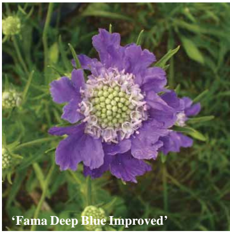
'Fama Deep Blue Improved'

Postharvest Recommendations: Does not like being cut in the heat (3); Strip the leaves off the stem to expose flower; Floralife and cool water.