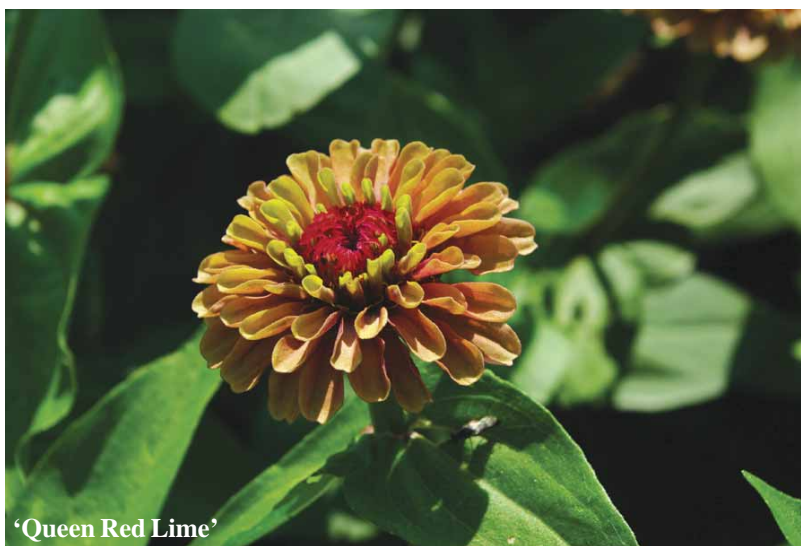
‘Queen Red Lime’