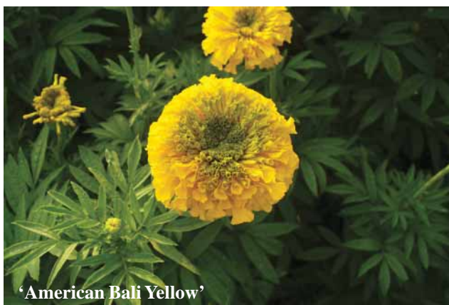
‘American Bali Yellow’

Additional Comments: Strong fragrance; Selling was a love/hate affair; Stems quickly