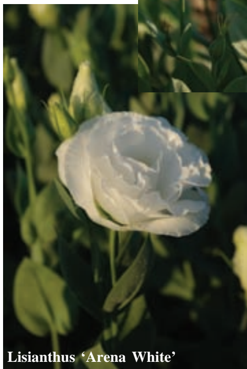
Lisianthus ‘Arena White’