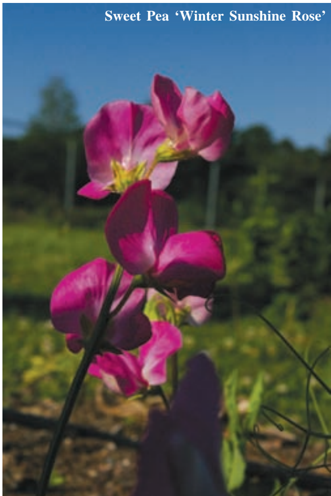
Sweet Pea 'Winter Sunshine Rose'

Postharvest Handling: Use bulb food or high sugar floral solutions.