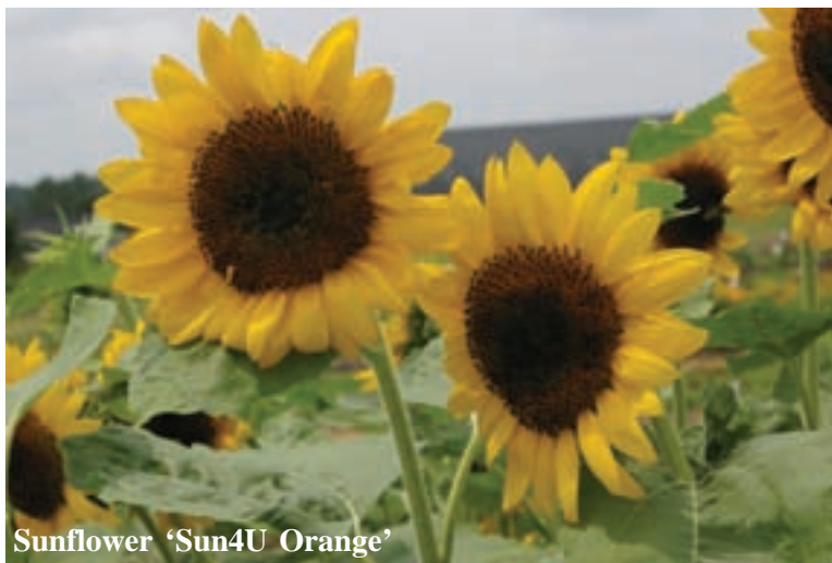
Sunflower 'Sun4U Orange'

General Comments: This variety and 'Carmel' were my favorites in this grouping of sunflowers; The whole series is a winner and I want to grow it again next year. Better than Pro Cut; Harvested between 8/8-8/20 (direct seeded into the field on May 28); Removal of main stem produced abundant side shoots which had smaller blooms and thinner stems but were much more practical for cut flower use compared to large main stem; Good branching variety but does not fit into our program; Basically a normal cut flower sunflower, created some problems with the wholesale account, this year due to a very cool spring, the sunflower rotations came into flower at about the same time, like everyone, we pick our sunflowers when the first petal is just beginning to lift off, they look pretty similar at this point, the color of the center is about the only thing that looks different - while