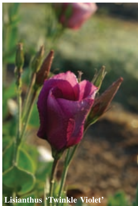
Lisianthus 'Twinkle Violet'

in the field, wish I would have known! I worked so hard to get a crop and really wanted to see all of these beauties in full bloom, bummer!; Single flowers not as attractive as doubles in trial, showed rain flecking.