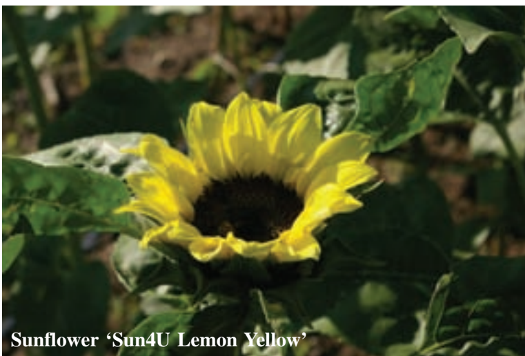
Sunflower ‘Sun4U Lemon Yellow’

size; An interesting feature of this cultivar is the smaller leaf under the flower, it makes for a very attractive display when bunched as the leaves are below the flower head, flowered earlier than the traditional sunflowers that I had planted at the same time; Large bloom on strong stem, pollenless; Nice form, nice size; Stocky, sturdy plants; Pretty; Early to flower.