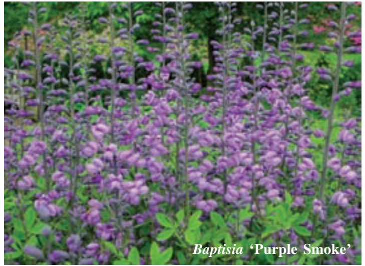
Baptisia ‘Purple Smoke’

Problems: The flowers have ugly thorns, several years ago I received seed for a white-flowering echinops from a friend, this one is the same cultivar, we plowed ‘Star Frost’ in because they are invasive on our farm; Plants arrived in poor shape, had to be transplanted into pots to recover before transplanting into permanent bed, we did not have enough stems to market test.