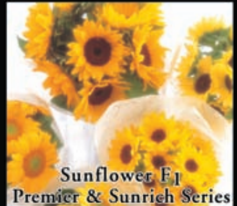
Sunflower F1 Premier & Sunrich Series

For more information contact your preferred broker or American Takii, Inc. at 831-443-4901, or www.takii.com .