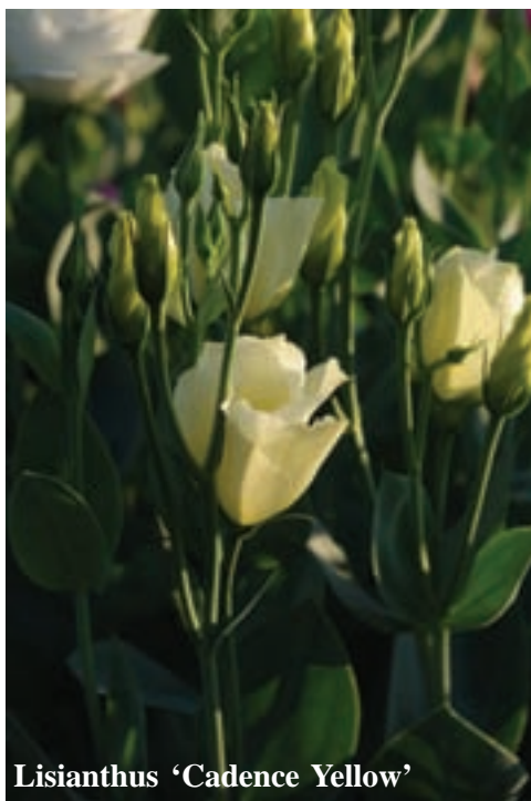
Lisianthus 'Cadence Yellow'

Problems: Stems were too short (2); Moderate fade; Marginally wind damaged, stems bend with the wind and grew that way, but generally straightened out well once cut and cooled; The seed came late (February) and although I started it right away, the plants in the field never got to maturity, we had a very cold/late spring (up to 6 weeks lost) and this did not work in their favor, also, in the future I will only grow lisianthus in the hoop, western Washington is just too cool to attempt them