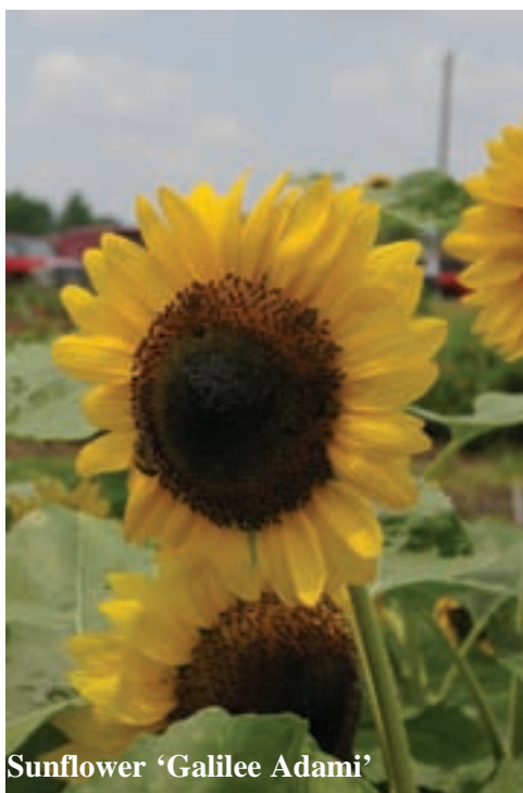
Sunflower 'Galilee Adami'

Problems: Large flower heads (3); Height varies a lot (2); Large green collar of smaller leaves around base of flower, which we removed; Stalk