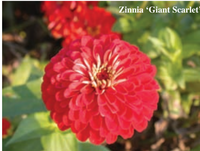
Zinnia 'Giant Scarlet'

Harvested between 7/10-8/8 (transplanted to the field April 22); Harvested between 7/16-8/18 (transplanted to the field May 22); Entire zinnia crop was planted late while I was out of town, this year, I pinched in August and cut back severely in late August which did