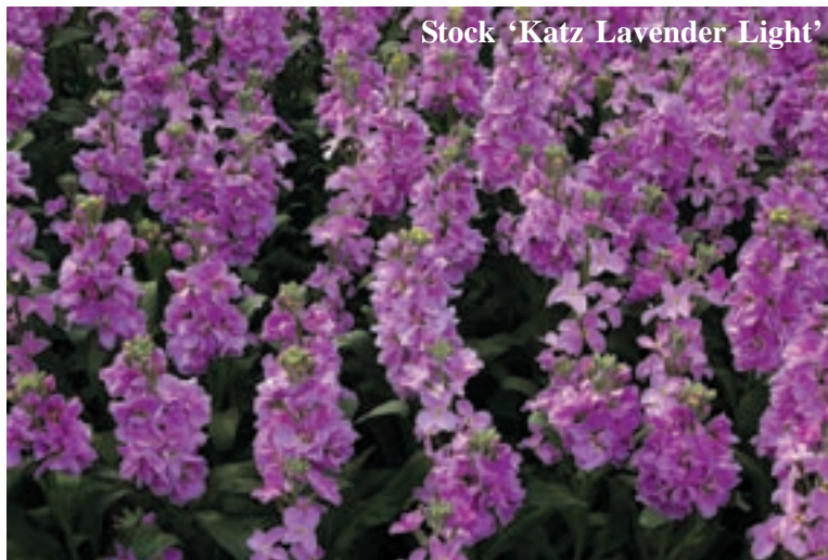
Stock 'Katz Lavender Light'

Small cluster of flowers at the top of the stem; Too short, did not yield well and had a very