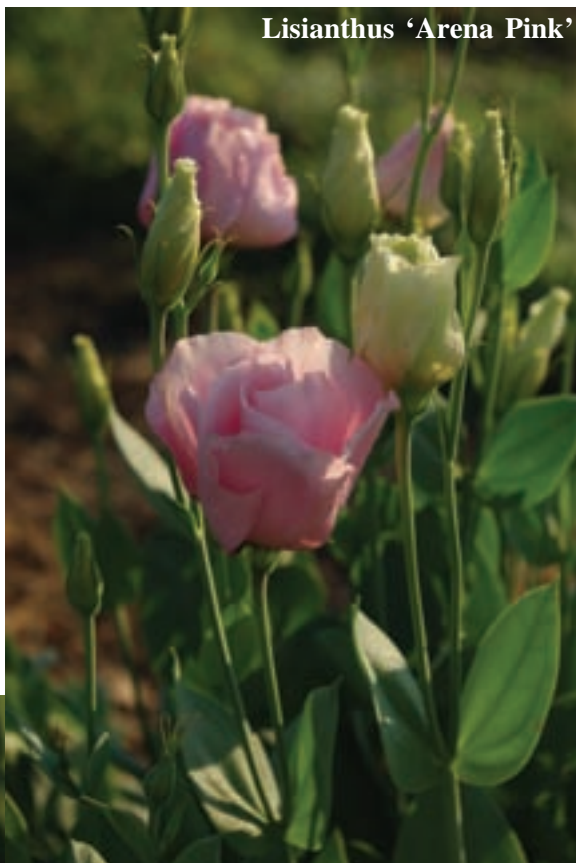
Lisianthus ‘Arena Pink’

Similar Cultivars: None listed by respondents.