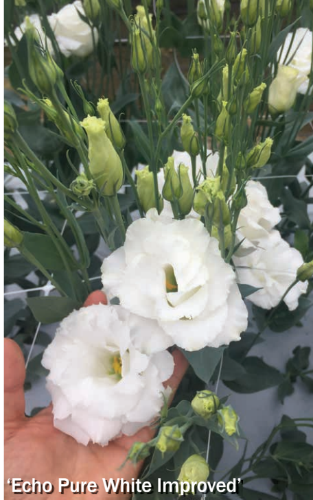
'Echo Pure White Improved'