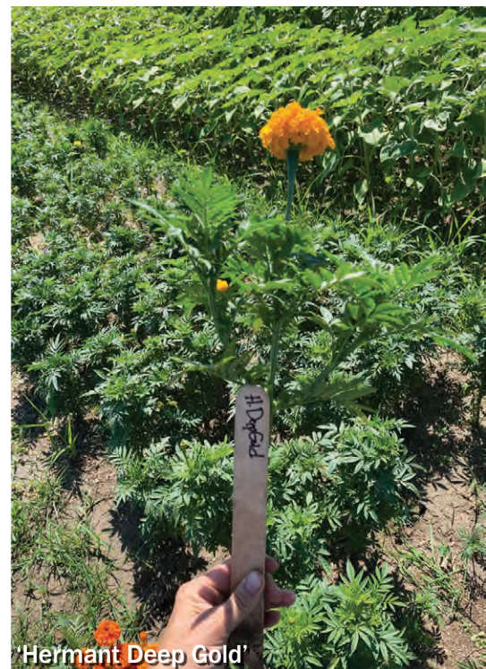
'Hermant Deep Gold'