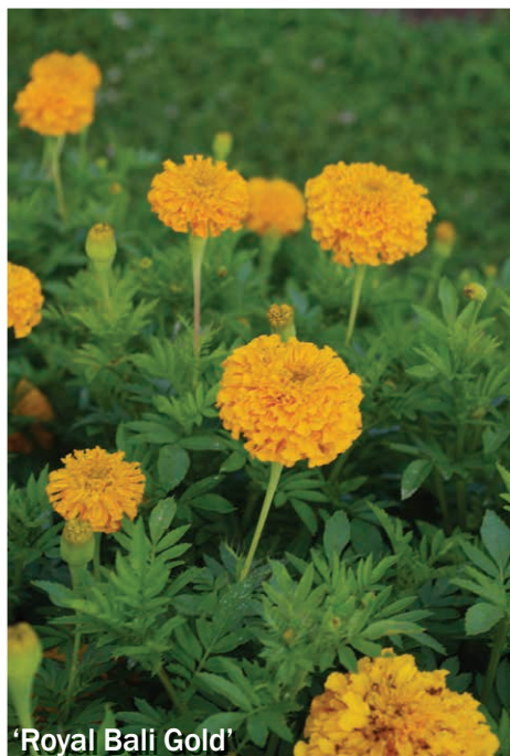
'Royal Bali Gold'

Comments: The colour of this marigold would make it easier to include in summer bouquets, the stems were more difficult to cut, to avoid this I would recommend cutting the centre stem in early August to encourage more usable stems, average bloom size was 2", overall height was 26-28", the typical marigold odour was minimal, we have so many other flower choices for August and early September that we did not use it much in our bouquets; Would not say that this is a very reliable or prolific variety, doesn't contribute as much vibrancy or bright color to a bou-