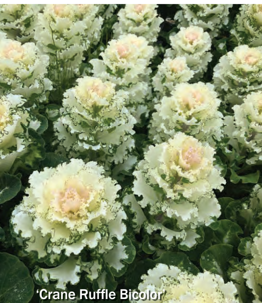
‘Crane Ruffle Bicolor’