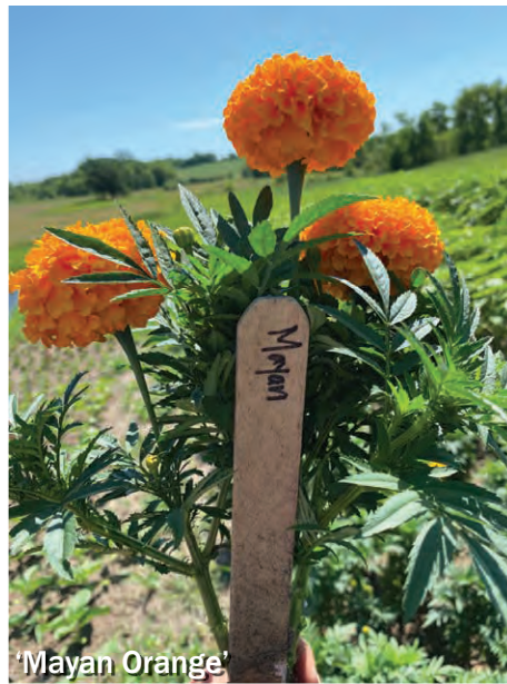
‘Mayan Orange’

Good Qualities: Bright orange color (5); Uniform plant growth; Nice long stems—low fragrance; Could have potential for garland use; Long stems, able to harvest with good branching, full blooms; The flower size is 1/3 the size of most marigolds in this class and the scale of the flower is a good one for arrangement work, this is the favorite of