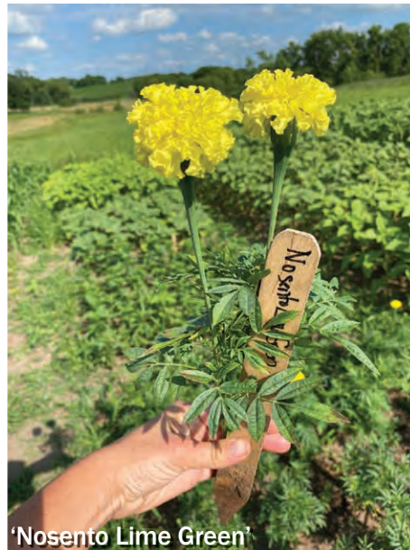
‘Nosento Lime Green’

all those trialed this year; The flowers were a bit smaller than the other marigolds tested but that made it easier to put in mixed bouquets; Very long vase life. Problems: Small heads and short plants (5); Weak and not productive to begin with, did gain some height later in the season, overall not a competitive variety compared to ‘Coco’, ‘Jedi’, and ‘Chedi’; Japanese beetles love marigolds; We didn’t cut it, the orange colour is quite pale; Flop in wind; None, other than nobody buys cut marigolds in my area; Did not yield usable stems, would grow again only if considering for garland