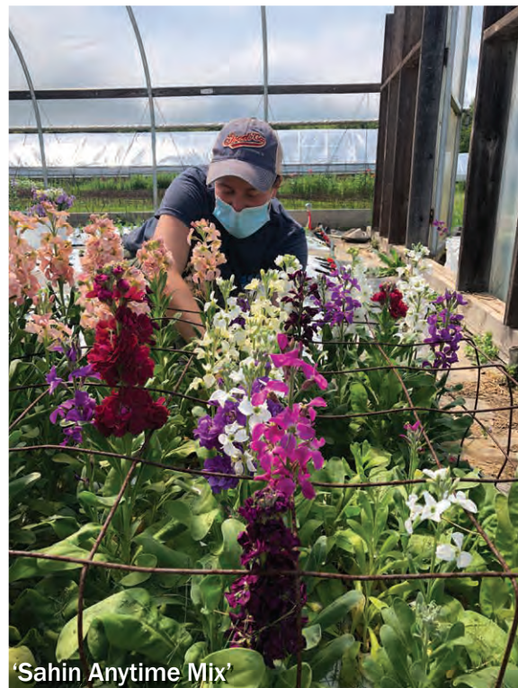
'Sahin Anytime Mix'

Problems: Very short (4); None; If growing again, I would sow it earlier and grow in the hoophouse; White colour were singles and stunted; We aren't fans of mixed colors, not heat tolerant at all; Plants are short and this is true in both the spring tunnel (transplanted 4/15/20) and spring field planting (transplanted 5/15/20), although bloom quality was good and bloom columns were compact and dense, the plants were shorter than the Iron series in multiple environments.