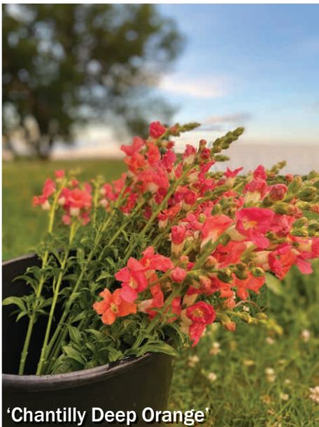
'Chantilly Deep Orange'