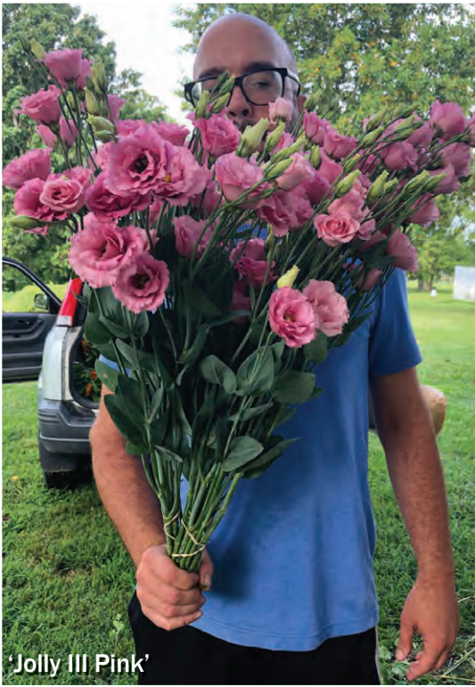
'Jolly III Pink'

But ornamental kale is a prime example of why we do trials. While we can't grow a decent crop in our Zone 8a climate, growers in other areas can and they certainly loved the cultivar in this year's trials. 'Crane Ruffle Bicolor' was the top-ranked cultivar in the trial. The ruffled, creamy white leaves were a "unique novelty to add to the selection of brassicas now available". The heads were a nice size, large enough to stand out but not so big as to limit their use. Stem length ranged from 12 to 30 inches with an average of 22 inches. Ornamental kale usually has a great vase life and this one is no different with trialers reporting an average of 12 days. Unfortunately, not all were enamored of it. All the top scores came from those in Zones 4 and 5. Certainly, we think there was some self selection going on; those who traditionally can't grow ornamental kale well in the spring may have passed on evaluating it.