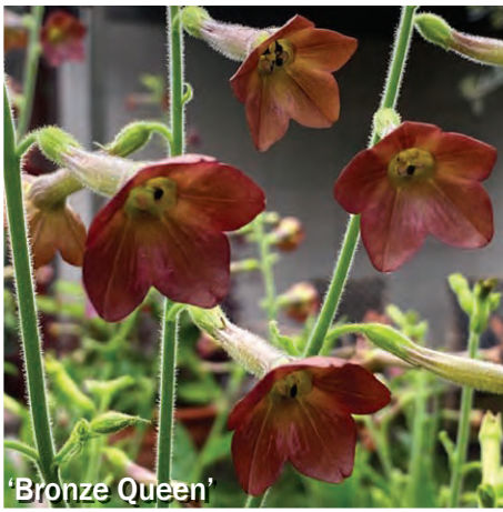
'Bronze Queen'

growing season was very dry and with no field irrigation the marigolds were off to a slow start, the height overall was 110 cm, this was my favourite orange marigold in the trial; See also general comments above.