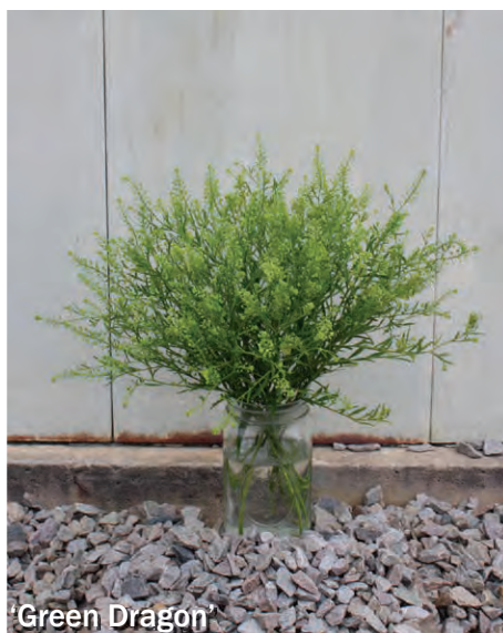
'Green Dragon'

Comments: These dianthus were affected with thrips early in the season, I noticed them doing poorly and treated them, they recovered but never grew tall enough to bother cutting; The plant height may be shorter than normal due to our drought and lack of irrigation, all of the EXP Dianthus were quick to bloom from May seeding and end June transplant: first buds end July; Other dianthus perform much better in the field; Larger floret size, but smaller overall head size than Sweet series, otherwise unremarkable; We grew these varieties alongside the Sweet series and preferred the rounded, globe-shape and more compact blooms of the Sweet series to these spray-type blooms, while the colors are bright and the stands are uniform, the Sweet series was a little easier overall to harvest; We planted these in the spring, started shorter than got taller, most likely won't grow any of the EXP ones again.