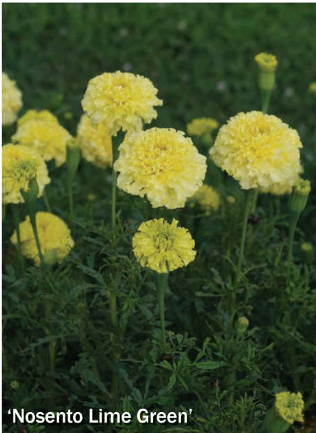
'Nosento Lime Green'