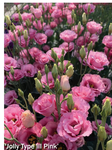
‘Jolly Type III Pink’

Comments: This was one of our favorite flowers out of all the flowers grown on