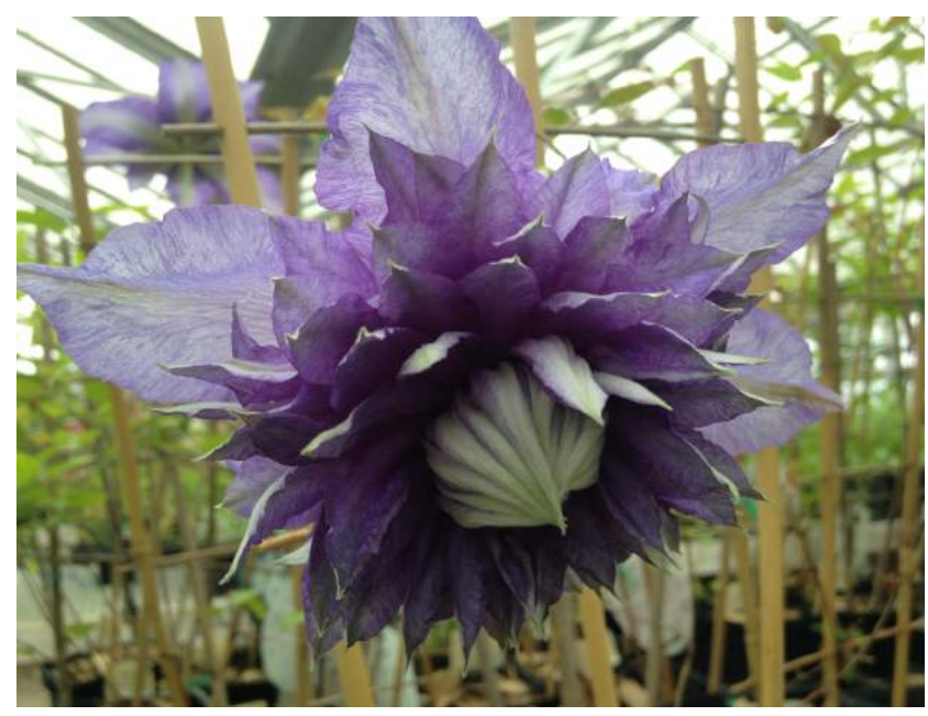
Clematis 'Multi Blue'