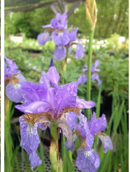
Iris siberica 'Blue Moon'