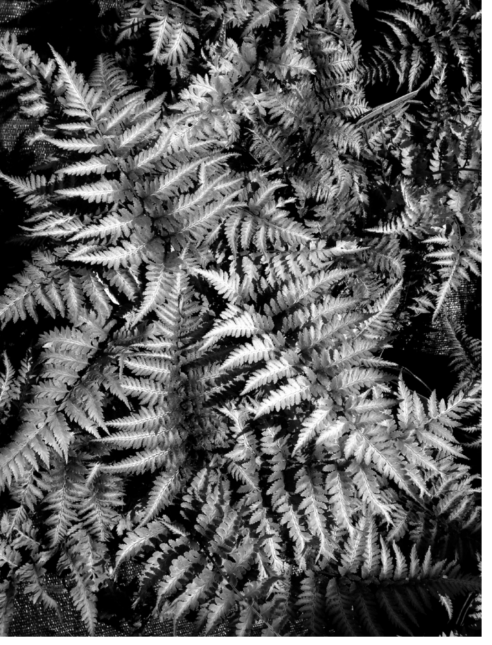
Athyrium niponicum 'Metallicum'

Our favorite variety of this beautiful fern, growing to 1-2' high x 1.5-2' wide, with a dramatic silvery sheen overlaying the dark reddish-green leaf color. Wonderful in a shade border. Grow in part to full shade, rich, moist soil. Zone 3.