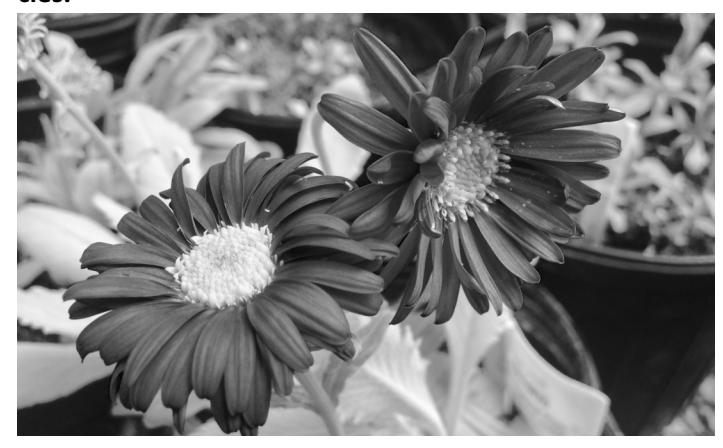
Aster alpinus 'Beauty Dark Blue'

12" tall alpine rock garden plant, with a compact basal rosette of gray-green foliage and prolific rose-colored blossoms in early summer. Locate in the front of the border or rock garden, in average soil and full sun. Native to Alaska and parts of Canada. Zone 3. North American native species.