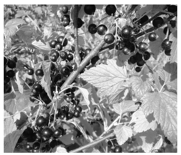
Blackcurrants on the bush

A vigorous blackcurrant up to 6' tall with prolific production of large, firm, mild berries. Immune to white pine blister rust and highly resistant to powdery mildew. Early to midsummer fruiting. Likes rich, moist or even wet soil close to neutral pH. Zone 3.