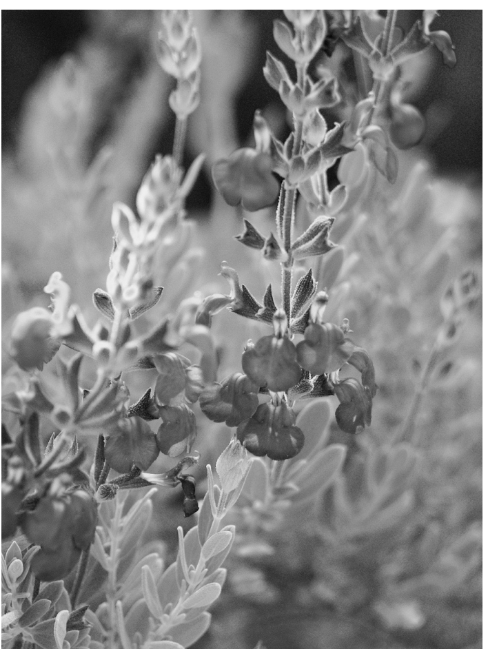
Salvia chamaedryoides in bloom

A striking, unique biennial. In its first year, the plant hugs the ground as a large rosette of 8" long, heart-shaped, densely fuzzy silver-gray leaves, adding a wonderful textural element to the garden. The second year, many 30" flower spikes emerge to create a bushy clump 12" wide or more,, bearing elegant blue-lavender flowers. It prefers full sun and well-drained, sandy, medium-rich soil. Zone 5.