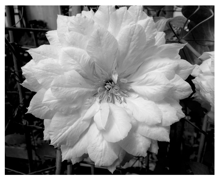
Clematis 'Duchess of Edinburgh'

Pruning Group #3: Flowers in late summer or fall, on new growth produced earlier in the season. Prune these just before they grow in the spring, cutting back to the strong buds within a foot or so of the ground.