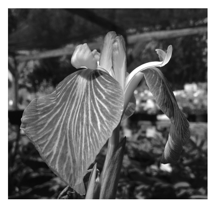
Iris ensata 'Gracieuse'

32", glowing medium blue blossoms with creamy white centers and white veins. Mid-season repeat bloomer.