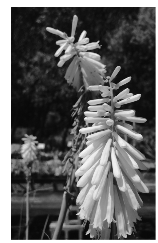
Kniphofia uvaria 'Flamenco'

18-36" tall with spiky foliage and plentiful orange and cream-colored flower spires in midsummer to fall. Showy! Likes well-drained soil and full sun. Zone 5.