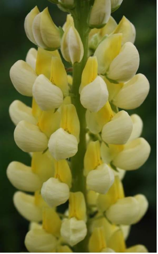
Lupinus polyphyllus Russell 'Chandelier Yellow'