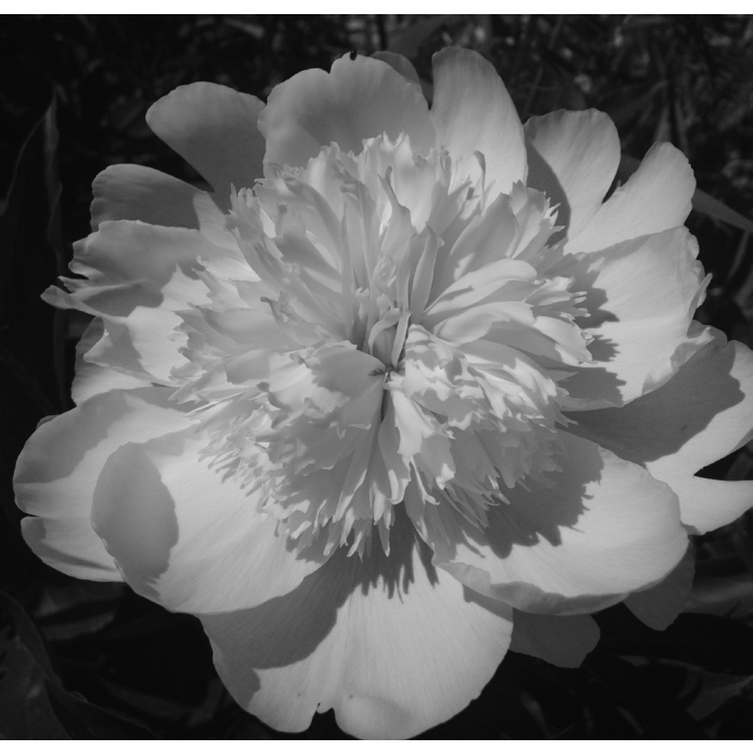
Paeonia 'Bowl of Beauty'