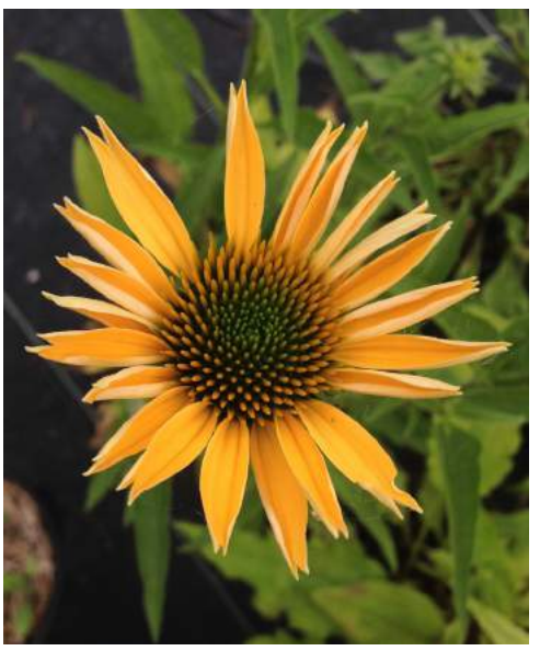
Echinacea x hybrida 'Warm Summer'