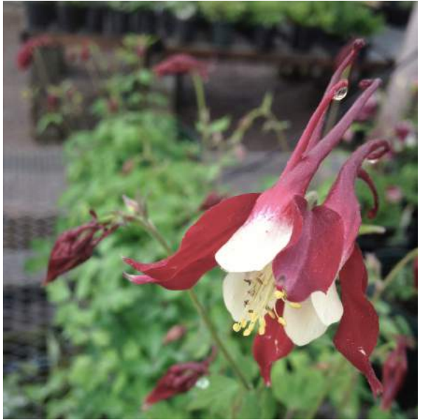
Aquilegia caerulea 'Red Hobbit'