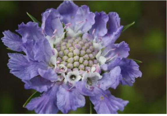
Scabiosa caucasica 'Fama Deep Blue'