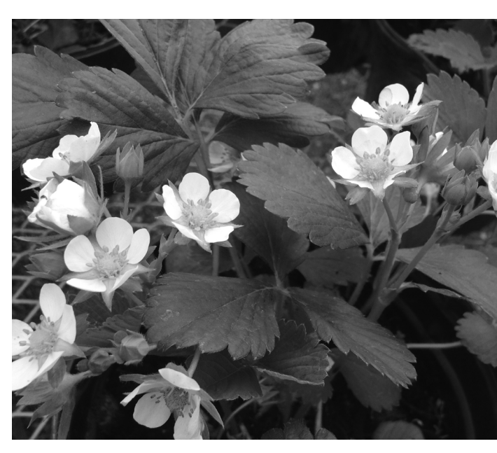
'Mara des Bois' strawberry blossoms

Mid/late season bearing plants with delicious, intensely flavored berries. Zone 4.