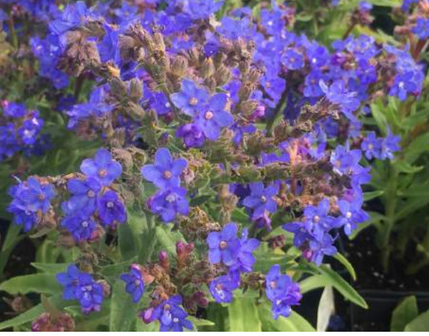
Anchusa capensis 'Blue Angel'