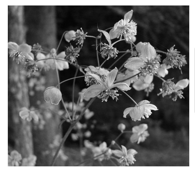
Thalictrum rochebrunianum 'Lavender Mist'

Striking plants, 4-8' tall with big, well-branched sprays of delicate lilac flowers in mid to late summer, dark purple stems, and large finely divided leaves in elegant tiers. The spiky dark purple seedheads are attractive too. Very sturdy—the stems are completely self-supporting even when very tall. Needs rich, well-drained, consistently moist soil in part shade. An excellent and distinctive addition to the woodland, wildflower or cottage garden. Will slowly naturalize. Zone 3.