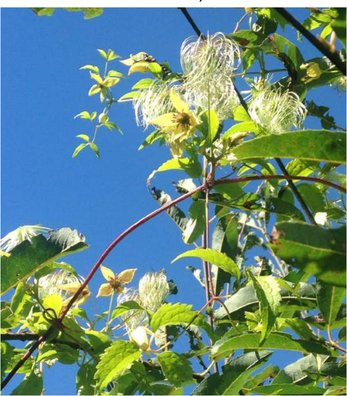
Clematis chiisanensis 'Korean Beauty'