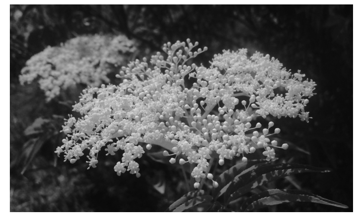
Sambucus nigra ssp. canadensis in bloom