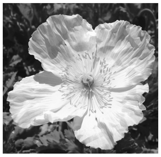
Papaver nudicaule 'Pulcinella White'

(Iceland poppy) 12" tall with long-blooming, large pure white flowers on sturdy stems.