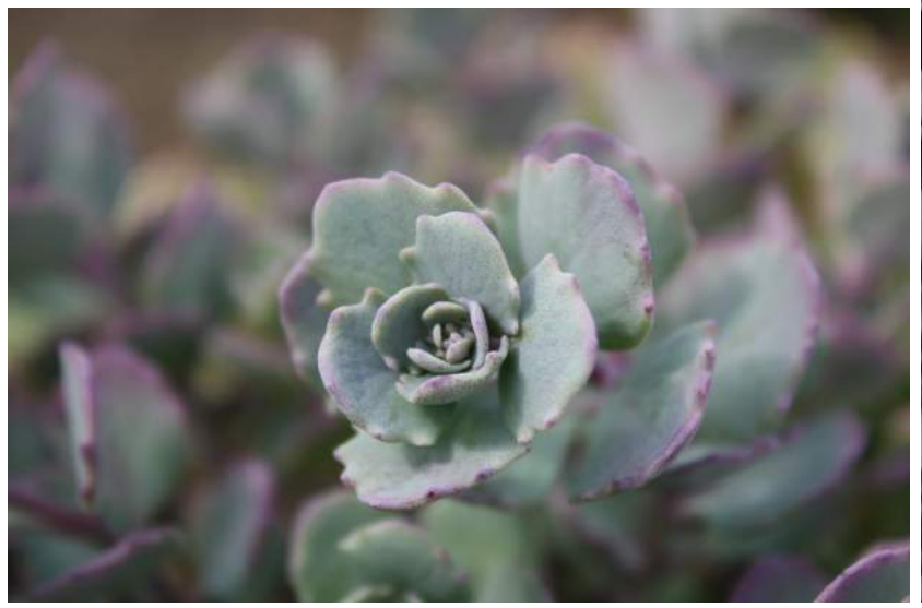
Sedum 'Bertram Anderson'