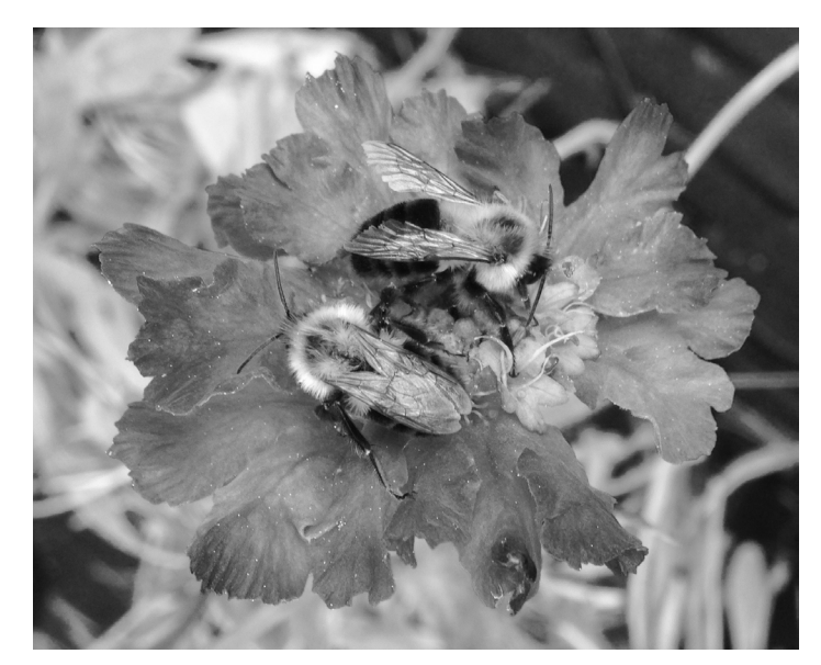
Scabiosa caucasica 'Fama Deep Blue'

Like 'Fama Deep Blue', only in lovely pure white. Very elegant. Needs rich, loamy soil, full sun. Zone 2.