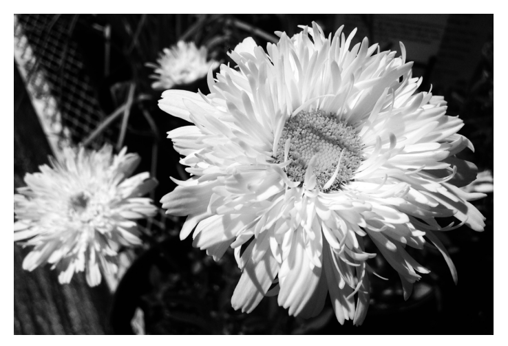
Leucanthemum maximum 'Crazy Daisy'

A twist on the Shasta Daisy, this 2-3' cultivar features plentiful fully double blooms with feathery white petals and golden eyes. An excellent, surprising accent to the back of the border or bed. Likes well-drained soil. full sun. Zone 3.