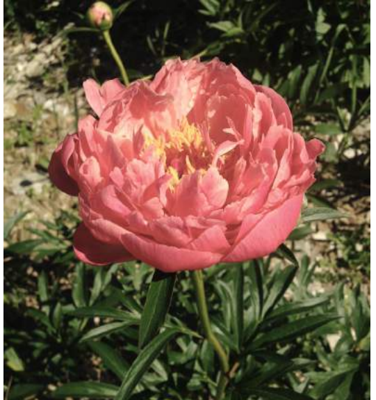
Paeonia 'Coral Charm'