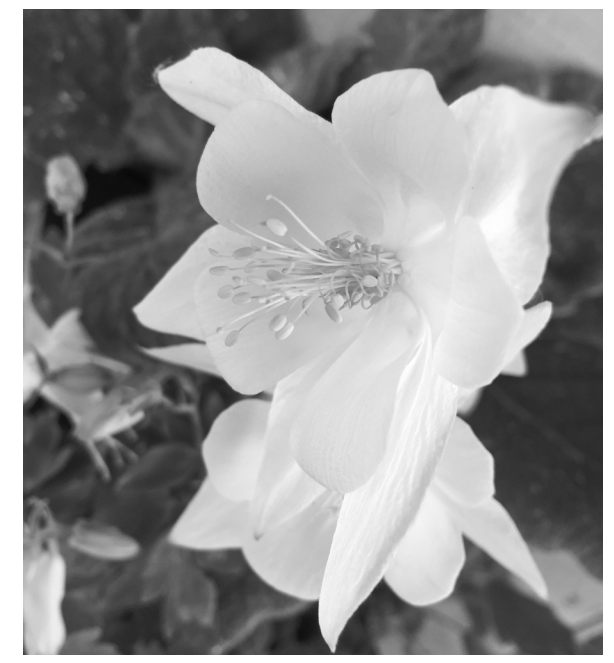
Aquilegia caerulea 'Songbird Dove'