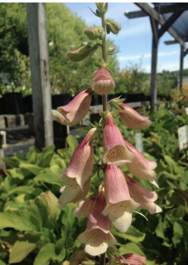
Digitalis x hybrida 'Polka Dot Pippa'