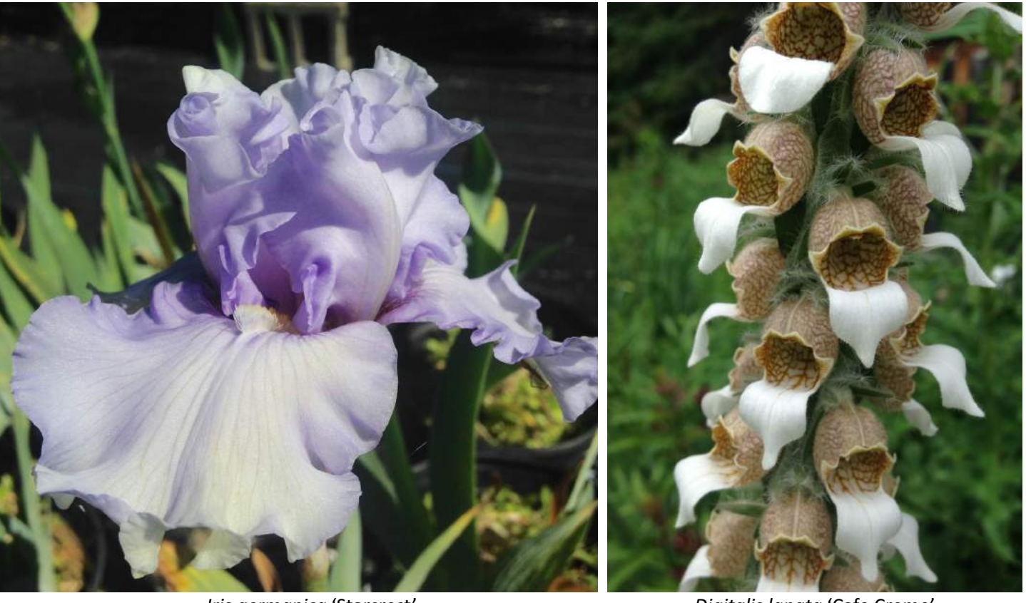
Iris germanica 'Starcrest'