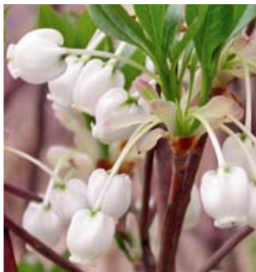
The autumn colour of Enkianthus perulatus 'J.L. Pennock' (above) and the flowers of the species (below)