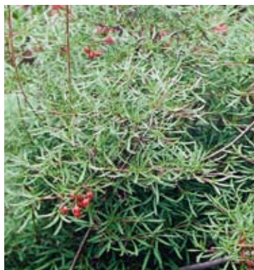
The narrow leaves of Enkianthus cernuus 'Yanagiba'