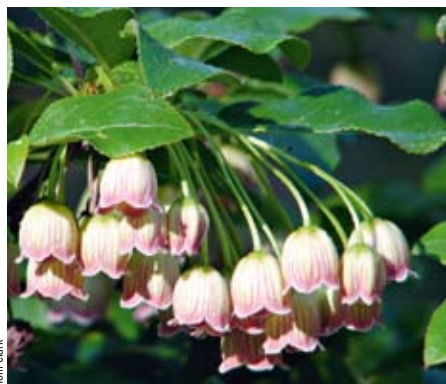
The multicoloured flowers of Enkianthus chinensis

Curiously, this species is poorly represented in gardens for unknown reasons. It deserves further introduction and evaluation, and the long pedicels may be imparted