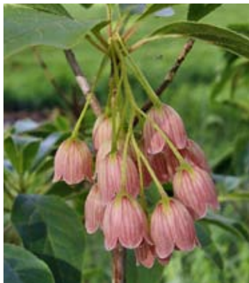
Enkianthus campanulatus f. albiflorus