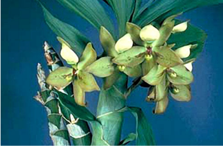
Figure 6 -- Cycnoches warscewiczii var. warscewiczii 'Green Glow', CCM/AOS

differences in shape of the basal callus of the lip (Alien, 1952). These differences are subtle, however, and orchid growers will find Cycnoches species offered for sale, as well as awarded, under any three of these names, or combinations thereof! Hobbyists should expect, though, that any plant purchased with any one or more of these names will produce flowers resembling those pictured in FIGURES 4 and 5.