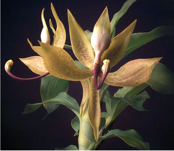
Figure 2 — Cycnoches loddigesii

rescences of Catasetum species initiate from the bases of the pseudobulbs, those of Cycnoches species are apical in origin. This brings the flower display of a Cycnoches in large part above the base of the plant, whereas the position of the flowers on a Catasetum is often at or below the level of the plant's container.