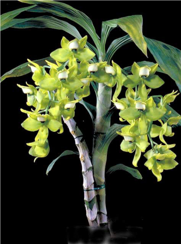
Figure 5 -- Cycnoches ventricosum var. warscewiczii 'Green Glow', CCM/AOS

But what of the female flowers of these Cycnoches species? Some growers consider them more striking than the male flowers (Roccaforte, 1974). Others note that the male flowers and female flowers are very similar, except that the segments of the female flowers are all larger and wider (Vickers, 1968). One scientific study shows that this is indeed the case with Calasetum warscewiczii . This same study also found that plants of Cycnoches warscewiczii grown in full sun produced significantly more female racemes than those grown under shadier conditions, which was also true of the Catasetum species under investigation (Gregg, 1975). Female flowers of Cycnoches species, like their counterparts in Catasetum , are for the most part carried on separate inflorescences which are shorter, more upright, and fewer-flowered than inflorescences carrying male flowers, though "mixed" inflorescences do occur. The plant labeled Cycnoches warscewiczii var. warscewiczii in FIGURE 6 displays seven female flowers on three inflorescences. The most distinguishing feature of the female flowers of these species, however, is the column. While the column of a male Cycnoches flower is long and slender, the column of a female flower is much shorter and thicker, and has a notched end (FIGURE 6). These notches conveniently snag the pollinia from any bee which lands on the lip carrying a pollinarium from a male flower (van der Fijji and Dodson, 1966).