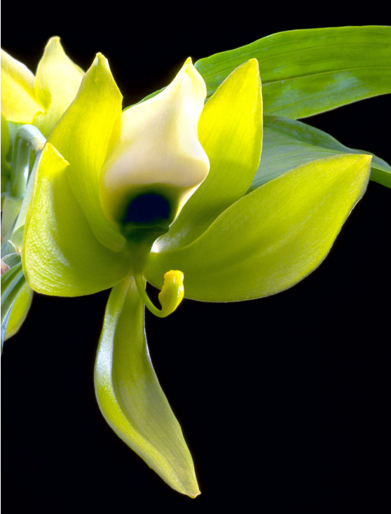
Figure 4 — Cycnoches chlorochilon

the 50's and 60's F (13-18°C). Flower aging in Cycnoches chlorochilon and similar species is more like that of some green Cattleya hybrids than the closely related species and hybrids of Catasetum . The green sepals and petals of these species yellow or bronze with age, a process which is accelerated by exposure to bright light and heat. All the more reason to bring flowering plants of cycnoches out of the light and away from the heat into the interior of rooms where they can be enjoyed.