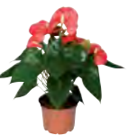
14 months (finished) 30-40 cm plant size (12 cm pot)