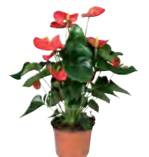
17 months (finished) 55-70 cm plant size (17 cm pot)