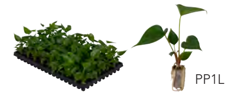
4 months (plugØ 18 mm) 6-12 cm plant size