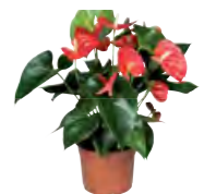
15 months (finished) 40-50 cm plant size (14 cm pot)