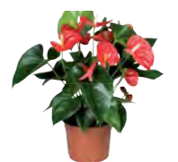
15 months (finished) 40-50 cm plant size (14 cm pot)