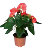
14 months (finished) 30-40 cm plant size (12 cm pot)