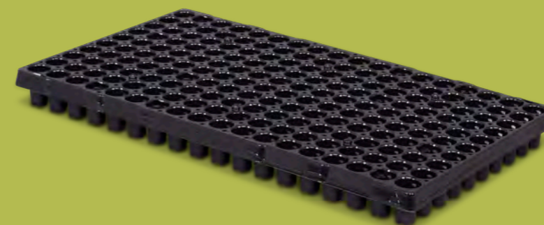
New 180-cell tray

The plants are grown in a paper plug. The structure of the plug allows better moisture absorption after transport and the development of the roots is better. This results in a more uniform growth.