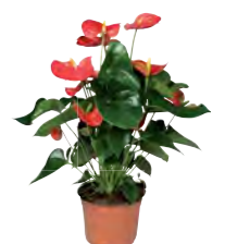
17 months (finished) 55-70 cm plant size (17 cm pot)