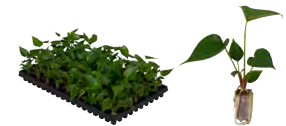
4 months (plugØ 18 mm) 6-12 cm plant size