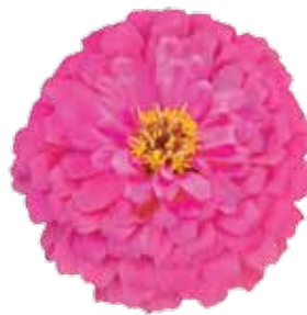
ZIN303 Holi Pink