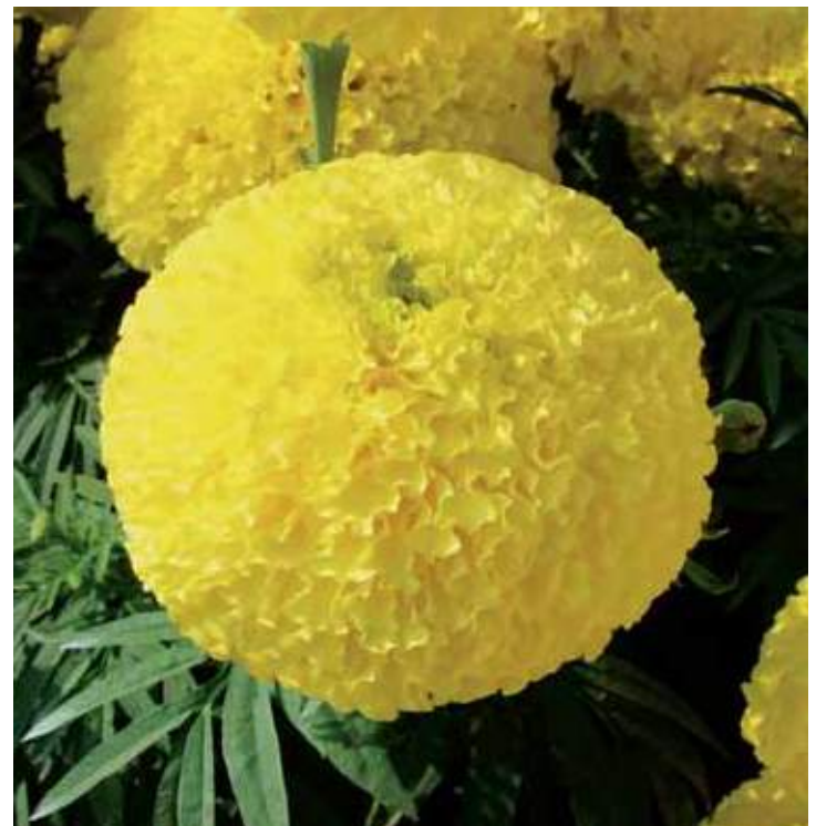
MAR338 Narai Yellow