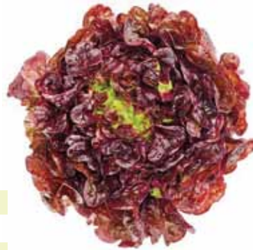
LET021 Hot Springs Red Oakleaf