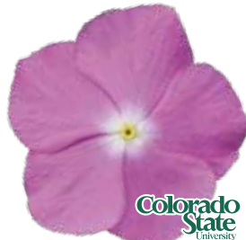
VIN513 Mega Bloom Lavender