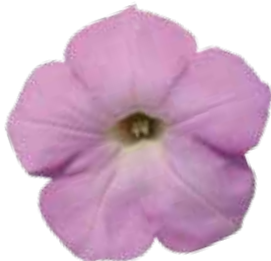
PET156 Radiance Lilac