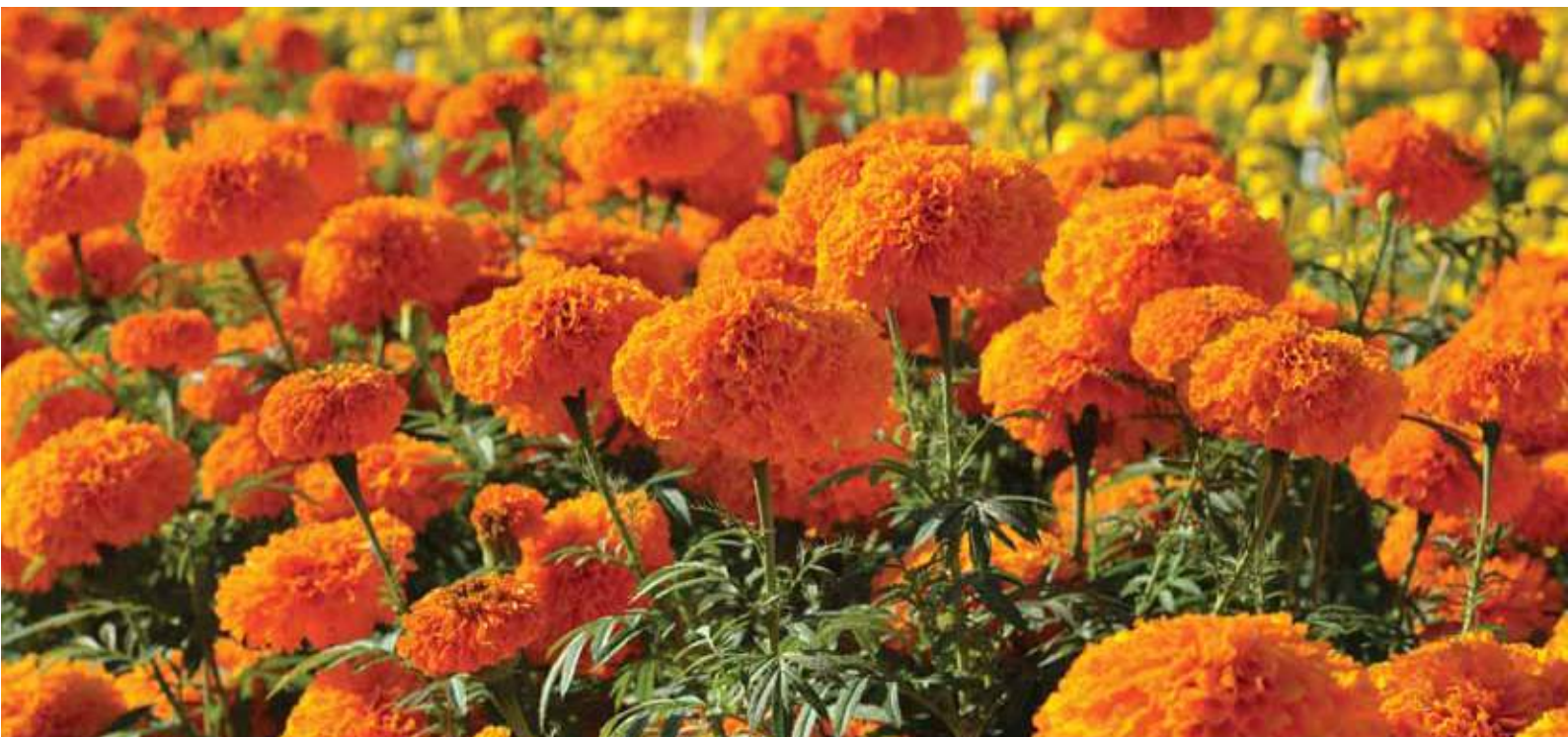
MAR064 Jedi Orange