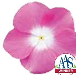
VIN507 Mega Bloom Pink Halo