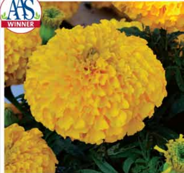
Marigold Big Duck Gold