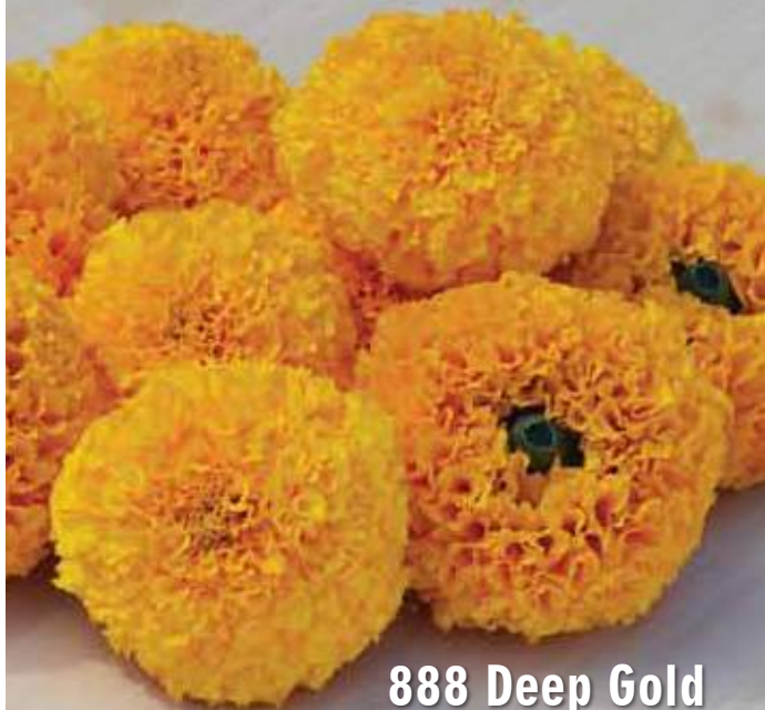
888 Deep Gold