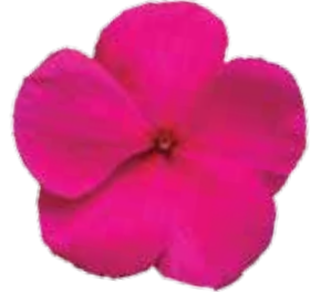
VIN508 Mega Bloom Purple