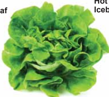
LET027 Hot Springs Butterhead