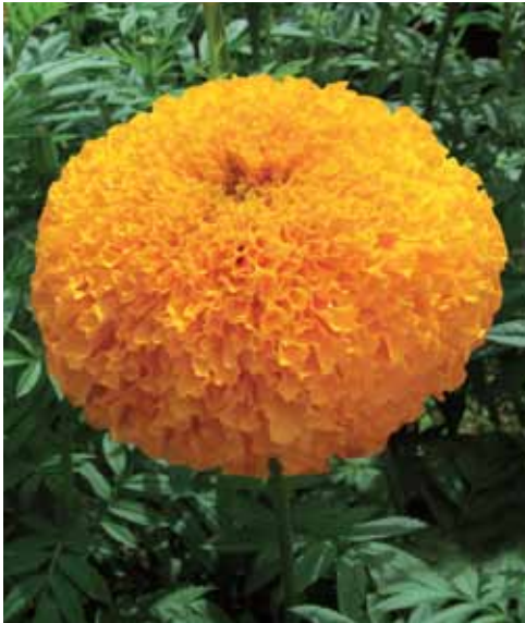
MAR333 Oriental Deep Gold