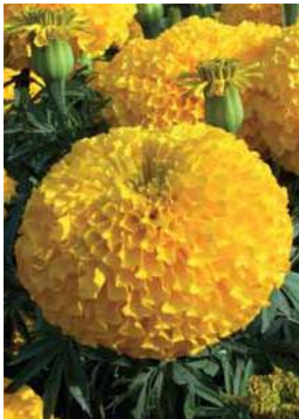
MAR312 Bali Gold