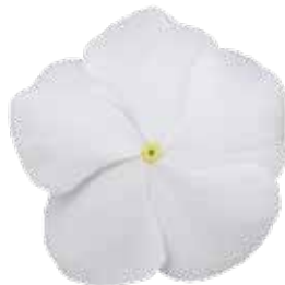
VIN514 Mega Bloom White