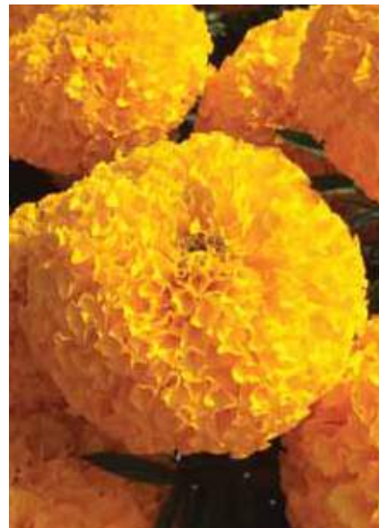
MAR313 Bali Orange