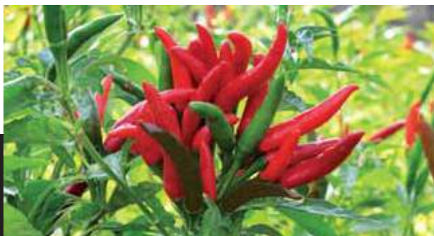
PEP100 Chaw Red