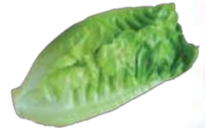
LET026 Hot Springs Mini Cos