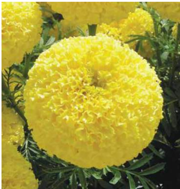
MAR301 Narai Creamy Yellow