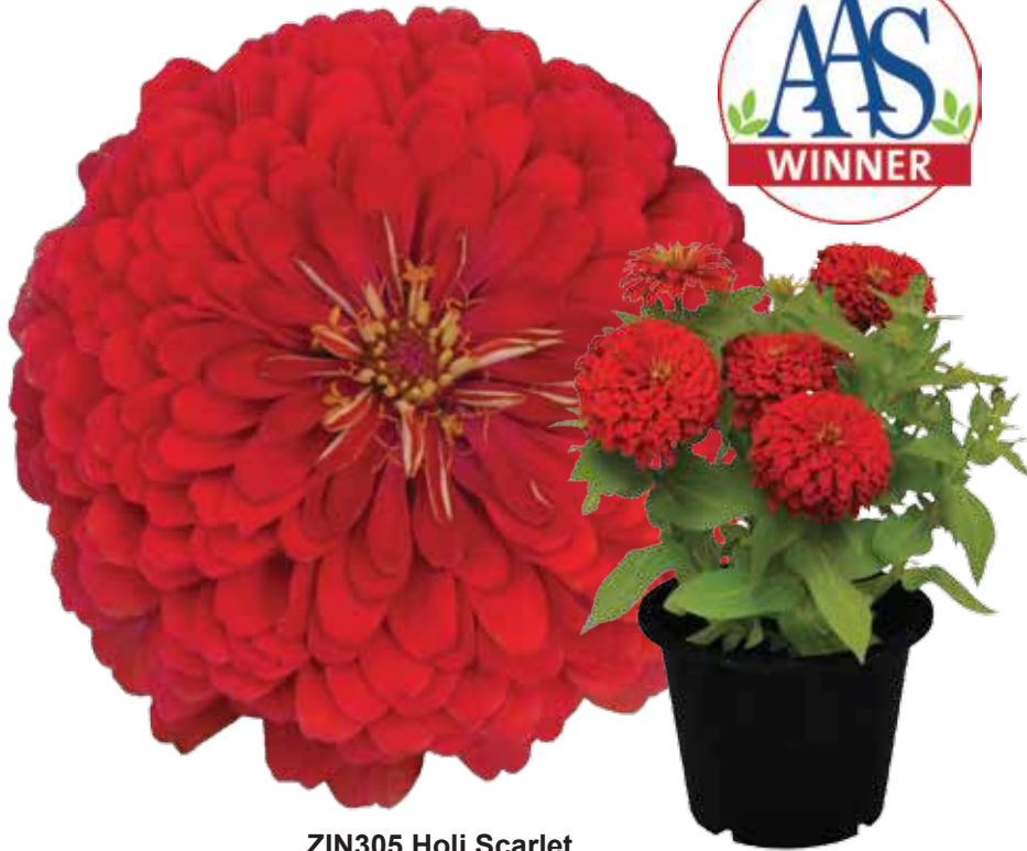
ZIN305 Holi Scarlet