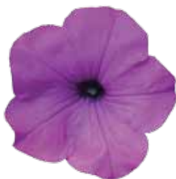
PET160 Radiance Grape