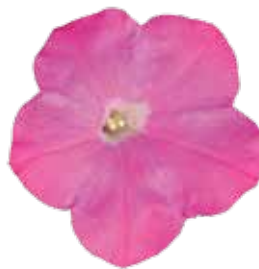
PET154 Radiance Pink