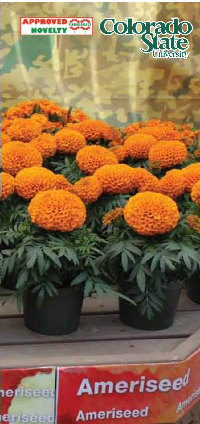
MAR352 Little Duck Orange