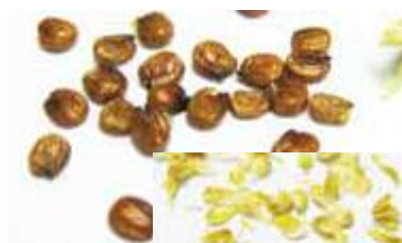
Rubbed Seed Natural seeds passed through a rubbing process to remove seed coat & hair to improve germination and reduce disease.