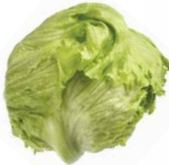
LET023 Hot Springs Iceberg