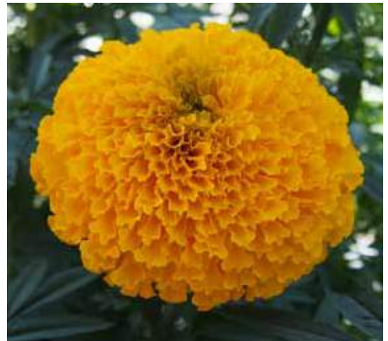
MAR063 Jedi Gold

Excellent adaptability to a wide range of climates.