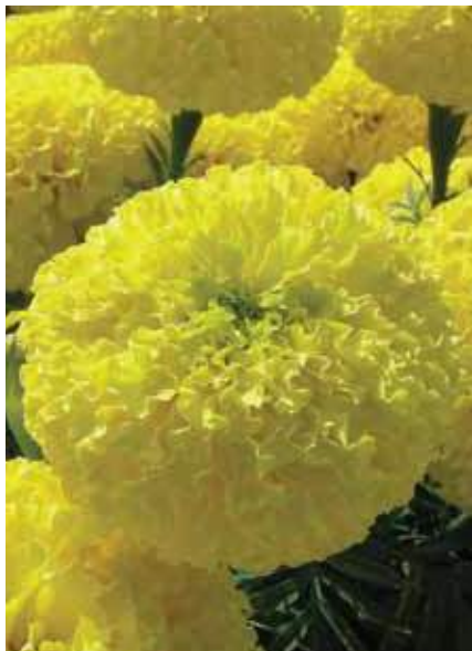
MAR311 Bali Yellow

"Bali" is bred and tested under tropical conditions. Excellent for cut flower production with high yields. The plant produces over 100 flowers. Plants are strongly branched and will not fall over during heavy rain. Flowers are round and firm. Heat loving and disease tolerant.