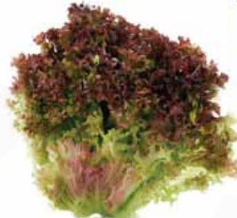
LET029 Hot Springs Baby Red Coral