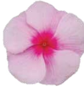
VIN511 Mega Bloom Strawberry