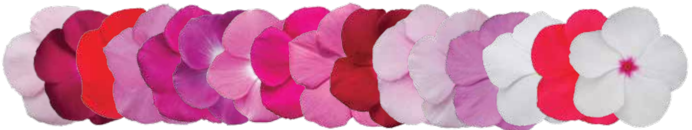
VIN500 Mega Bloom Mix