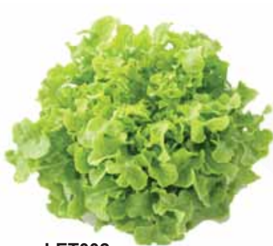
LET002 Hot Springs Green Oakleaf