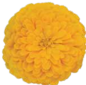
ZIN302 Holi Yellow