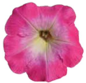
PET155 Radiance Pink Morn