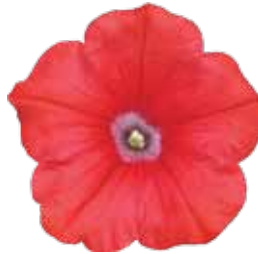
PET158 Radiance Red