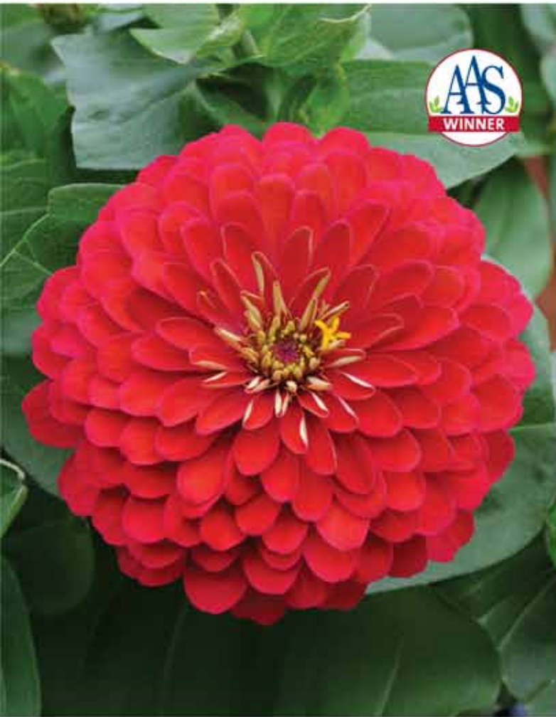
Zinnia Holi Scarlet