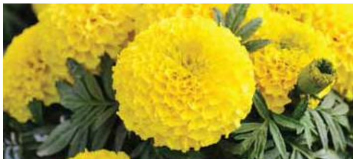
MAR351 Little Duck Yellow

“Little Ducks” have tube shaped, tightly clustered petals and are suitable for pots, beds and mass plantings. “Extremely heat tolerant”.