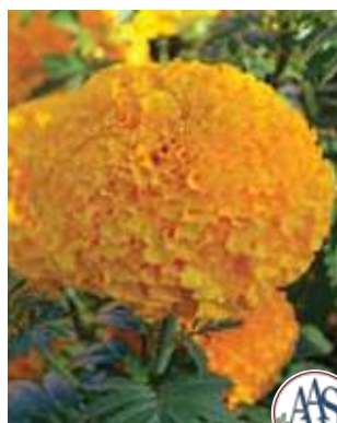
MAR888 Garuda Deep Gold