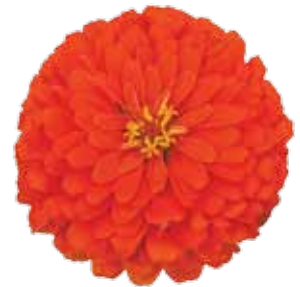
ZIN304 Holi Orange