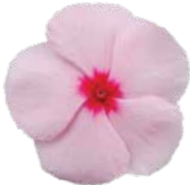
VIN501 Mega Bloom Apricot