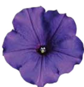
PET152 Radiance Blue