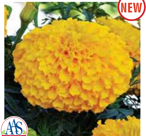
MAR348 Big Duck Gold