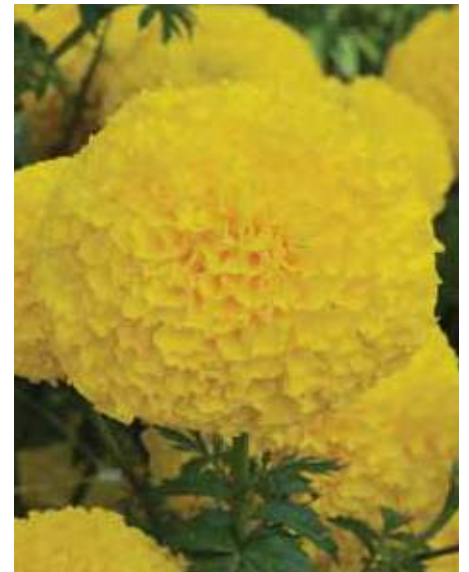
MAR332 Oriental Yellow