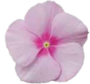
VIN512 Mega Bloom Icy Pink