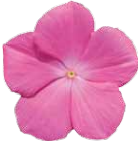
VIN509 Mega Bloom Peach Pink