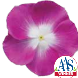
VIN506 Mega Bloom Orchid Halo