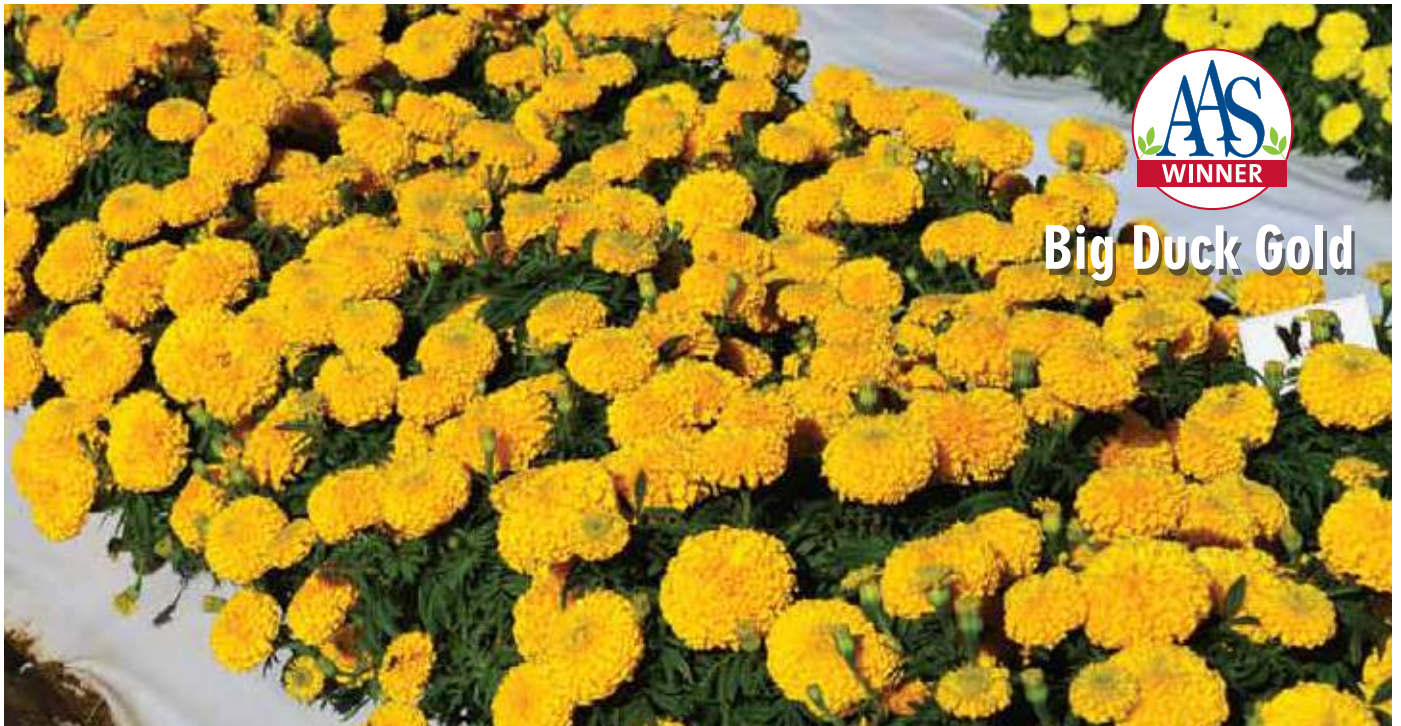
Big Duck Gold