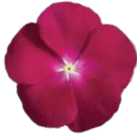
VIN502 Mega Bloom Raspberry