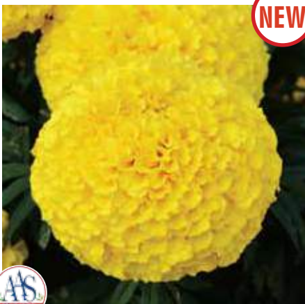
MAR346 Big Duck Yellow