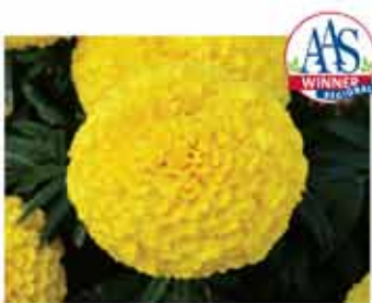
Marigold Big Duck Yellow