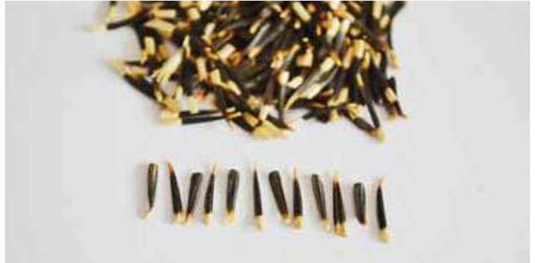
De-Tailed Seed Seed with tails removed for improved handling and sowing.