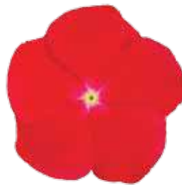
VIN503 Mega Bloom Red