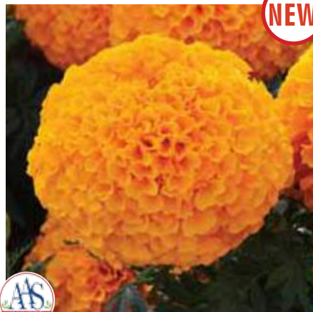
MAR347 Big Duck Orange