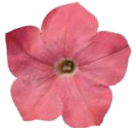
PET159 Radiance Salmon