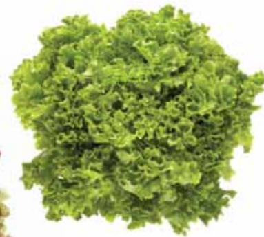
LET024 Hot Springs Frilly Iceberg