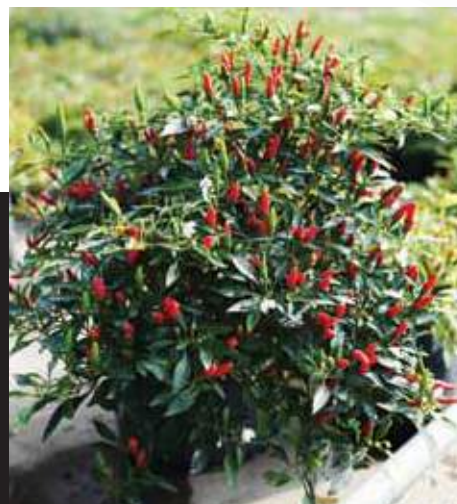
PEP000 Demon Red

Vigorous plant with very high yields. "Chaw" is compact and excellent for home garden use. Fresh fruits are green turning to red when mature.