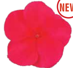
VIN516 Mega Bloom Dark Red