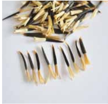
Natural Seed High quality non treated seed.