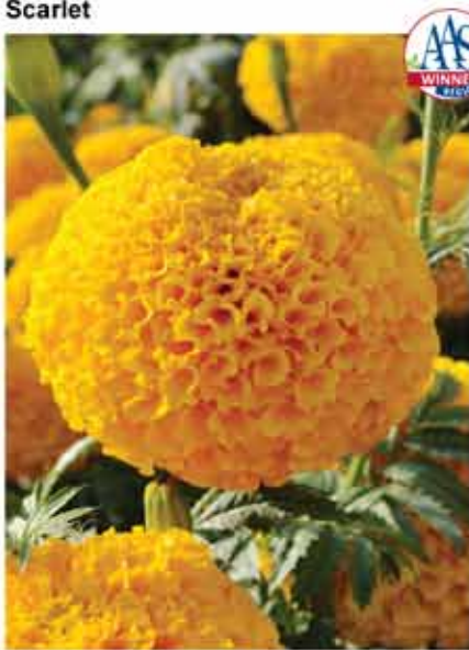
Marigold Garuda Deep Gold