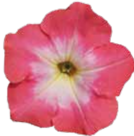
PET153 Radiance Salmon Morn