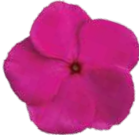
VIN505 Mega Bloom Grape