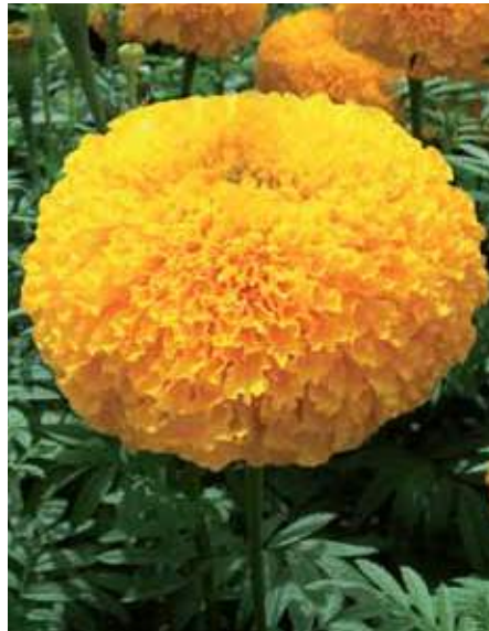
MAR337 Oriental Gold