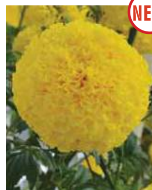
MAR889 Garuda Yellow