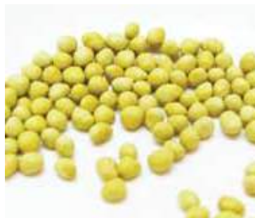
Multipelleted Seed 3-6 seeds within a pelleted shell.