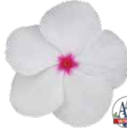
VIN515 Mega Bloom Polka Dot