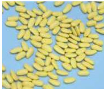
Coated Seed Polymer coated seed for easy handling sowing and enhanced visability.