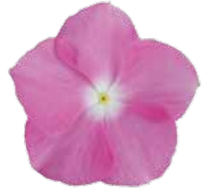
VIN504 Mega Bloom Pink