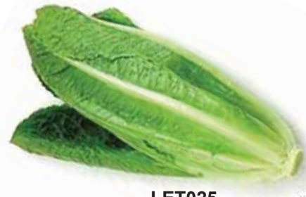
LET025 Hot Springs Cos