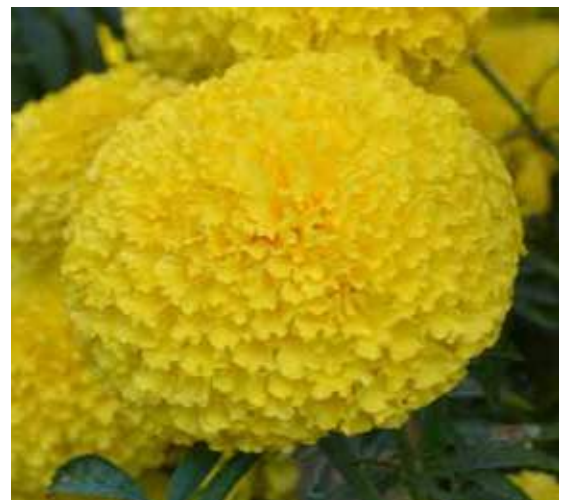
MAR066 Jedi Yellow