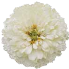
ZIN301 Holi Ivory White

"Loved this plant, color is gorgeous and perfect compact form for mass planting"