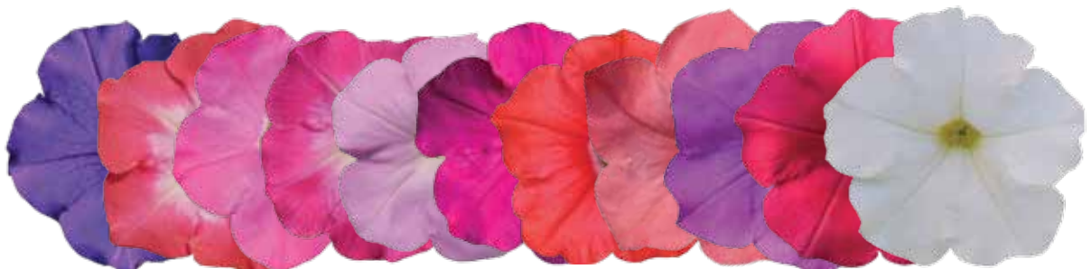
PET150 Radiance Mix