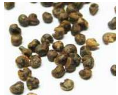
Primed Seed Seed with higher, and faster germination producing more even emergence & uniform seedlings.