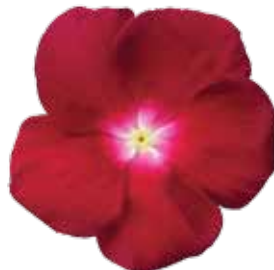
VIN510 Mega Bloom Burgundy with Eye