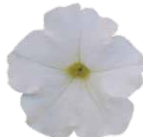
PET162 Radiance White