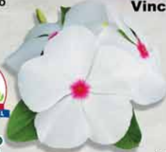
Vinca Mega Bloom ® Polka Dot