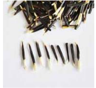
Chemical Treated Seed Seed treated with a fungicide for helps increase germination & seedling survival.