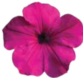
PET157 Radiance Purple