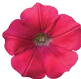
PET161 Radiance Neon Rose