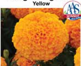
Marigold Big Duck Orange