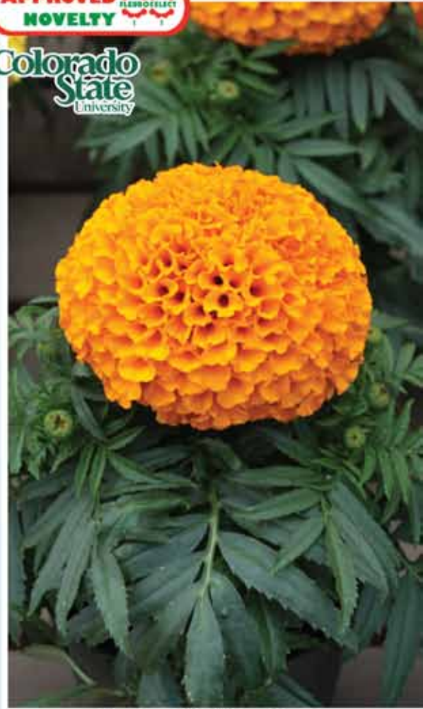
Marigold Little Duck Orange