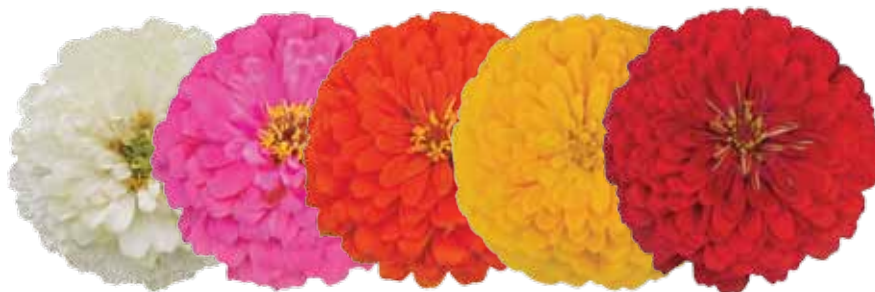
ZIN300 Holi Mix