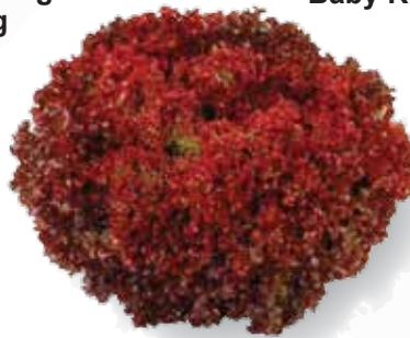
LET028 Hot Springs Red Coral