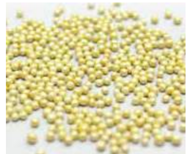
Pelleted Seed Small seeds covered with a pelleted shell to provide easy sowing & enhanced visability.