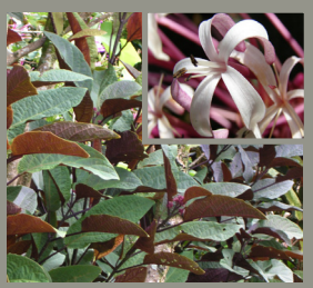
Don't confuse with invasive clerodendrum, which lacks the 3 prominent veins.