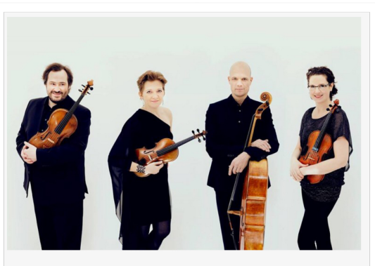
HALLO! ICH BIN DIE NEUE GEIGERIN Norman Lebrecht On January 18, 2016

Here's the first lineup pic of one of Europe's elite formations. In re-