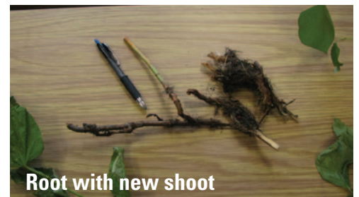
Root with new shoot