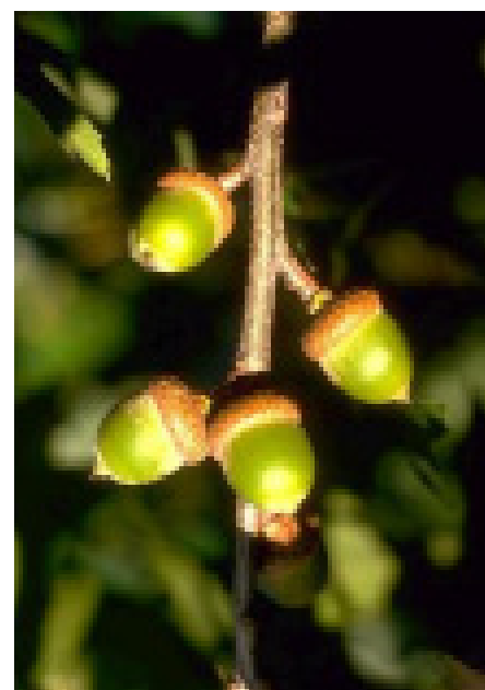
Acorns of (top to bottom) English oak ( Q. robur ), gambel oak ( Q. gambelli ) and red oak ( Q. rubra ). Cover: Bur oak acorn ( Q. macrocarpa ).

"In 1978, this publication was a mere dream, a vision of high aspiration for the 35 initial members. To them, The Seed was six to 12 pages, typed, photocopied and stapled in the corner. To us, this early work was the foundation of a publication that would bring hundreds of Nebraskans information on elm trees and wildflowers, grasses and herbs; a newsletter that would evolve into a means of creating awareness of such issues as energy conservation, plant endangerment and community resources."