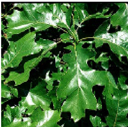
The handsome, lustrous foliage of black oak ( Quercus velutina ).