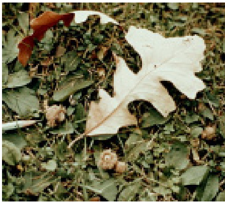
The distinct shape of bur oak leaf ( Quercus macrocarpa ) in autumn.