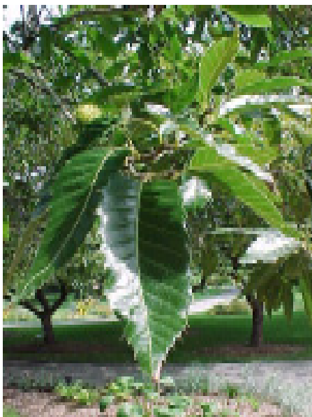
The glossy, chestnut-like leaves of sawtooth oak ( Quercus acuttissima ).