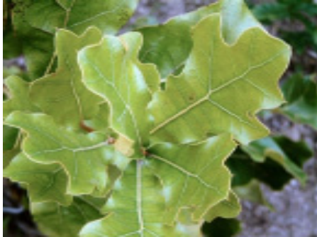
The thick, leathery leaves of blackjack oak ( Quercus marilandica ).