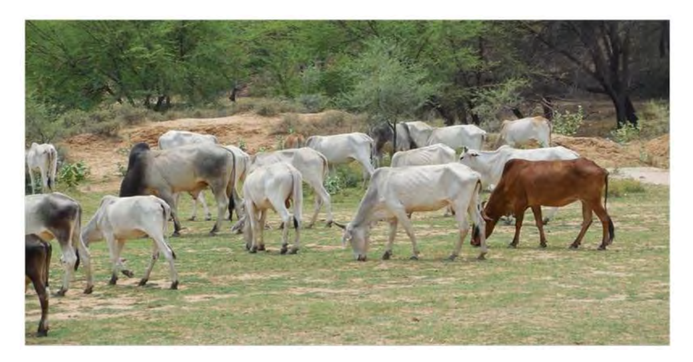
Fig 1.2 Potential for Biogas Energy

On the basis of Purchasing Power Parity (PPP), South Asia energy intensity is lower than the world average, including the United States and China. Energy intensity is based on commercial fuels. These low numbers also reflect a high proportion of non-commercial energy, e.g., traditional biomass, etc.