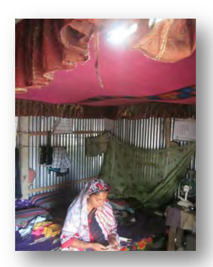
Fig 5.1.3 Rupali sewing in solar-powered light at night

The village Khowamuri is now well along the path of sustainable and environment friendly development.