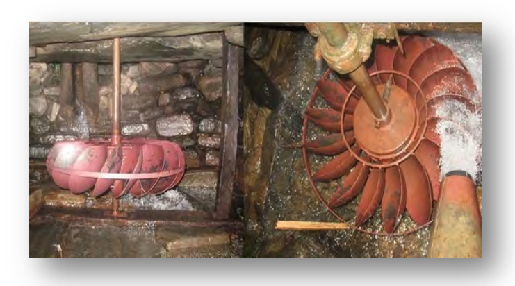
Fig 5.4.4 Improved water mill

The Improved Water Mill technology complements the essence of the ecovillage development concept. Not only is it a source of clean energy, it also has enhance cobenefits that can rural livelihoods. It is ideal for the hilly terrain of Nepal, which has plenty of water resources and enough height for the system to work. Over the last few decades, many changes have been made to the technology, making it more efficient, time-saving, and versatile in use. The Center for Rural Technology, Nepal (CRT/N) has implemented an enhanced