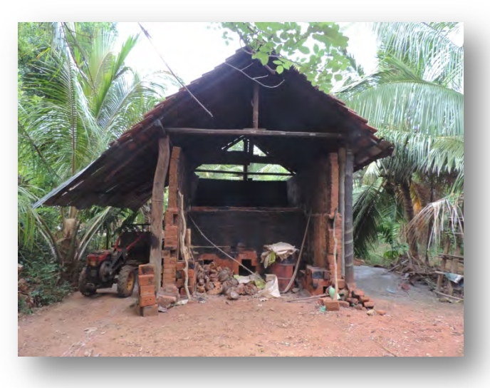
Fig 5.3.2 Dharmarantne's improved and permanent brick kiln

firewood openings. Importantly, both firewood and rice husk can be used as firing fuels. This kiln also has additional firing channels. With the upgraded procedures, the stacking of bricks inside the kiln is done systematically with interlayer gaps to be filled with paddy husk to improve the heat circulation and to get the maximum heat benefit. The improvements in the brick kilns has reduced the consumption of firewood substantially, creating additional economic benefits for brickmakers such as Dharmaratne while also reducing tree-felling for firewood. This, in turn, has eliminated