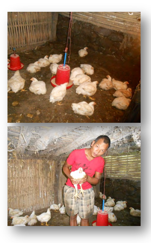
Fig 5.4.5 and 5.4.6 IWMEChicken houes and Chicken Man

Each batch of chicks requires 45-60 days to turn into adults. and then they are sold in the market. The chickens are consumed in his own village, as there are lots of meat lovers in his community. He sells the chickens at the rate of 250 per kg (the average weight of one chicken is 2.5 kg). So, from one batch of chickens, he makes a profit of approximately NPR 11,000 providing an important boost to his previous income.