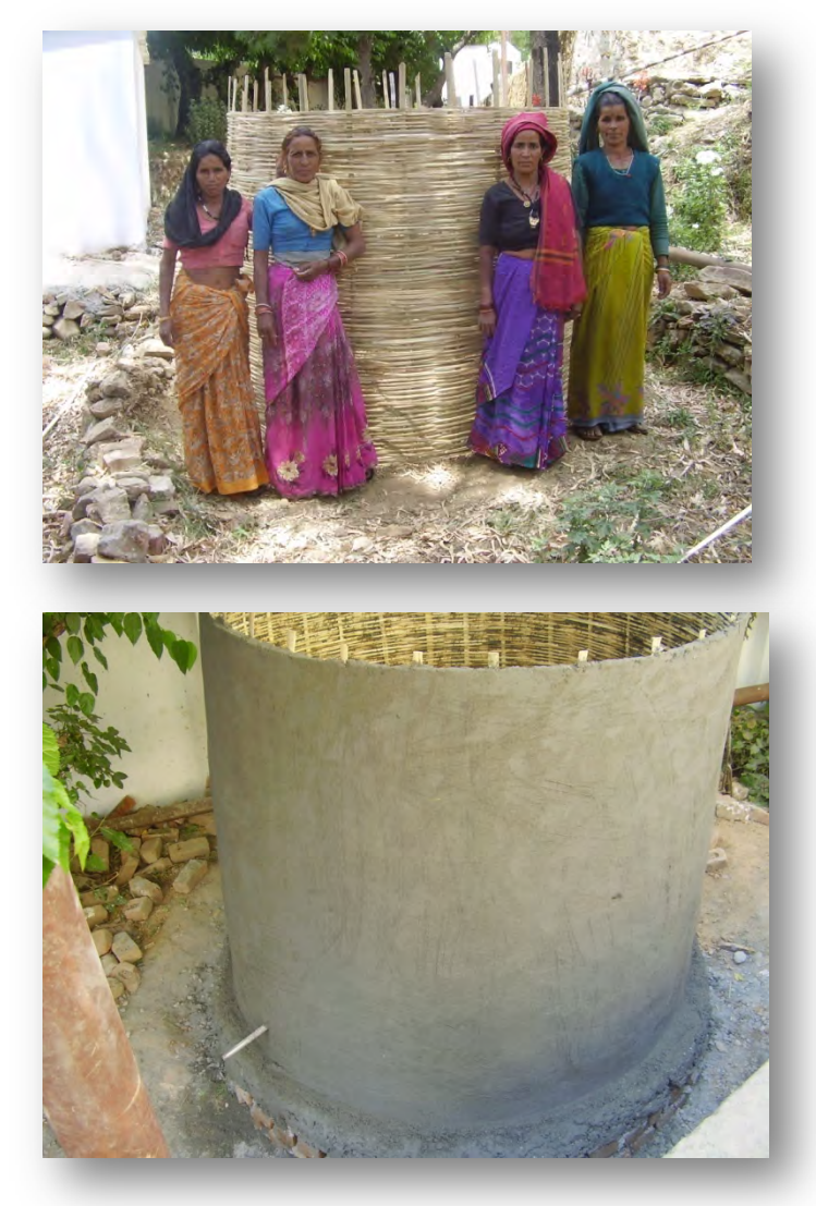
Fig 5.2.6.1 and Fig. 5.2.6.2 Bamboo-cement based rain water storage tank under construction

Once the water in the tank had been depleted, the women beneficiaries spoke to the guard at the university campus and worked out a deal with him. He allowed them to use a long water pipe to bring water to fill their tanks. Thus, even if there were no rains, these women would have access to water near their homes all through the year.