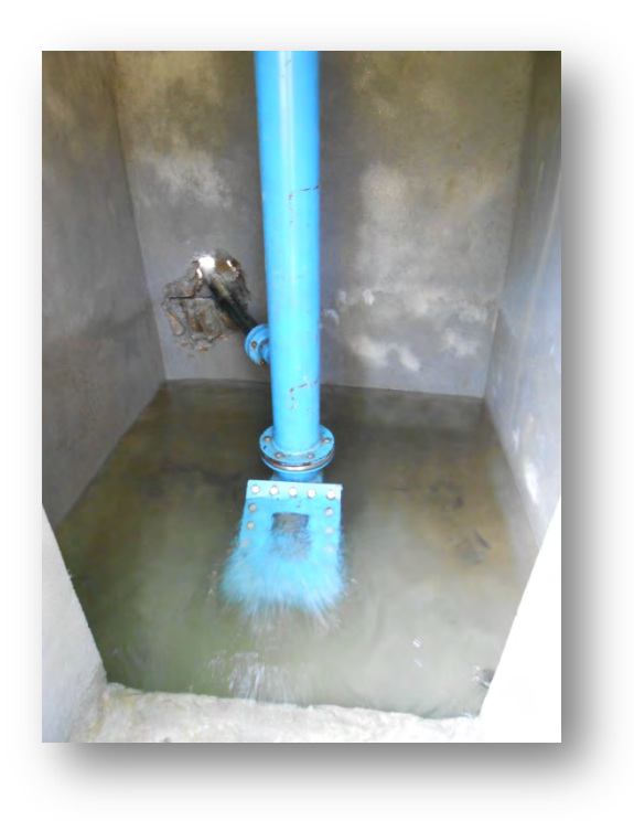
Fig 5.4.1 Hydram