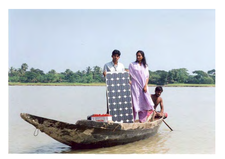
Fig 1.3 Solar Technology for Island Dwellers in Bangladesh

These challenges can be met by increasing energy efficiency through innovations in technology and processes, as well as by increased use of renewable energy, resulting in lower emission increases and eventually, in emission reductions.