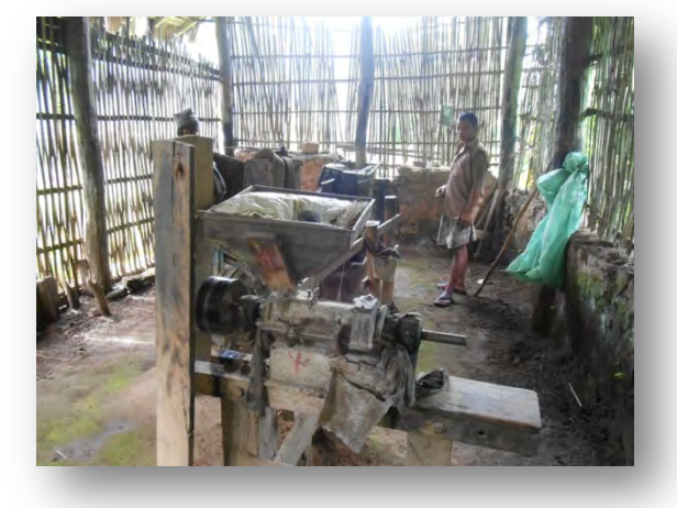
Fig 5.4.8 Rice huller integrated with IWME

In earlier days, processing in the diesel-based mill was very expensive compared to processing in a rice huller integrated with IWM. The cost of processing 1 Muri of paddy (approximately 70 kg) in a diesel mill is NPR 70, whereas processing same quantity in an IWM system now cost only NPR 25/kg.