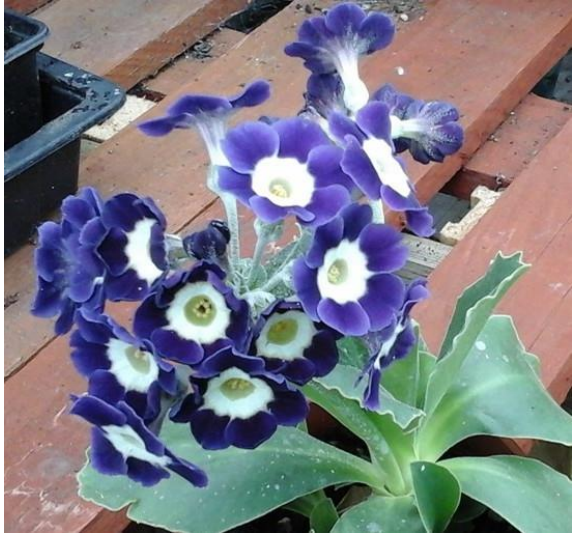
Eden Blue Star

Border varieties: tough fleshy leaves that are sometimes powdery