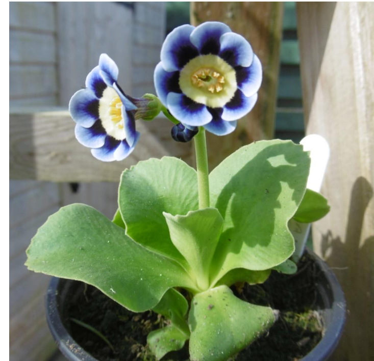
Victoria de Wemyss