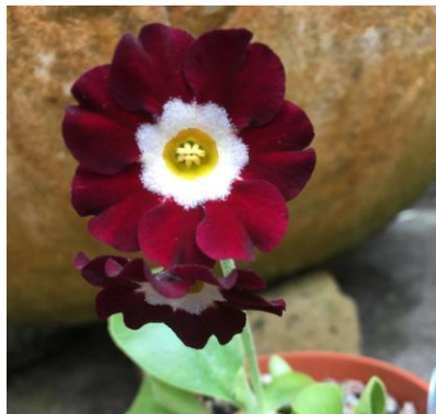
Old Clove Red